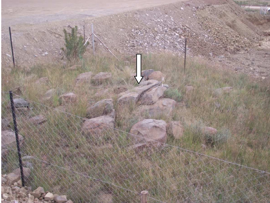
Fig. 15: Before the engraving was removed. Arrow indicates the engraving in situ . (Photo taken from south, facing north)