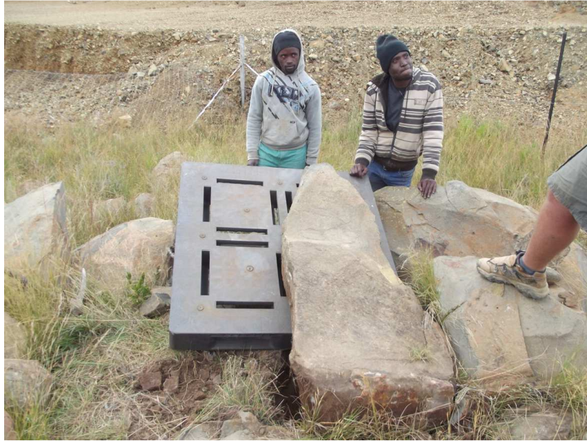
Fig. 25: View of the engraving as it was lying on the plastic pallet.