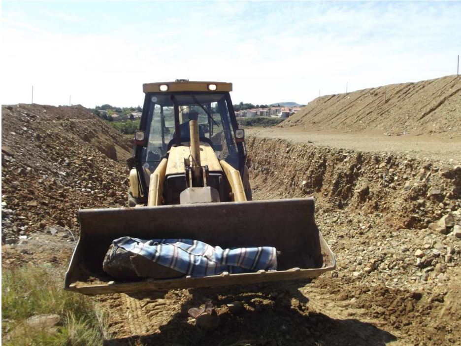
Fig. 29: The TLB transported the rock engraving to the Lydenburg Museum.