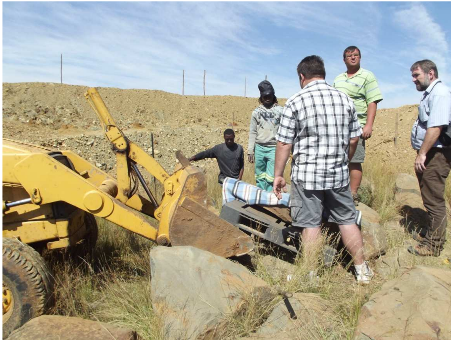
Fig. 27: A TLB was able to position the scoop below the pallet with the engraving.