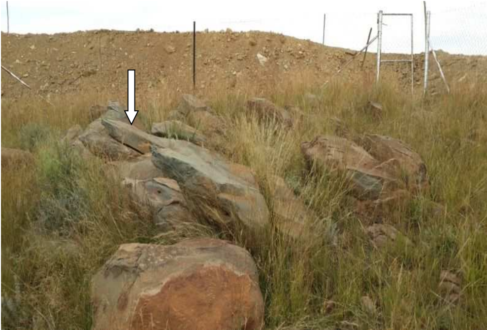
Fig. 19: Before removal of engraving. View from north facing south.