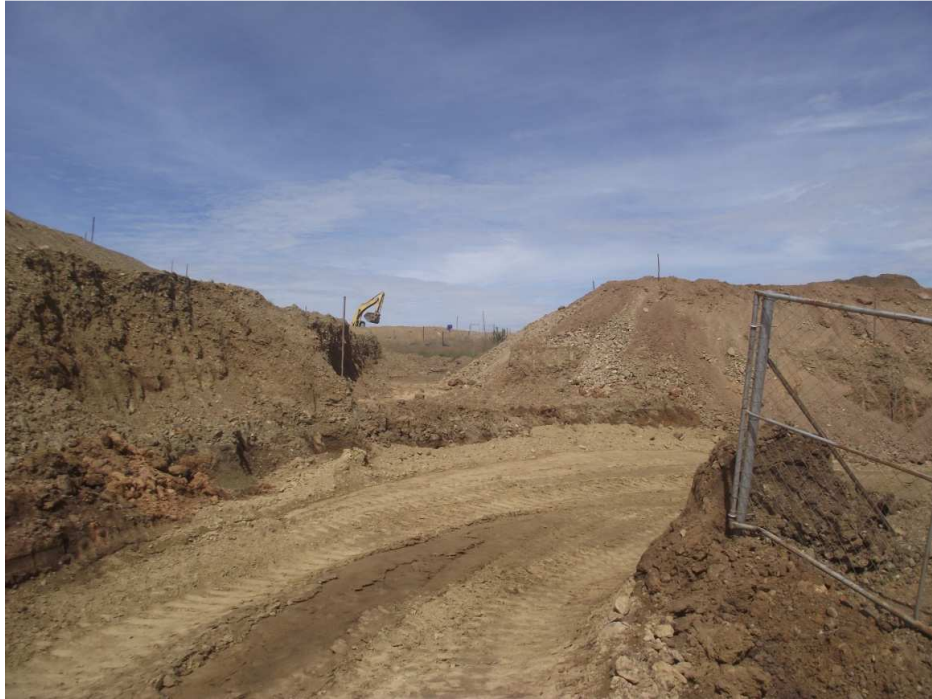
Fig. 21: View of the terrain before the engraving was removed. The engraving is situated in front of the excavator.