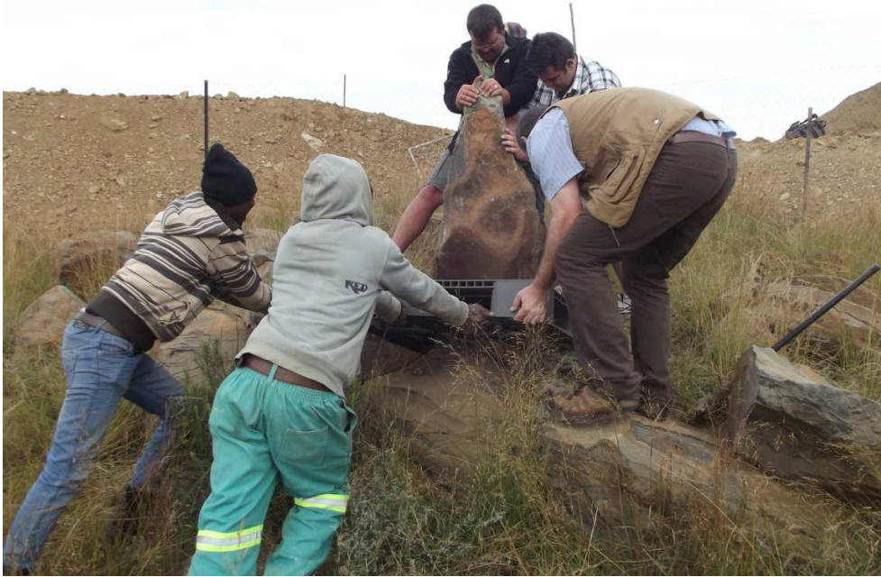
Fig. 23: A plastic pallet was placed beneath the engraving as a buffer and for support.