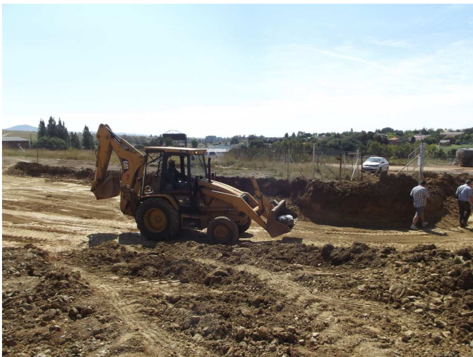
Fig. 30: The engraving on the way to the Lydenburg Museum.