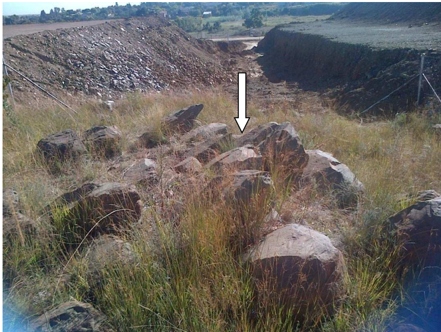
Fig. 16: After the engraving was removed. Arrow indicates the position. View from south facing north.