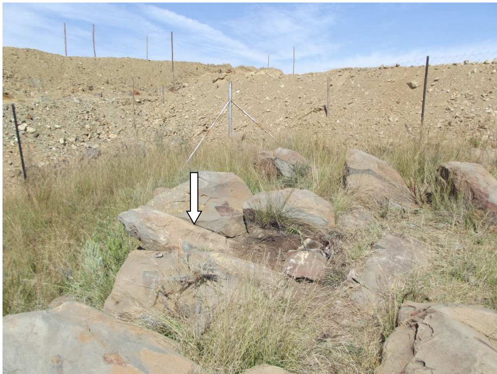
Fig. 20: After removal of the rock engraving. View from north facing south.