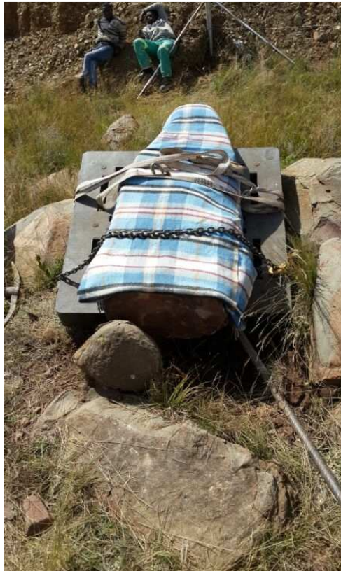
Fig. 26: The engraving was covered with a blanket for protection.