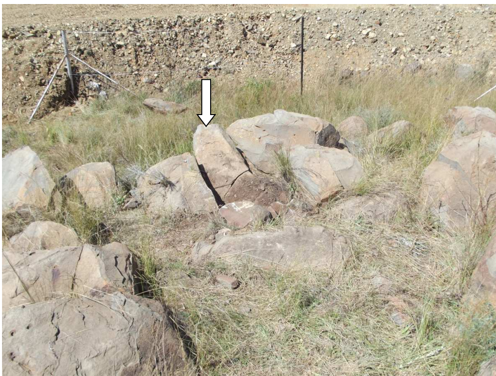
Fig. 18: After the engraving was removed: View from west facing east.