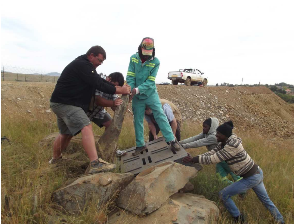
Fig. 24: Lowering the rock engraving onto the plastic pallet.