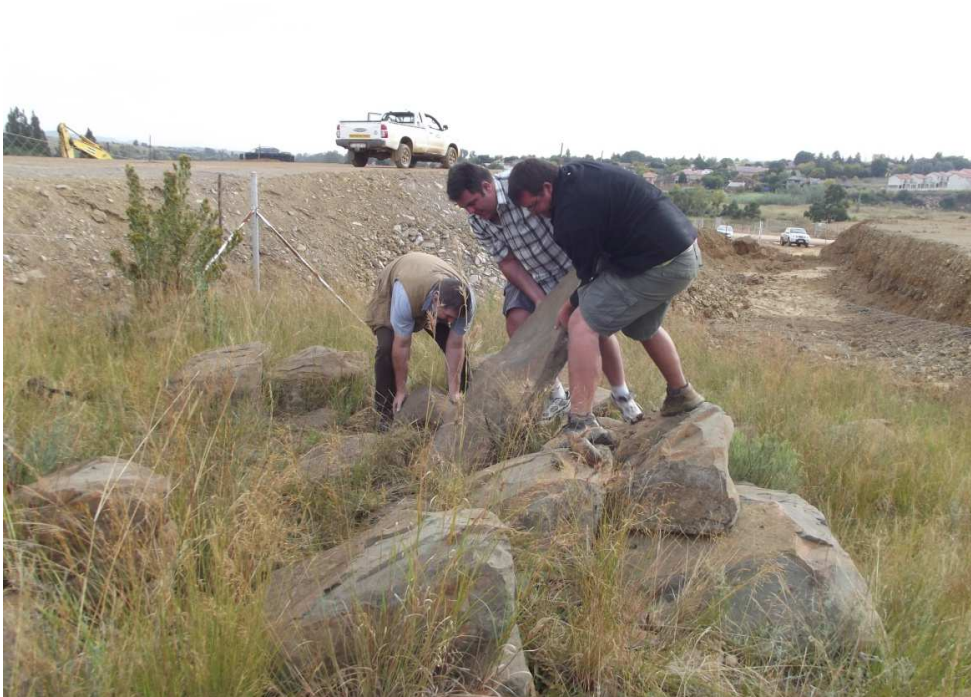
Fig. 22: The rock engraving was lifted manually.