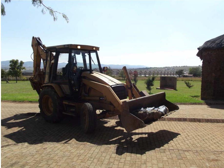
Fig. 31: The TLB and engraving arrived at the Lydenburg Museum.