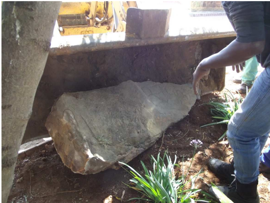
Fig. 32: The rock engraving was temporarily placed near the entrance of the museum building.