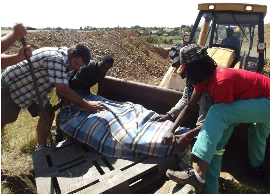
Fig. 28: The engraving was moved into the scoop of the TLB.