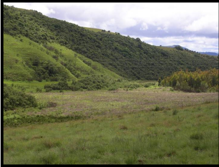
Figure 3. Proposed dam site 1.