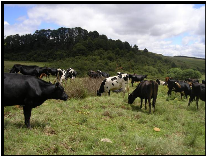
Figure 6. Proposed dairy site.