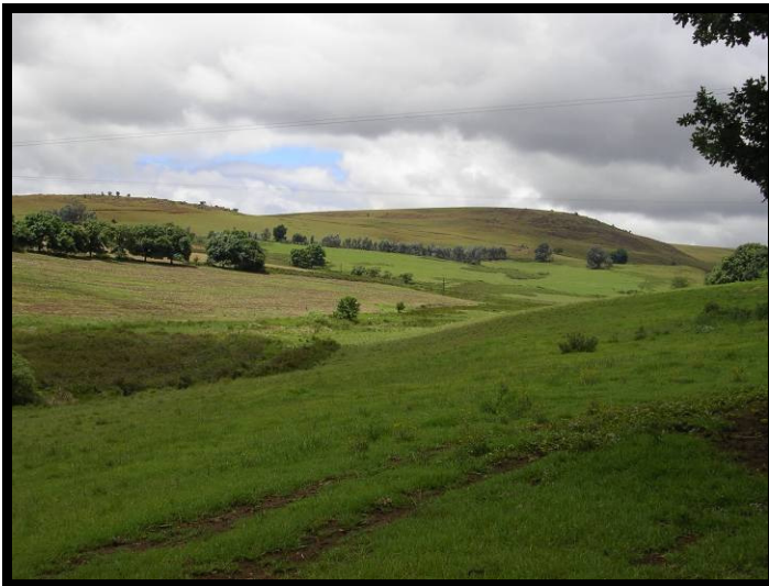
Figure 4. Proposed dam site 2.