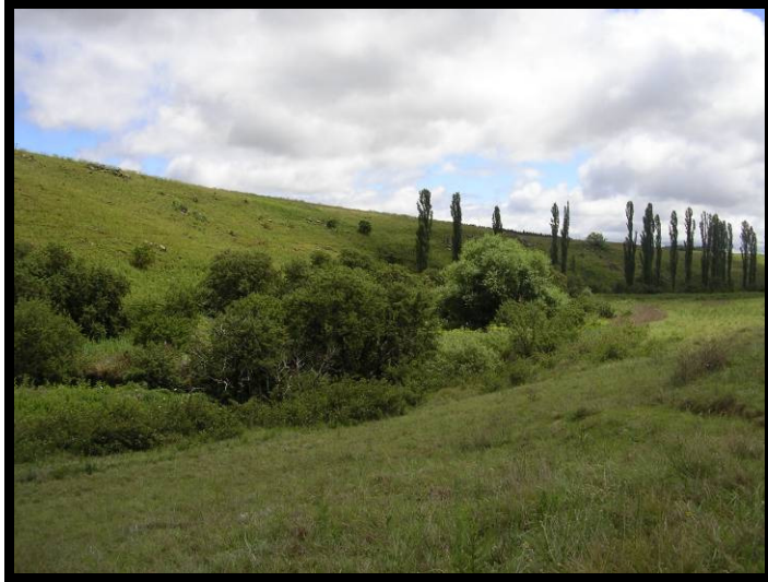
Figure 5. Proposed dam site 3.