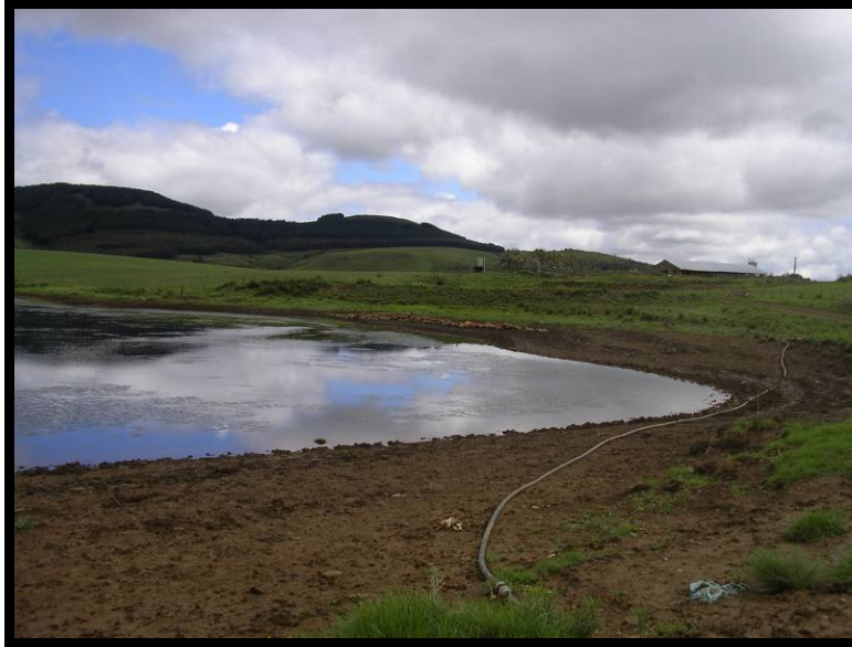
Figure 7. Proposed raise of dam wall