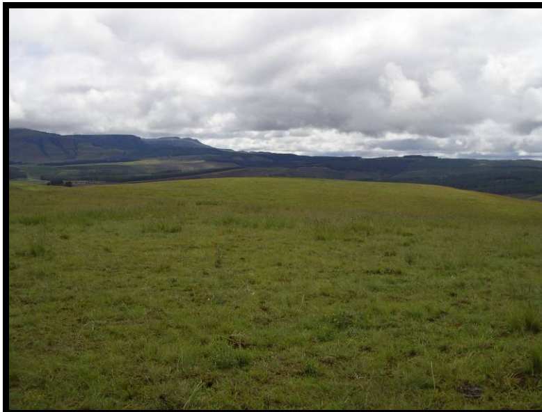
Figure 8. Proposed cultivation of 131ha of veld