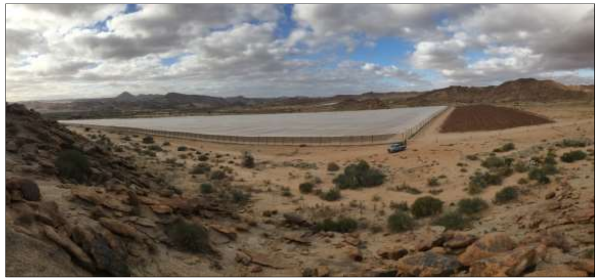
Figure 8. Block 3 (22ha). View facing north east

Archaeological Impact Assessment, illegal vineyard development on the Farm Norriseep near Onseepkans, Northern Cape