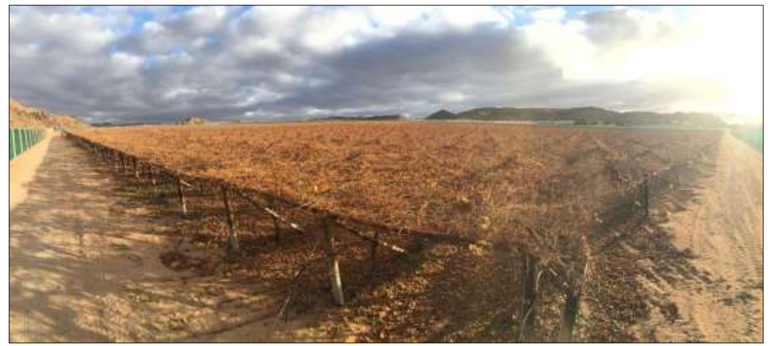
Figure 5. Block 1. View facing south west