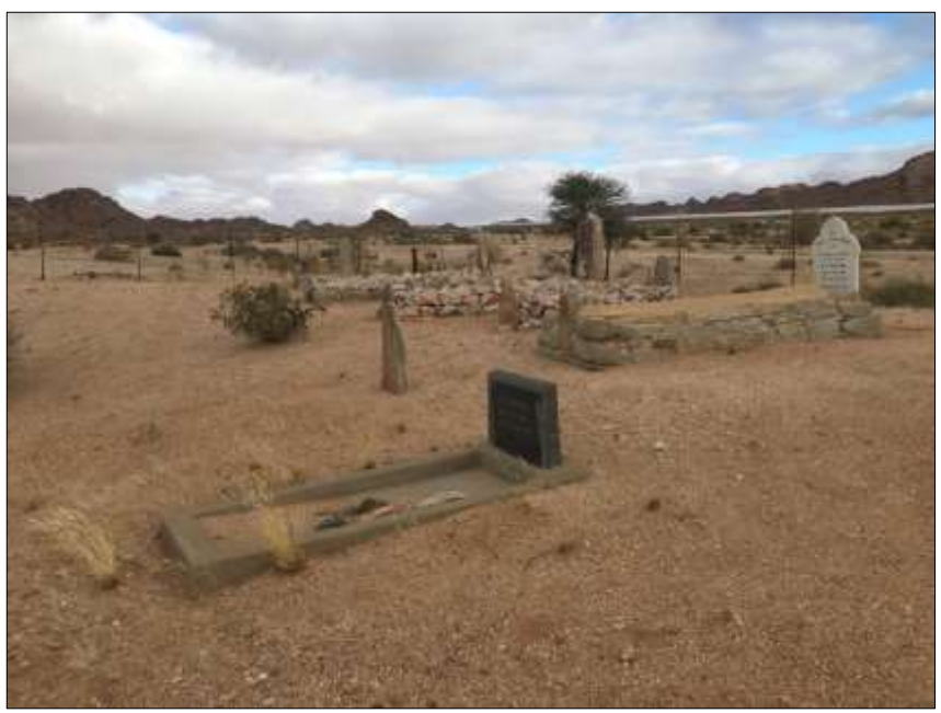
Figure 11. Family graveyard

A small family graveyard was recorded on the farm, but is located a considerable distance from the illegal vineyard development (Figure 11).