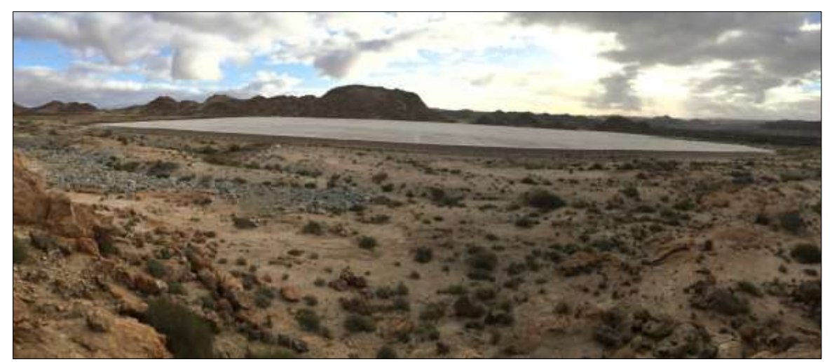
Figure 9. Block 3. View facing north west