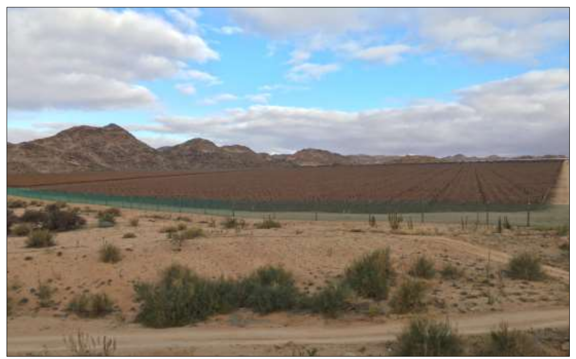
Figure 4. Block 1 (26ha). View facing south

The three blocks of vineyards, totally \pm 56ha were illegally developed between 2006 and 2007 (Figure 4-9).