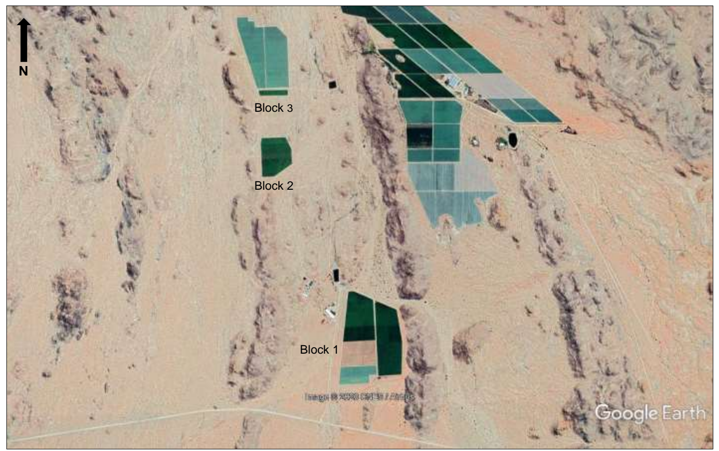
Figure 4. Google satellite map indicating the 3 Blocks of vineyards illegally developed between 2006 & 2007