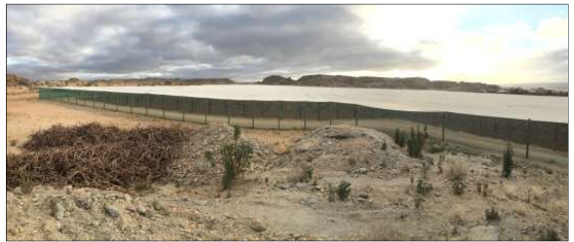
Figure 6. Block 1. View facing north west