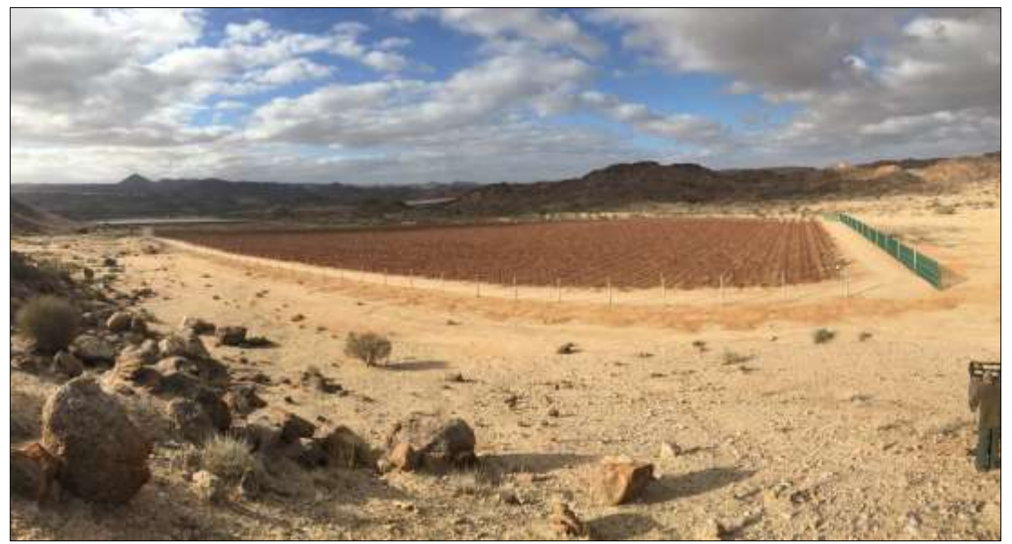
Figure 7. Block 2 (8ha). View facing north east