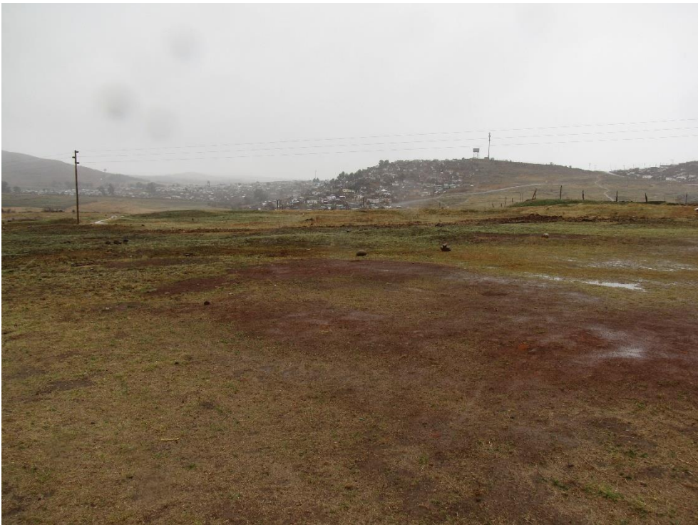
Figure 4: Facing south from 30°31'56.65"S 29°26'22.87"E