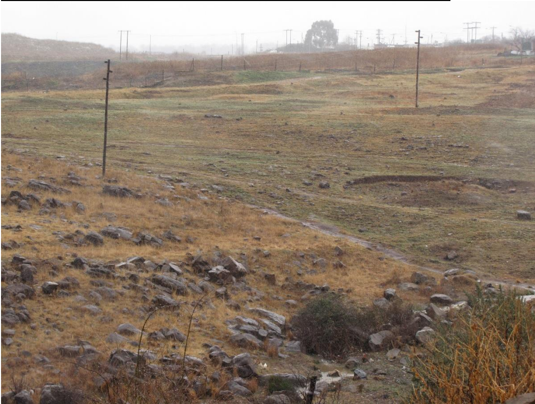
Figure 6: Facing west from 30°31'56.30"S 29°26'25.44"E