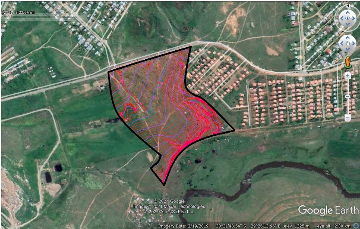
Figure 1: Google Earth photo of study area (black polygon)

The study area is situated in an open area between formal and informal settlements east of Kokstad in Eastern Cape Province. The study site is situated on a hilly terrain that slopes towards the southeast. A railway track forms the southern border of the study site.