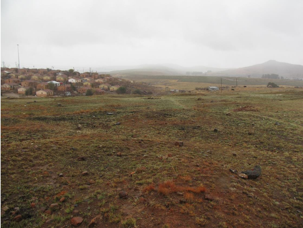
Figure 3: Facing southwest from 30°31'55.63"S 29°26'22.09"E