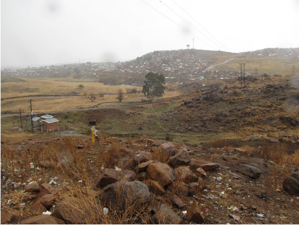
Figure 5: Facing southwest from 30°31'58.31"S 29°26'29.08"E