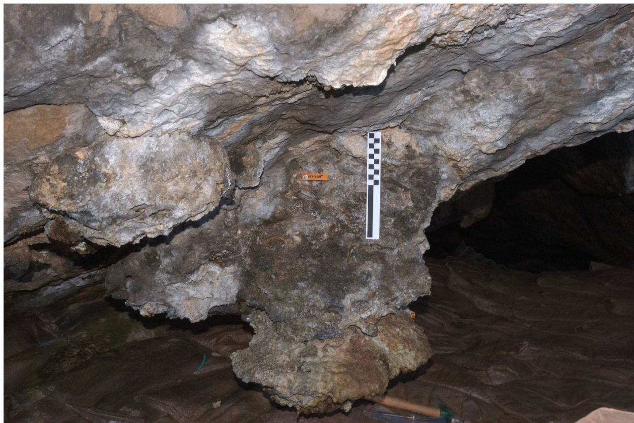
Figure 1. The location of sample 357348 indicated by the orange tag.