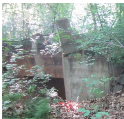
Fig 3 (left): Showing shaped bollard intersected with railway iron railings Fig 4 (above) Dislocated bollard

In plan, the alignment of the railings to both sides of the bridge is similarly distorted, with any symmetry in the past obliterated (see Fig 11). As noted, this could also be due to ground movement or traffic impact (see Fig 4)