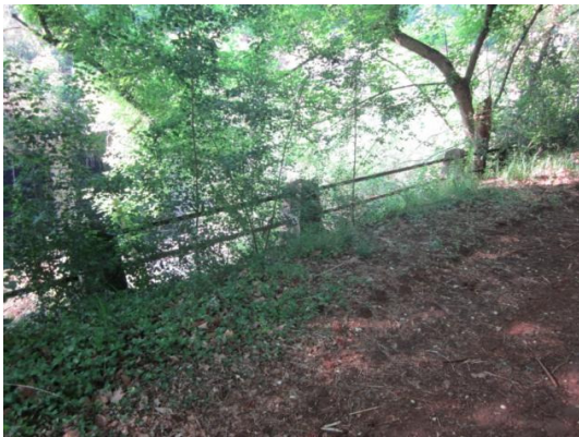
Fig 9: Railings on eastern edge