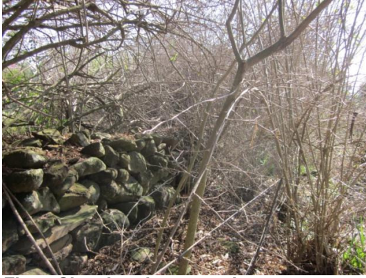
Fig 5: Showing drystone abutments