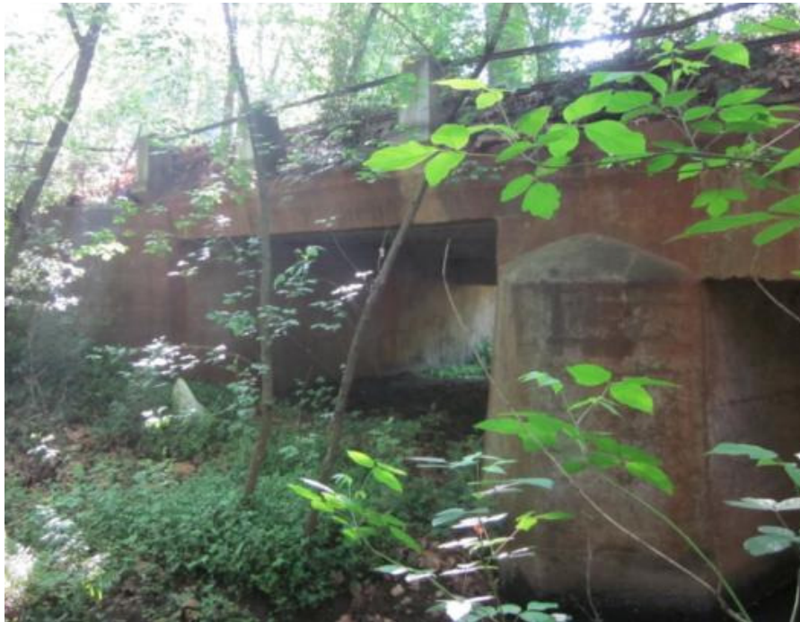
Fig 2: Showing shaped bridge piers (western edge)

The bridge is constructed of off - shutter concrete spanning the river by means of two substantial concrete piers which project beyond the sides of the bridge (see Fig 2 below). A protective railing consisting of two rails of railway iron spans a series of shaped bollards (see Fig 3 below) some of which are unstable, and out of line possibly due to being hit by traffic in the past, or ground movement.