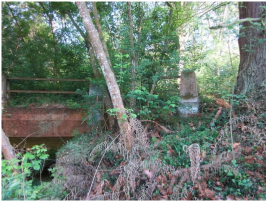
Fig 7: Eastern edge – bollard to be destroyed