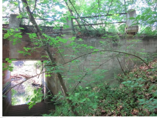
Fig 6: Bridge from west - upstream