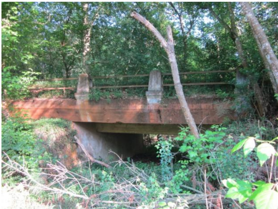
Fig 1: Showing old bridge from the R56

The bridge is a modest structure that crosses the Mkhuzane River close to the contemporary road bridge on the R56 which leads from Pietermaritzburg to Richmond at GPS co-ordinates S 29°48'28.5" and 30°20'8.5"E. The track crossing the bridge is dirt and it travels parallel with it for some distance. It is visible on the 1937 aerial photographs suggesting that the bridge was extant at the time.