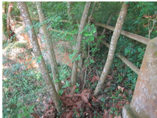
Fig 10: Bollard on eastern edge to be destroyed

Given the use of concrete, and the concomitant use of railway iron, this bridge could well be an early example of the use of concrete in the province.