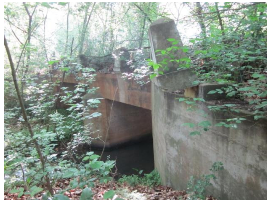
Fig 8: Last bollard on west edge