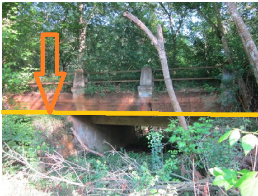
Fig 12: Yellow line - line of pipeline: orange arrow -point of attachment to pier