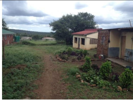
Figure 6: Existing buildings on site