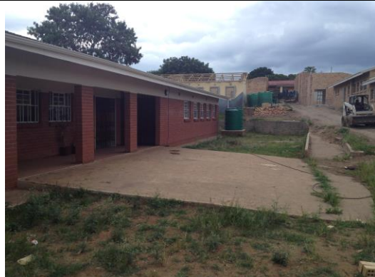
Figure 7: Existing buildings on site.