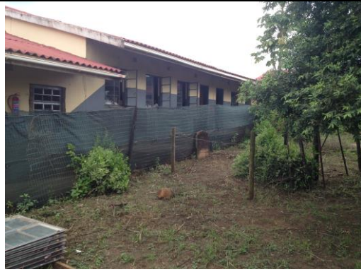
Figure 5: Grave close to existing school buildings