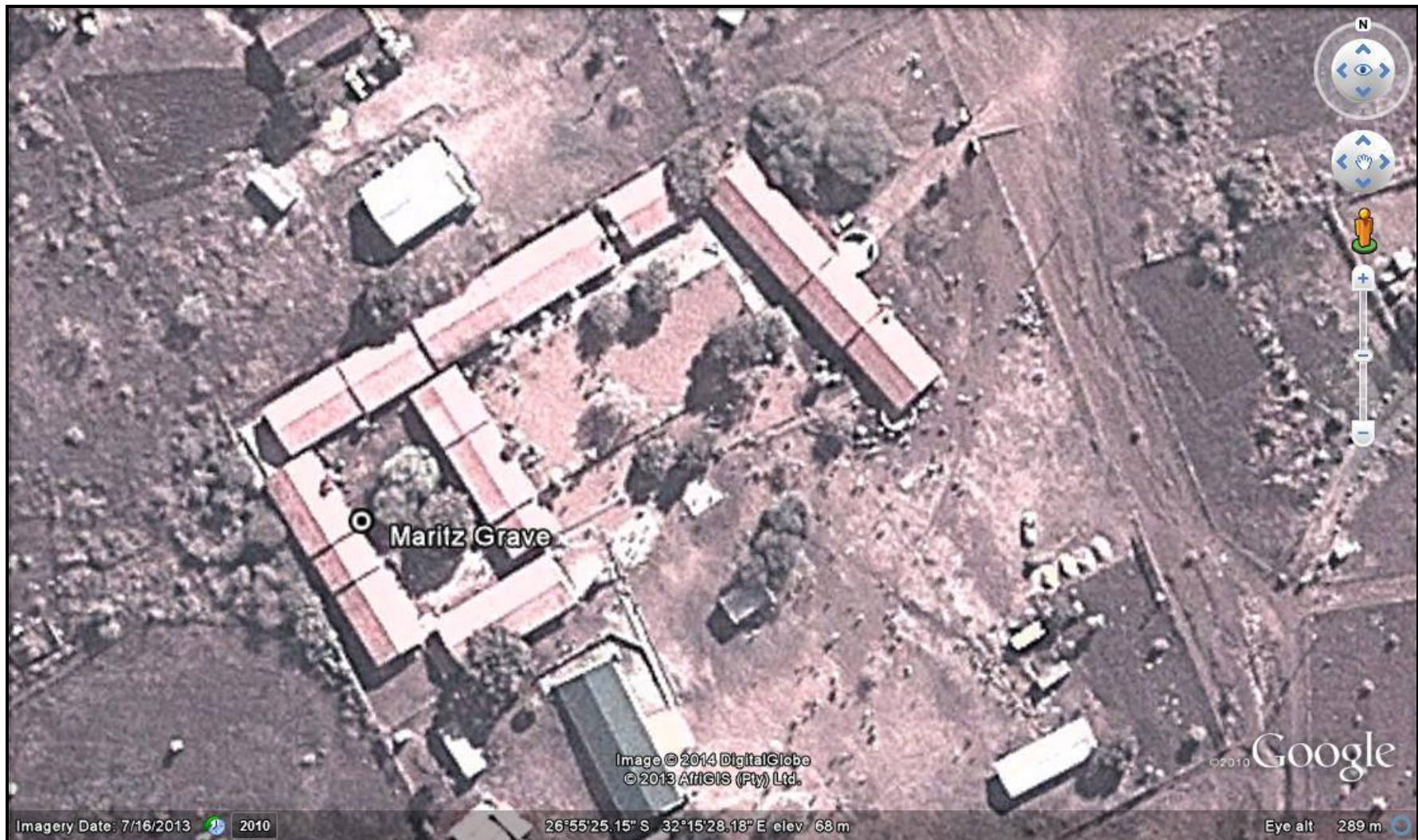
Figure 3: Google Image of the area indicating the location of the grave.