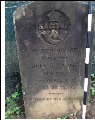
Figure 4. In Scripted sandstone gravestone of Rifleman Maritz