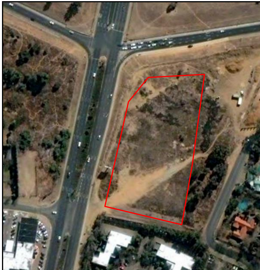
Figure 2: Aerial photo indicating disturbed usage and dumping on site