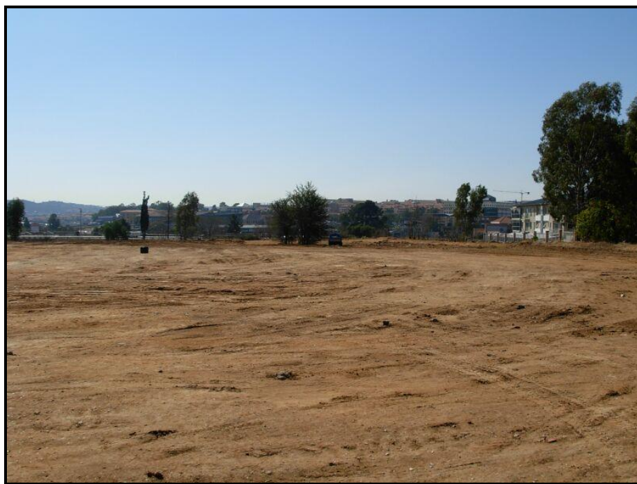
Figure 3: View from south to north on site