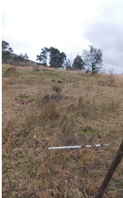
Fig 3. View of cemetery