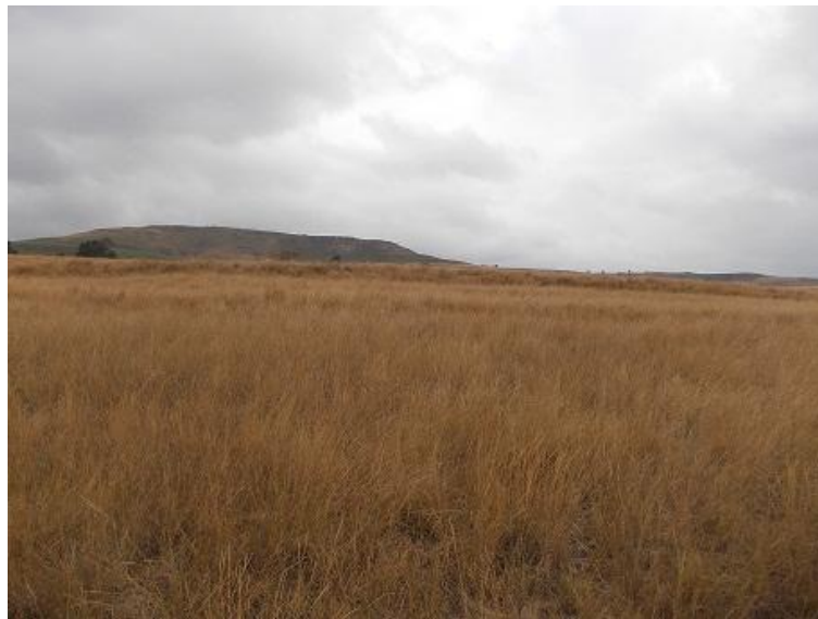
Fig 1. General view of proposed development area

General GPS co-ordinate: S30^{\circ} 26' 55.1'' E29^{\circ} 46' 52.8''