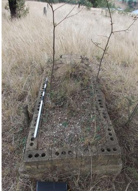
Fig 2. View of a grave