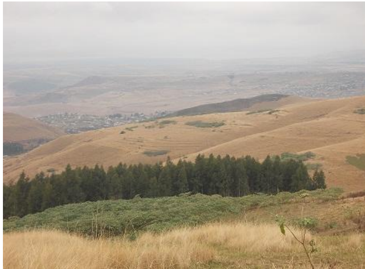
Fig 1. General view of proposed development area

General GPS co-ordinate: S30^{\circ} 23' 19.3'' E29^{\circ} 53' 53.9''