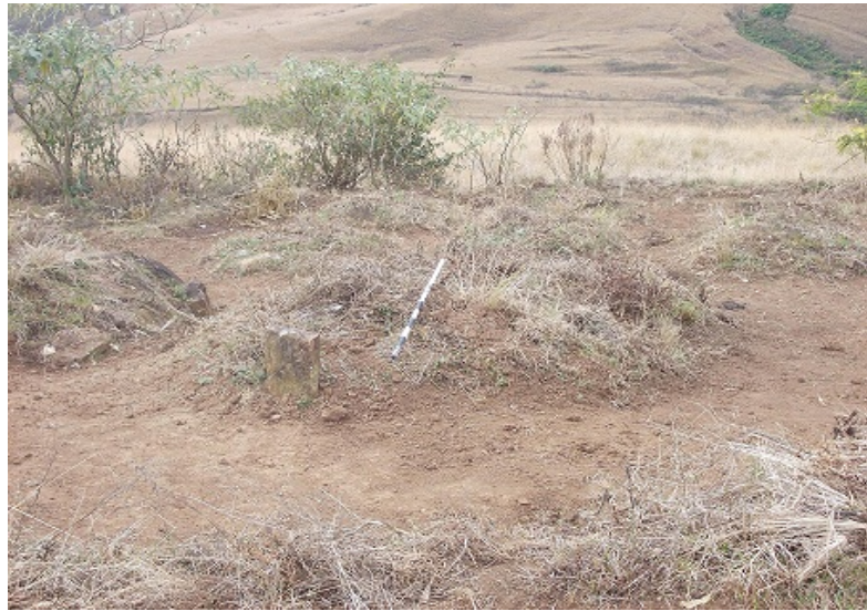
Fig 2. Cemetery