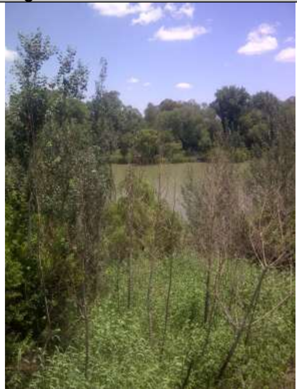
Figure 4: West view of the site