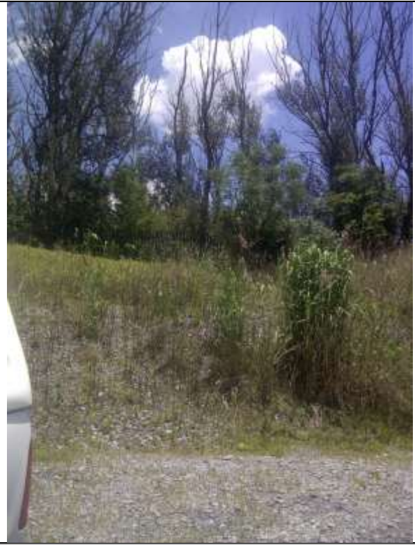
Figure 2: North view of the site