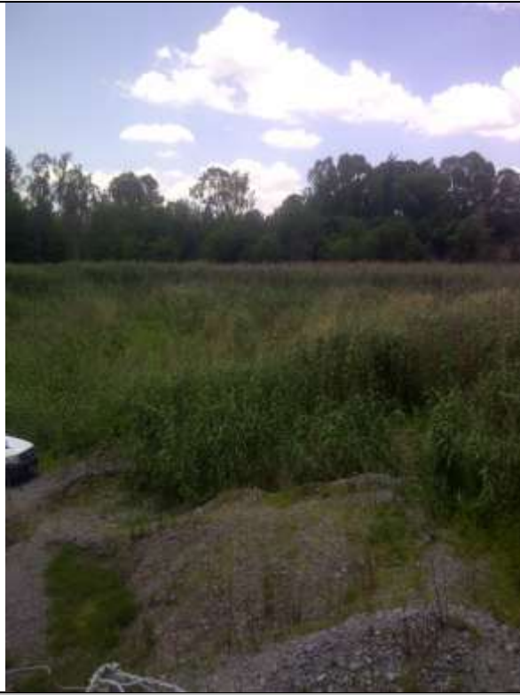
Figure 1: East view of the site