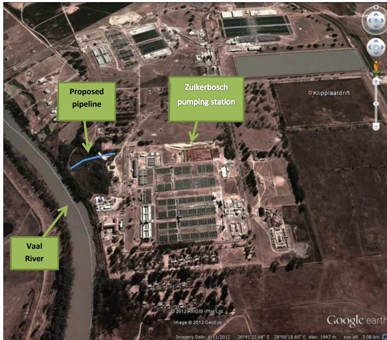
Figure 2: Aerial view of the study area.

Nemai Consulting C.C. CK1999/66215/23 Member : D Naidoo