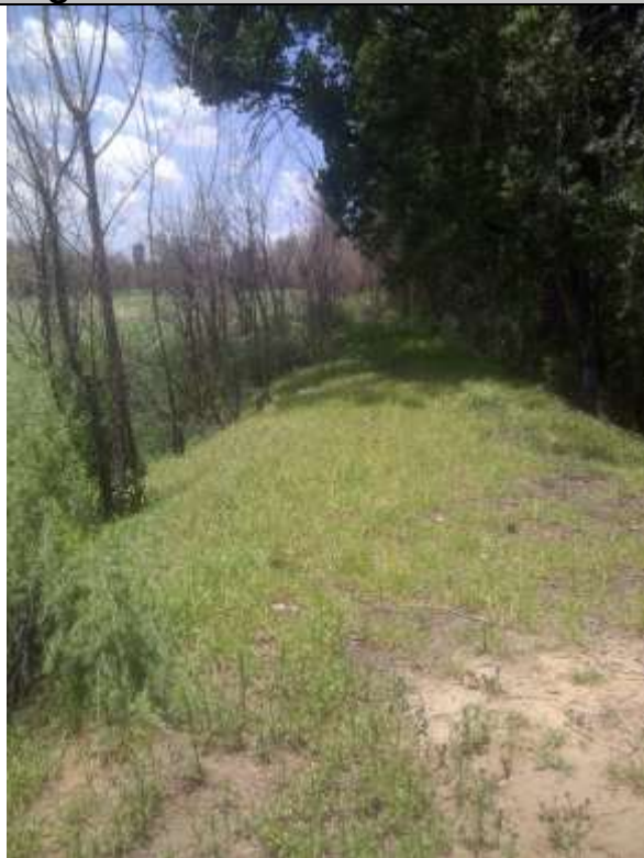
Figure 3: South view of the site