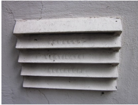
Fig 27: Cast iron ventilator