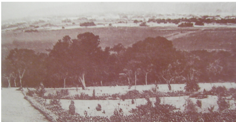
Fig 5: The Durban Botanical Gardens site in the early 1900's (McCracken 1996:68)

The 'Herbarium', consisting of a number of related buildings, is located on the western edge of the Durban Botanic Gardens which were established in 1849 (McCracken 1996: v). 1