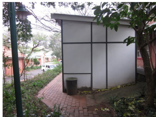
Fig 39: The laboratory from the north