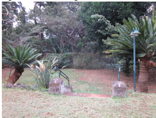
Fig 12: Garden below house