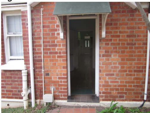
Fig 14: Side door to north