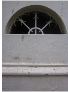
Fig 28: Detail of ventilation guard