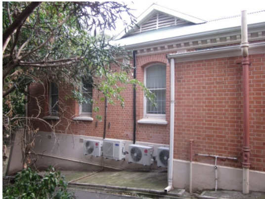
Figs 23 & 24: Views of northern elevation