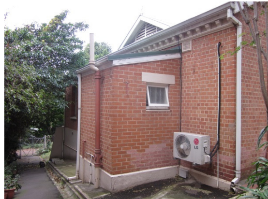
Fig 22: View of northern elevation