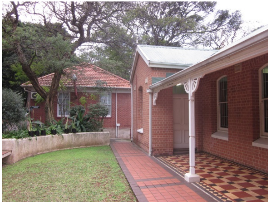
Fig 21: View of entrance veranda