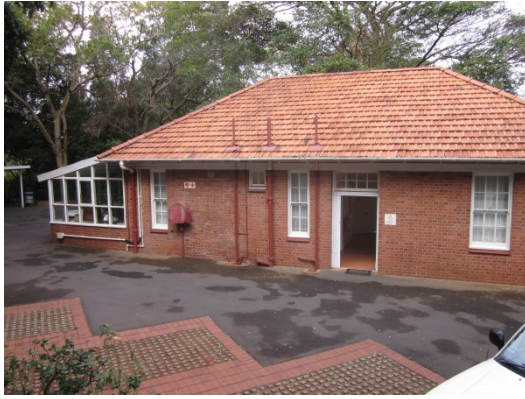
Fig 31: Resource Centre from the west