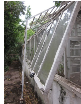
Figs 44 & 45: Industrial elements of the glasshouse