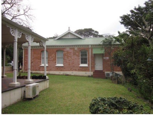
Fig 2: The Herbarium from the south