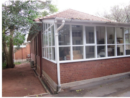
Fig 32: Resource Centre from the north