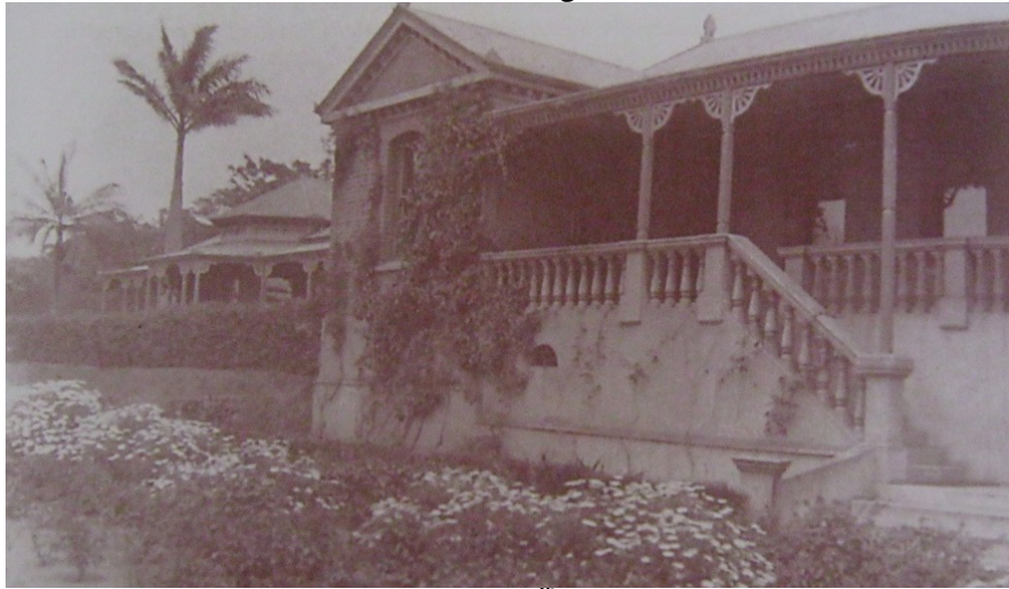
Fig 4: The Herbarium, in the late 19 th century (McCracken 1996:68)