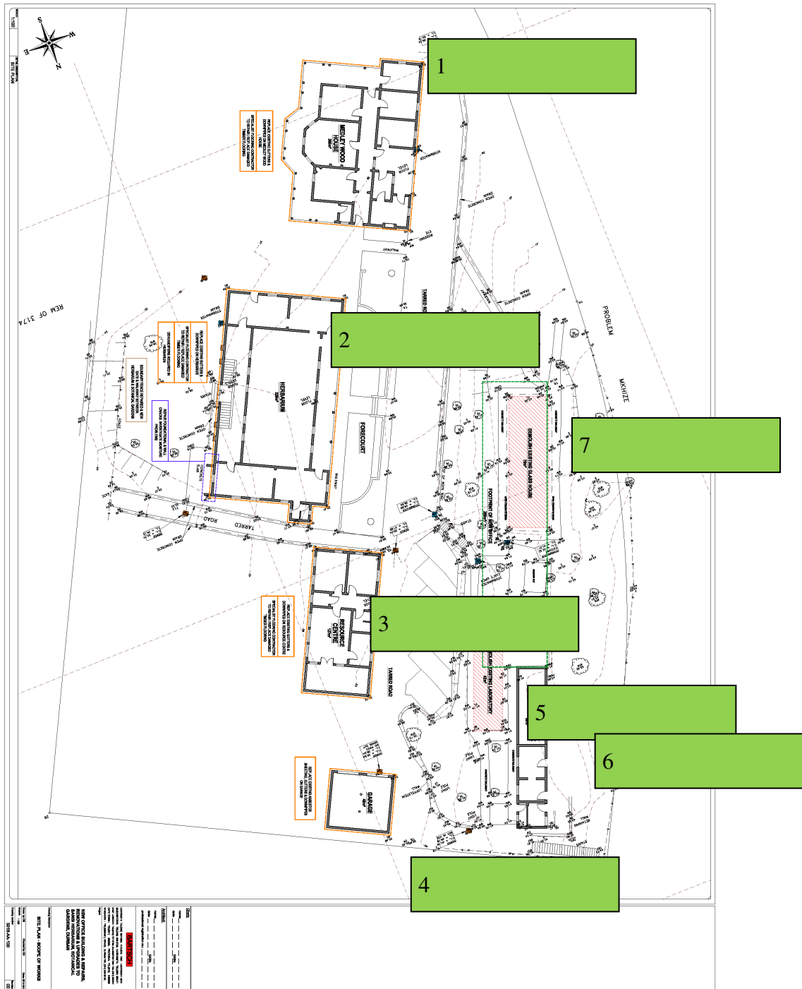
Fig 1: Schematic layout of the site illustrating Medley Wood House (1) the Herbarium (2), Resource Centre (3), Garage (4), Existing Laboratory (5), Umdoni Block (6), and the existing Glasshouse (7) all situated at the Durban Botanic Gardens.

The Herbarium and Medley Wood House are declared National Heritage sites.