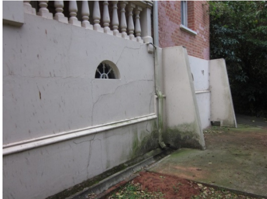
Fig 30: Eastern elevation showing water damage.