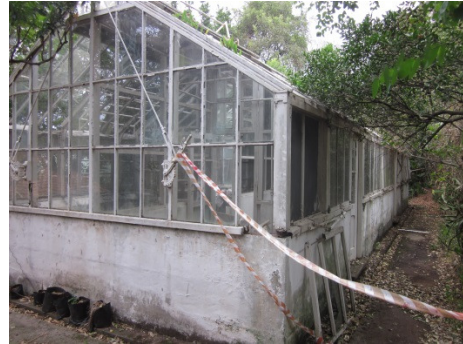
Figs 42 & 43: The condemned glasshouse