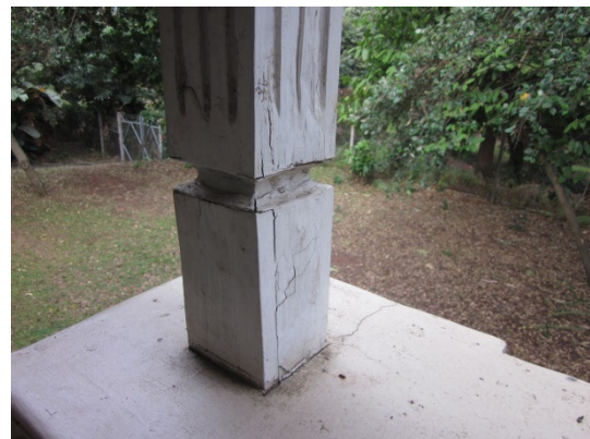
Fig 26: Water damage to timber posts