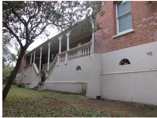
Fig 3: Eastern facade