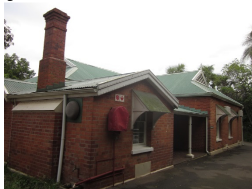
Fig 13: Rear aspect to the west