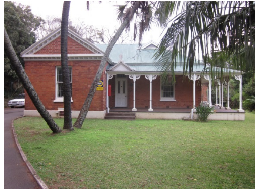
Fig 11: House from entrance