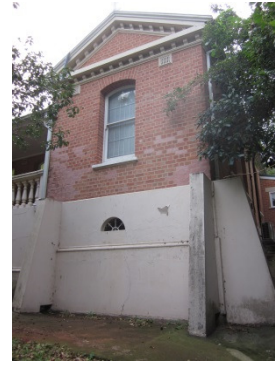
Fig 29: Buttresses