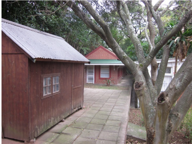
Fig 46 : The Shed

This is a commonplace 'Wendy House' constructed of timber. It has no heritage value.