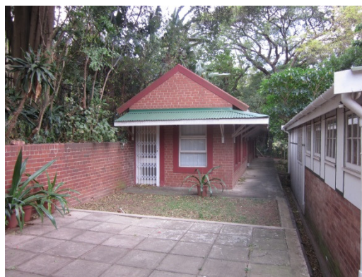
Fig 41: Umdoni Block from the south