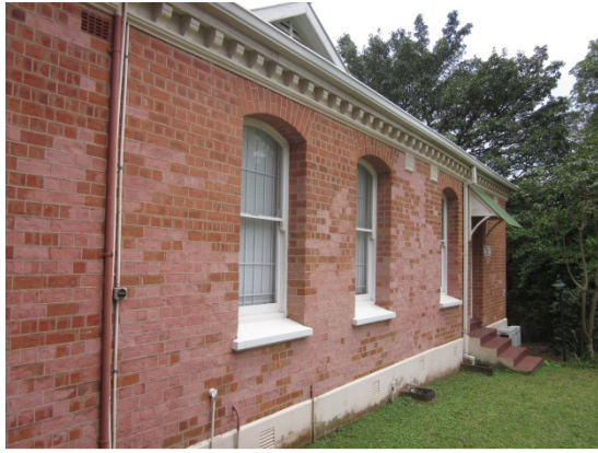
Fig 19: Southern elevation showing patched brick