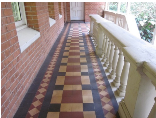
Fig 25: Veranda on eastern side