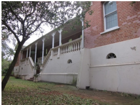
Fig 17: View of the same, eastern elevation