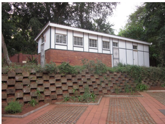
Fig 38: The laboratory from the east

This Laboratory consists of a number of different materials in its construction. A one metre high stretcher - bond brickwork base exists to part of it, whilst the balance consists of panels of asbestos sheeting. The scale of the doors and windows is reduced and shows top-hung windows and a standard 900x2100mm timber door. It has little to no heritage value.