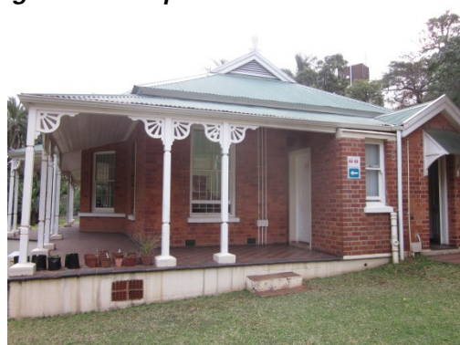
Fig 15: Northern elevation