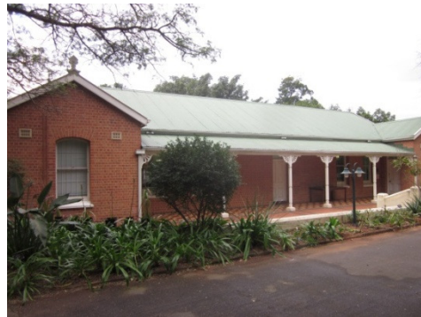
Fig 18: Elevation to the west