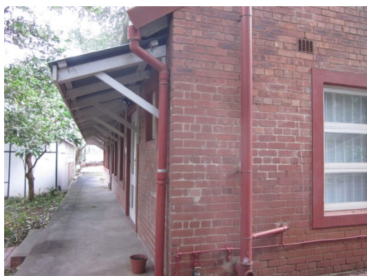
Fig 40: Building from the north

It has little architectural value, although the original section is potentially historic. However, given the scale and proportions of the space, this is dubitable, and the suspicion is that antiquated methods of brick construction were employed in a latter day building.