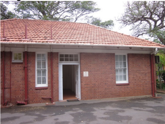
Fig 35 & 36: Resource Centre from west showing main entrance way