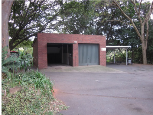
Fig 37: The Garage

This building is a double carport situated on the extreme north of the site. It is a modest, utilitarian building constructed of facebrick under fibre cement sheeting with no architectural value, and no value from any other perspective. The building is in excellent condition.