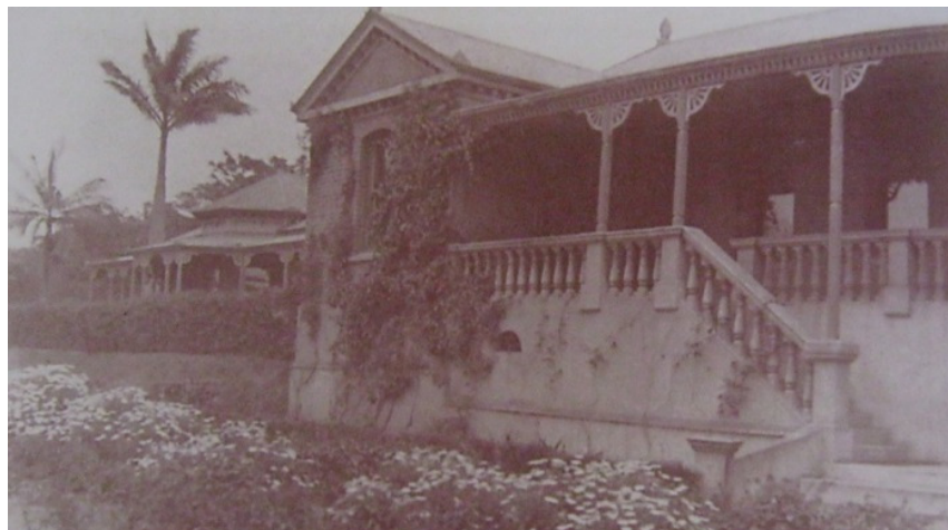
Fig 16: The Herbarium in the early 20 th century (McCracken 1996)

The building sits on the contour such that these verandas have a very different character: the western veranda flows directly into the garden space outside, forming a practical, engaged space, whilst that on the eastern side is impractical: it is narrow, ceremonial and is raised some nearly 3m above the ground level to the east. This aspect of the building is very disassociated from the western side of the building.