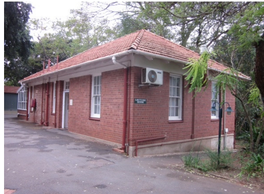
Fig 34: Resource centre from south west