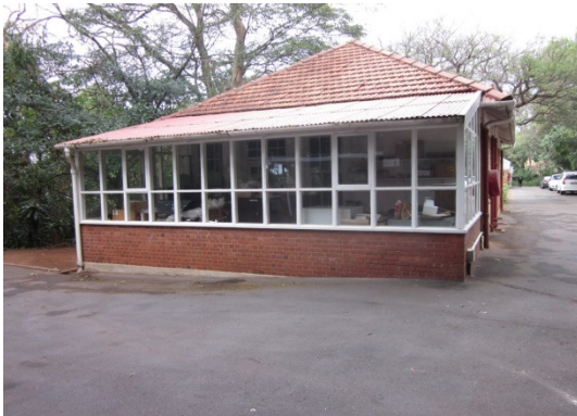
Fig 33: Conservatory