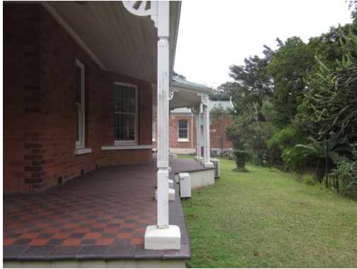
Fig 10: House along veranda

The planning follows a central passageway, with rooms leading off this. To the rear of the building, (the west) is a collection of additional spaces, forming utilitarian areas and the back, kitchen veranda. The condition of the building is generally excellent.