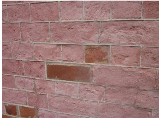
Fig 20: Badly patched brickwork