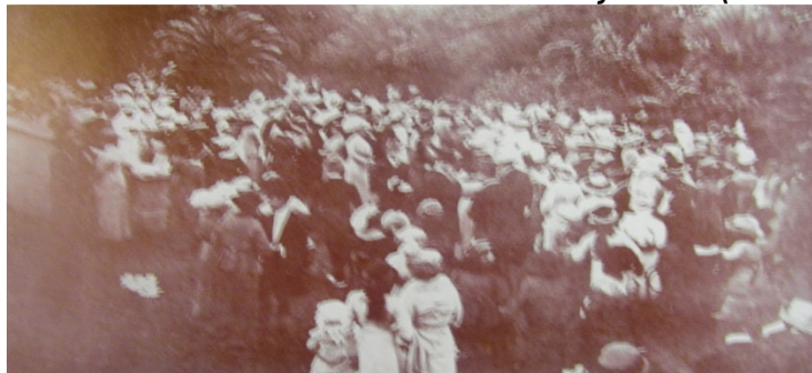
Fig 8: A high society social gathering of the late 19 th century at the Durban Botanical Gardens (McCracken 1996:68)

As seen in Table 1 (McCracken 1996: 2-3) of the Annexures in this document, the Durban Botanical Garden was established a year after the Cape Town Botanical Gardens and proved the most successful of the ten South African gardens. It is interesting to note that the Durban Gardens became the oldest surviving gardens on the African continent with a multitude of