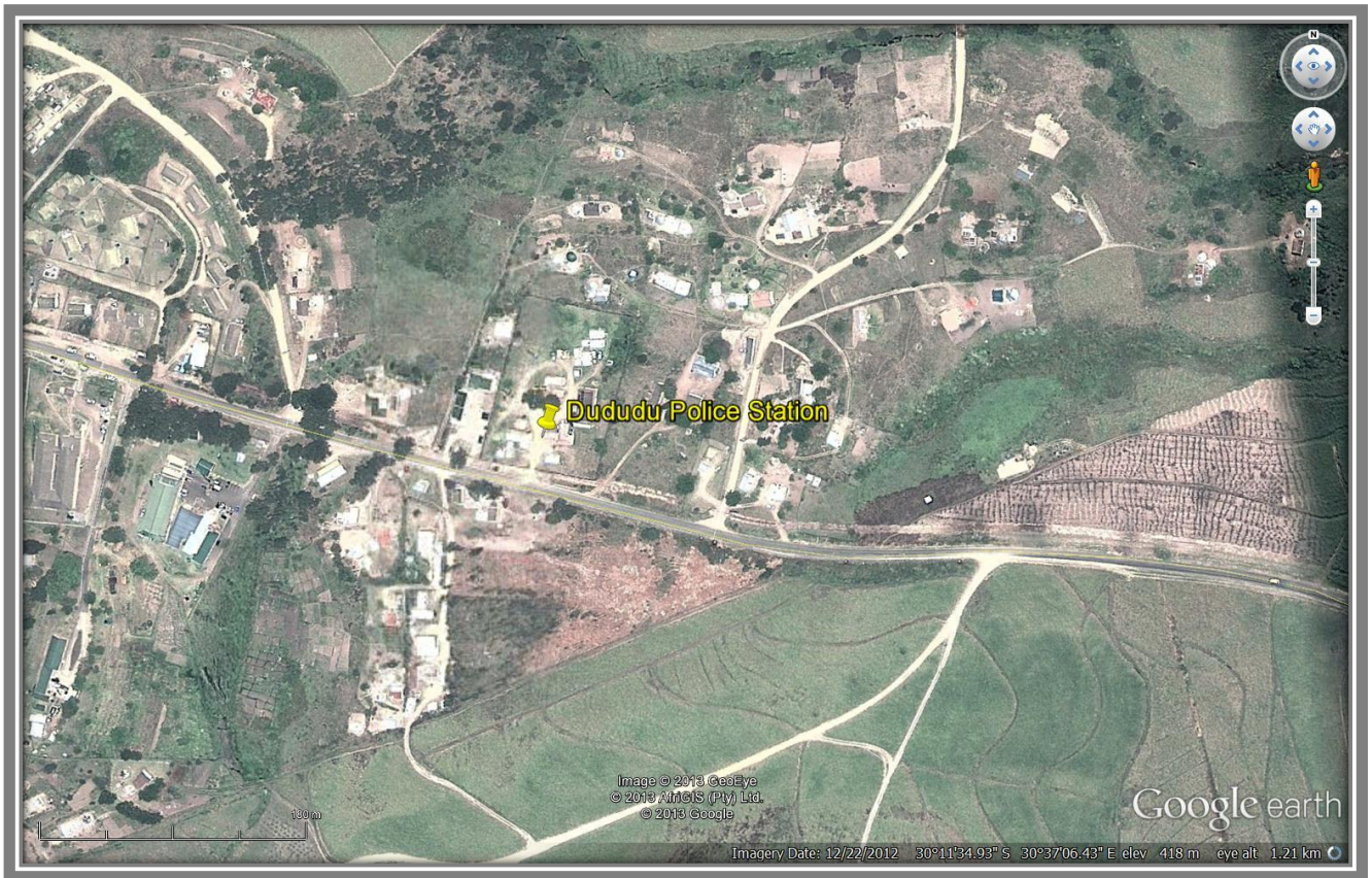
FIGURE 2 THE LOCATION OF THE PROJECT IN LOCAL CONTEXT.

The N2 is located approximately 15 km from the site. The N2 links to the Dududu main road P77 that provides access to Dududu.