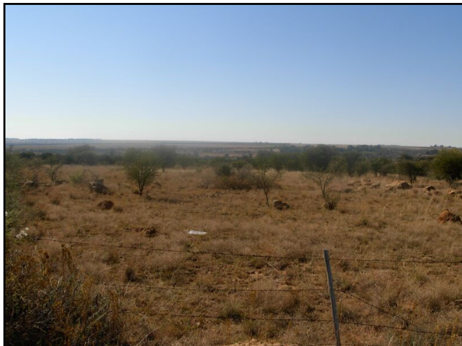
Figure 1: General view of site from west

No sites of heritage significance were found during the site visit.