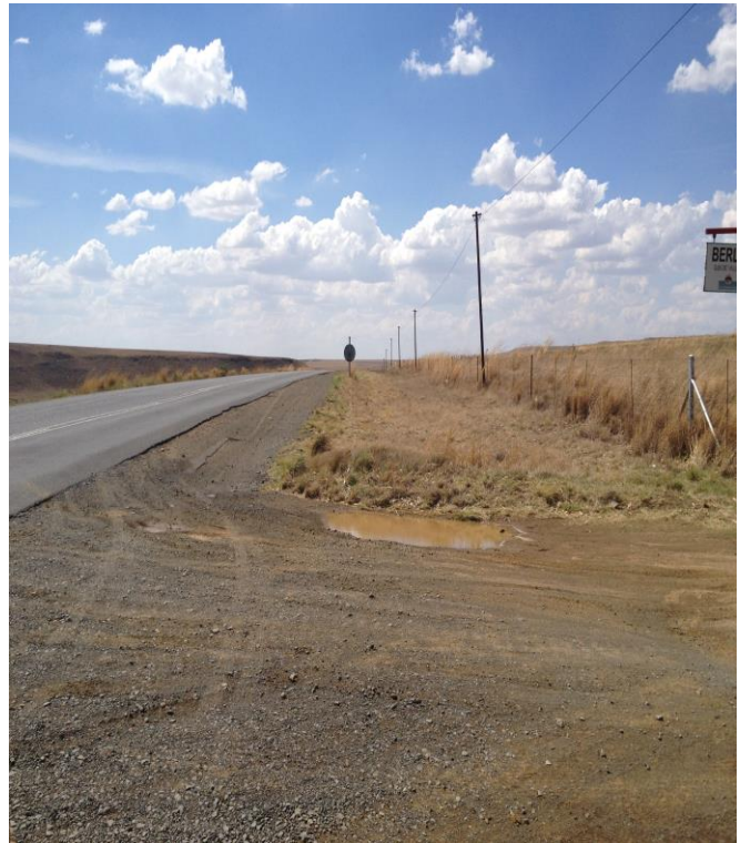
Photo #7 and #8 : Alternative 1 and Alternative 2 joins in this Area