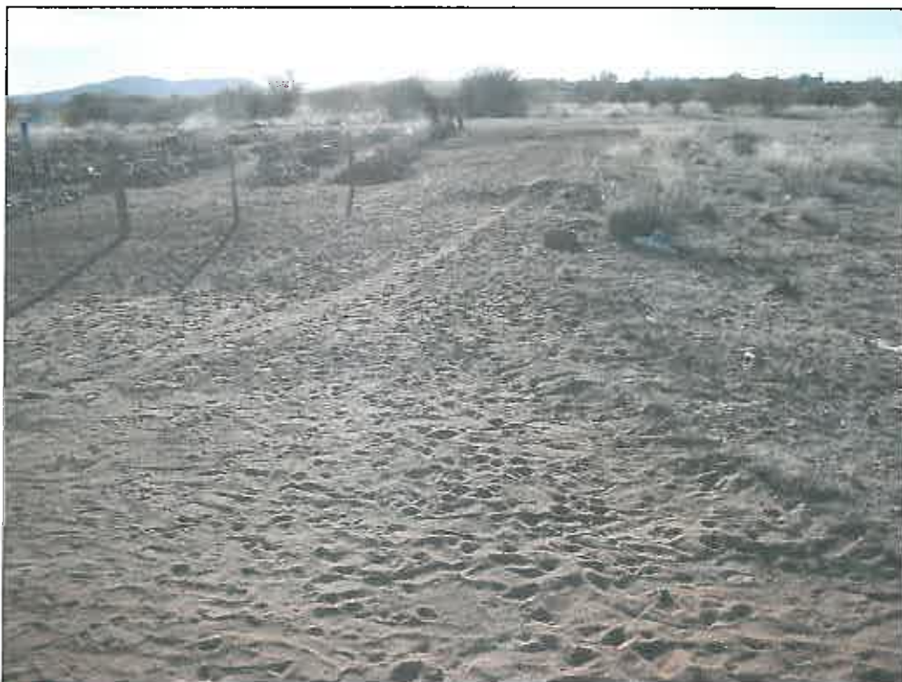
Fig.1 New cemetery site at Cillie near Kakamas, Northern Cape.