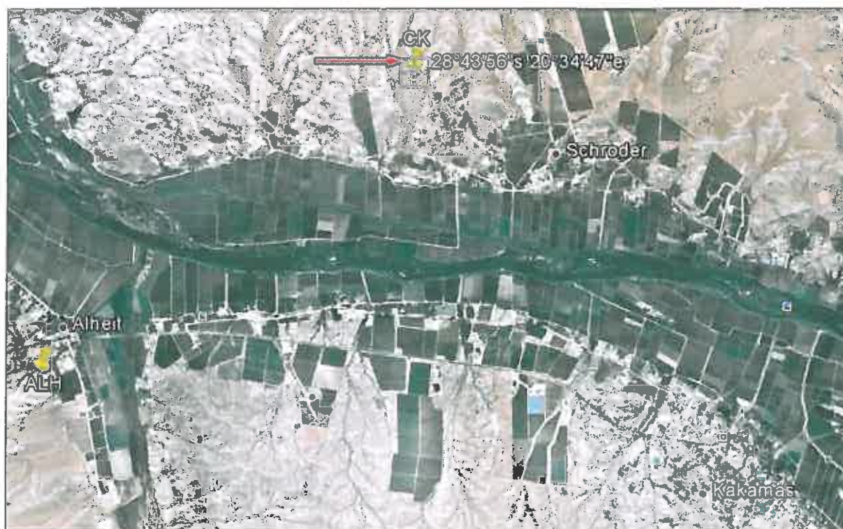
Map 2 Locality of Cillie cemetery in relation to Alheit, near Kakamas.