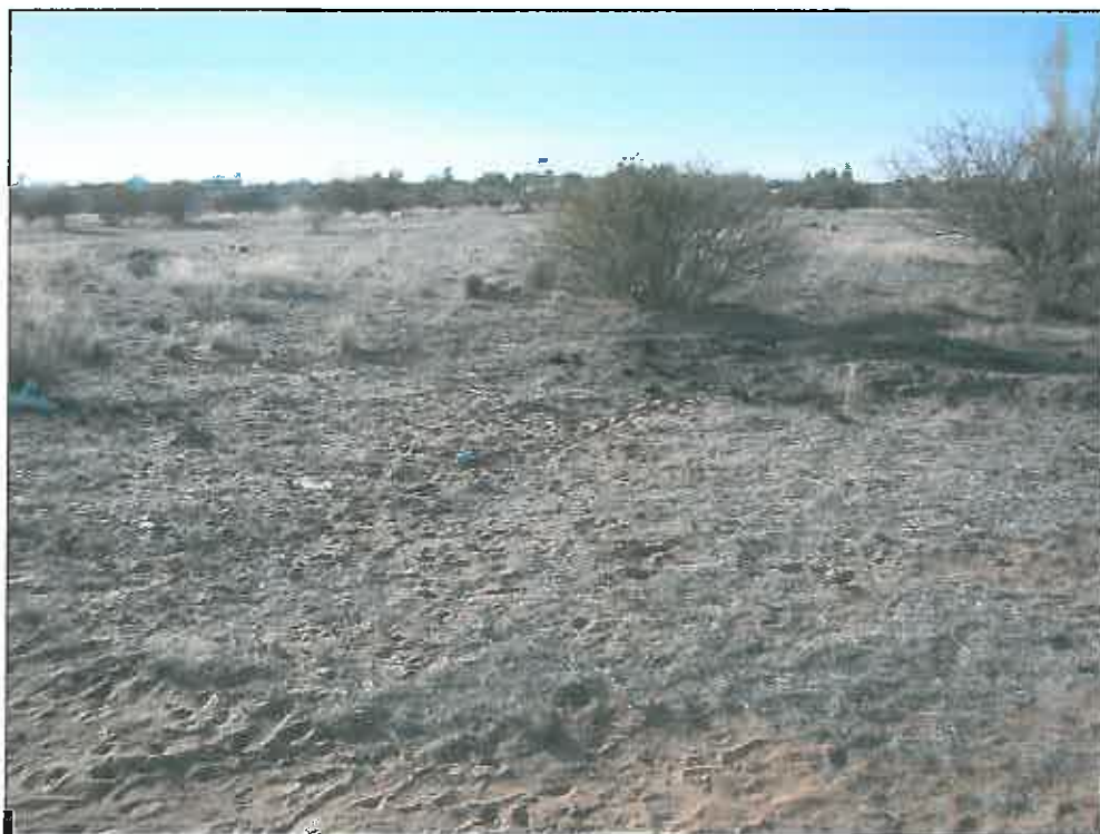
Fig.2 New cemetery site at Cillie near Kakamas, Northern Cape.