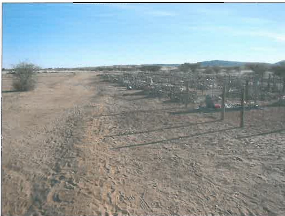
Fig.4 Cemetery site at Cillie near Kakamas, Northern Cape.