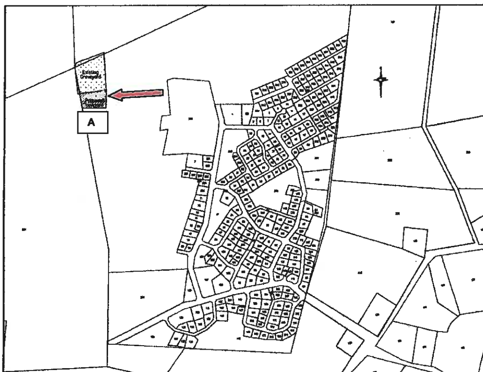
Map 4 Position of new cemetery at Cillie near Kakamas. Coordinate point indicated.