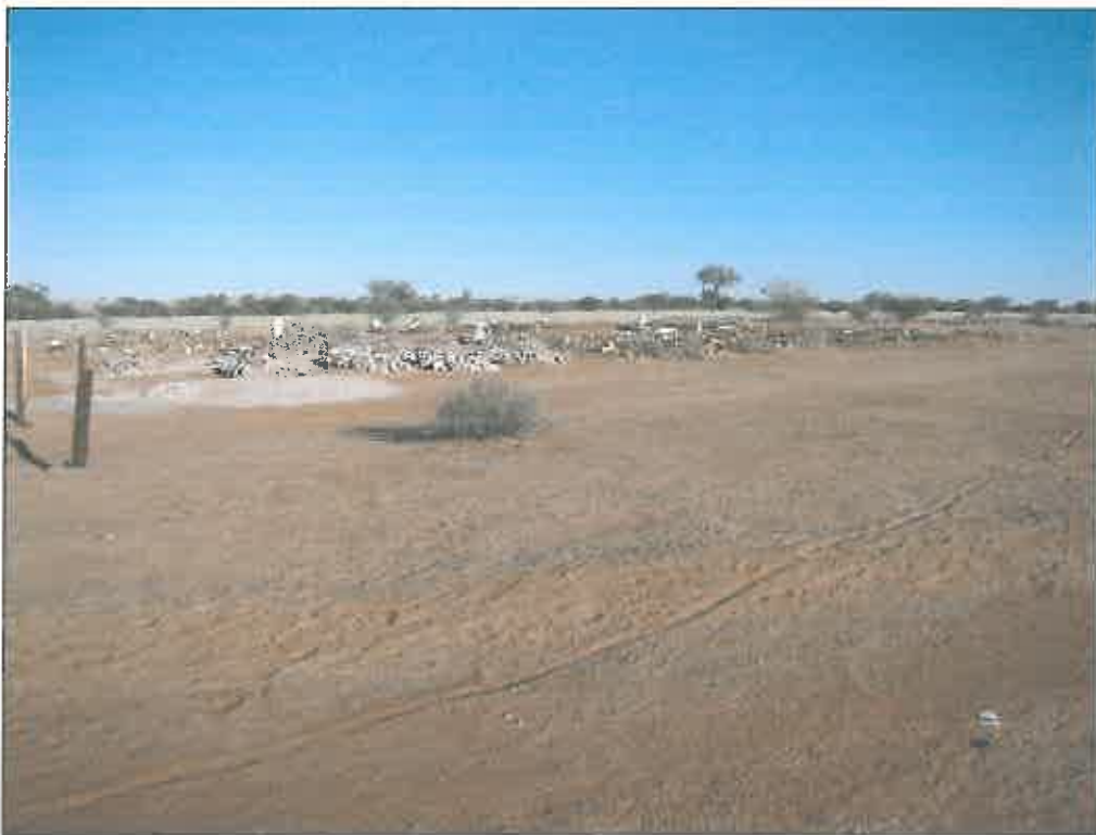
Fig.3 Cemetery site at Cillie near Kakamas, Northern Cape.