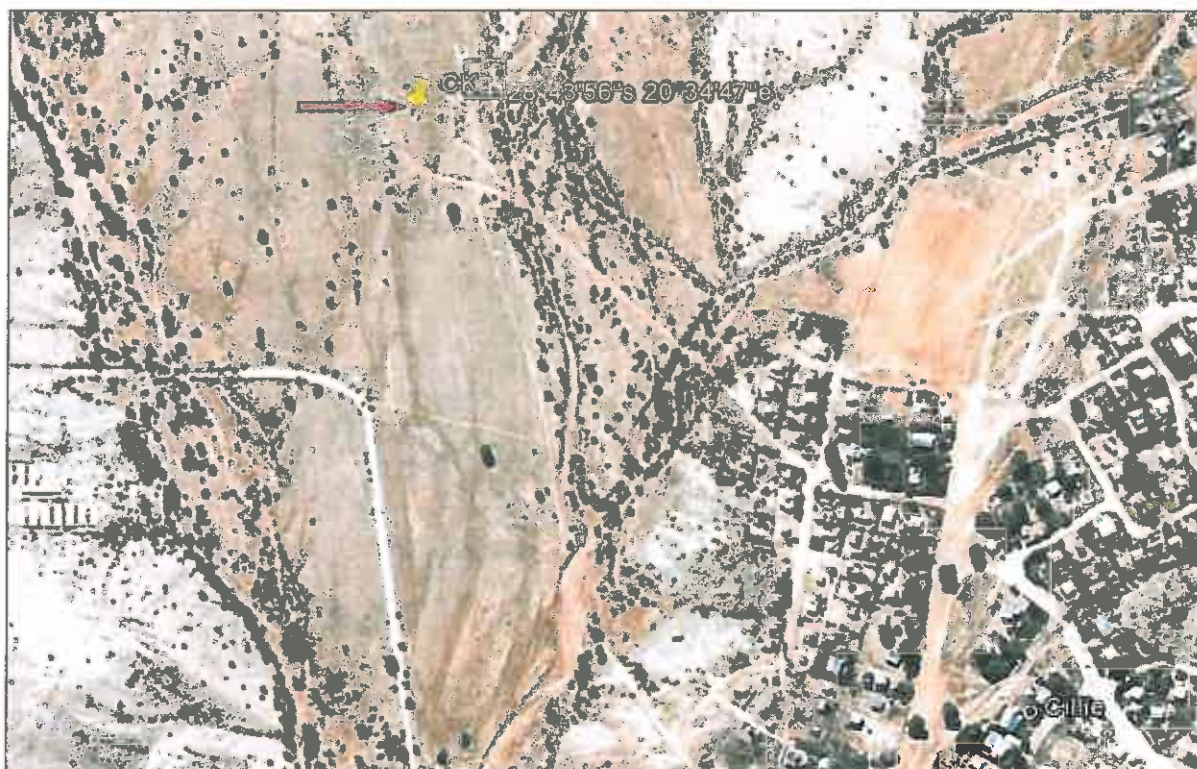
Map 3 Position of cemetery at Cillie near Kakamas.