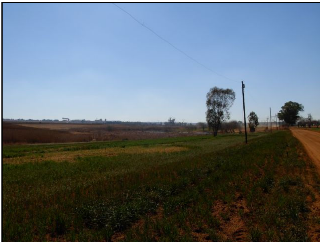
Figure 4 – View of site from southeast