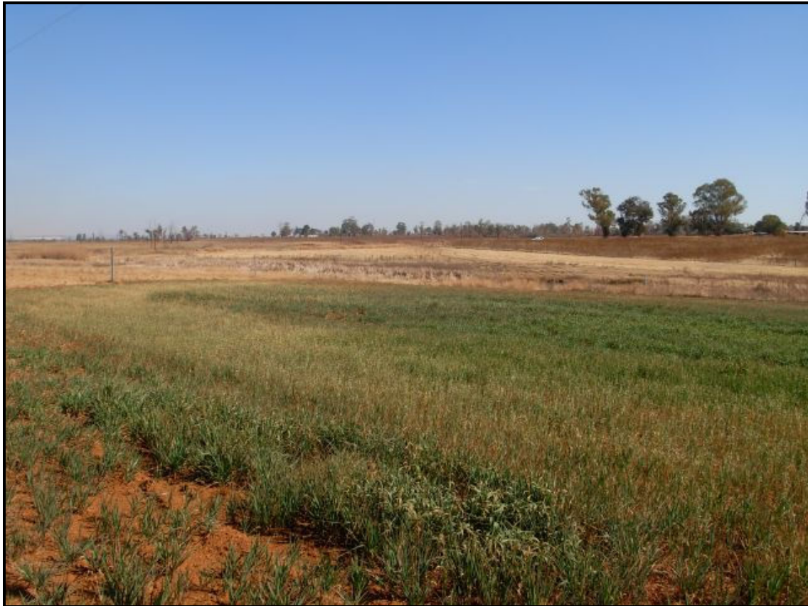
Figure 3 – View of site from northeast