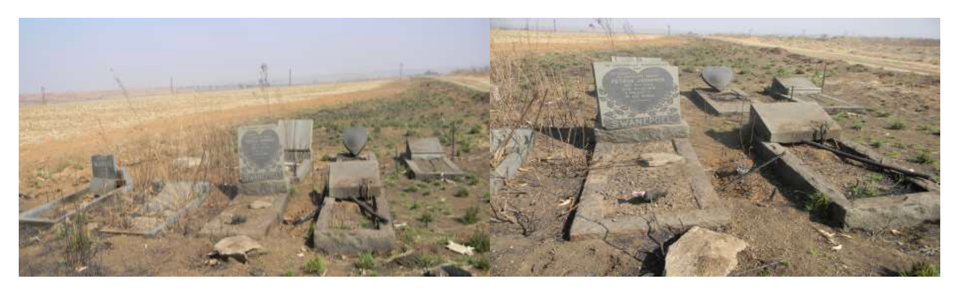
Plate 1: Showing the graves located withi the mining area