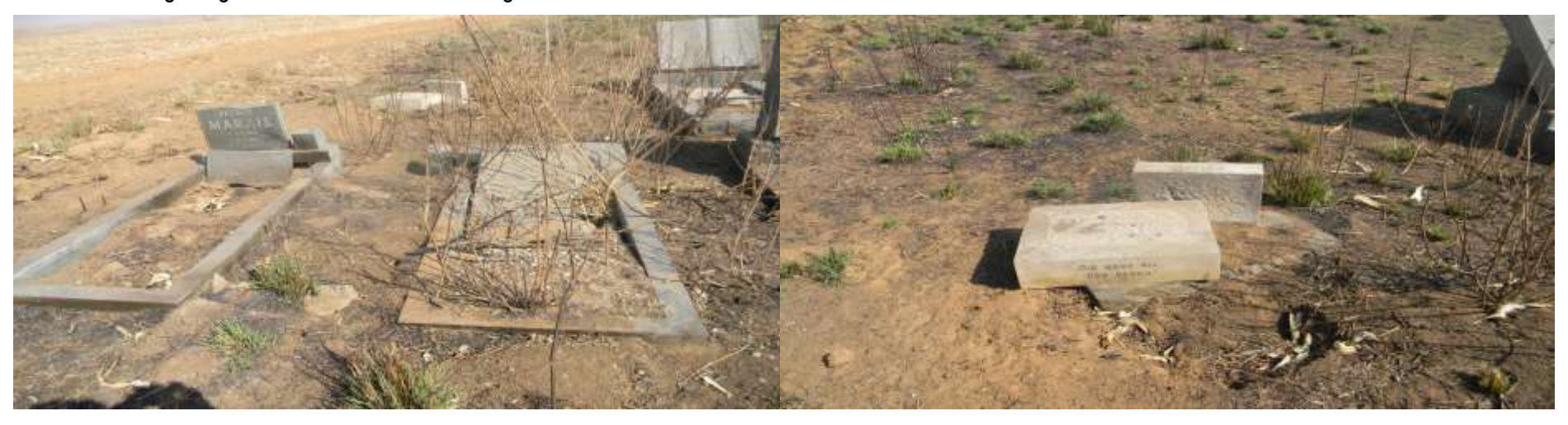
Plate 2: Showing some of the collapsed tombstones at the burial site.