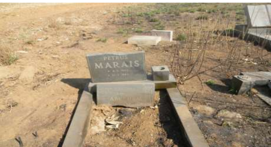
Plate 3: Showing graves located within the mining area