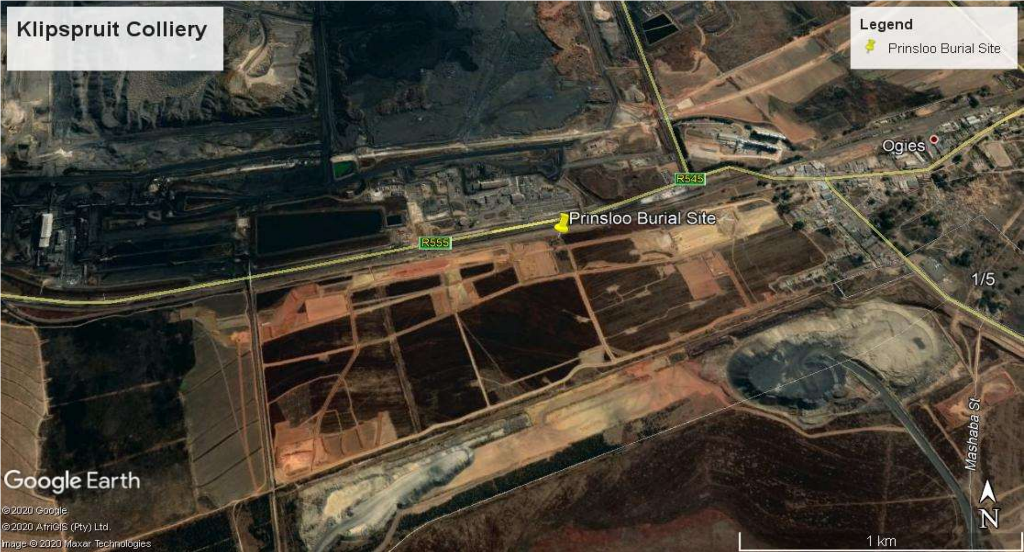
Figure 1: Position of the tombstones in question