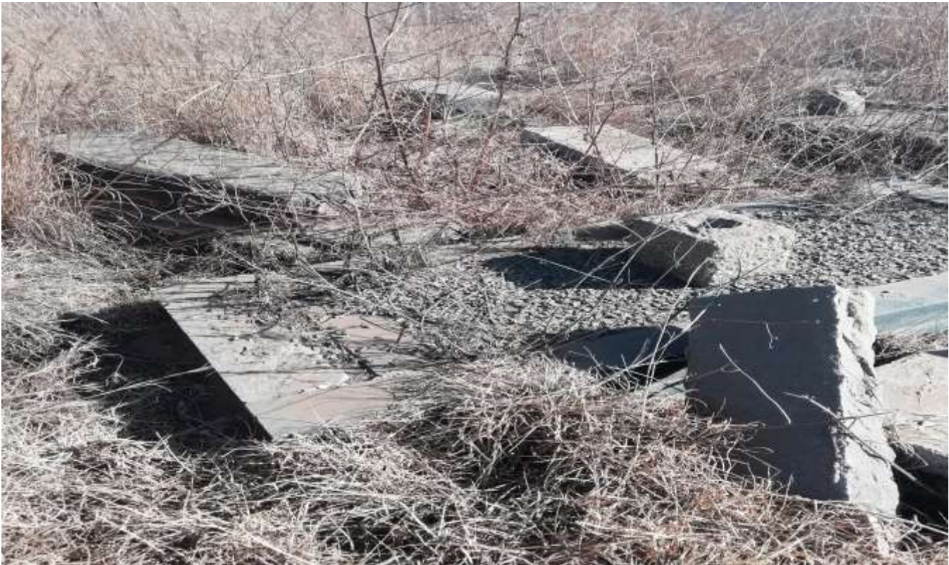
Plates 4: Shows broken tombstones scattered at the site.