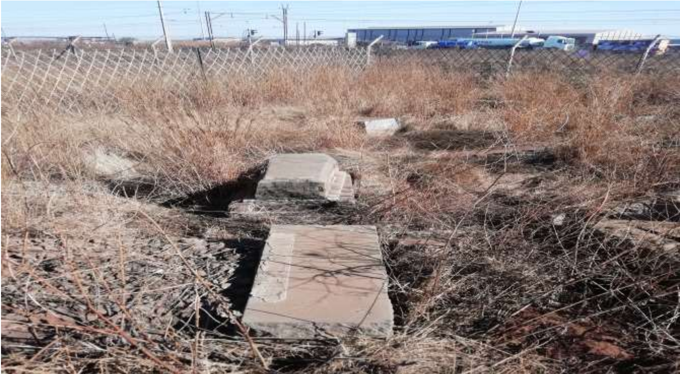
Plates 6: Shows broken tombstones