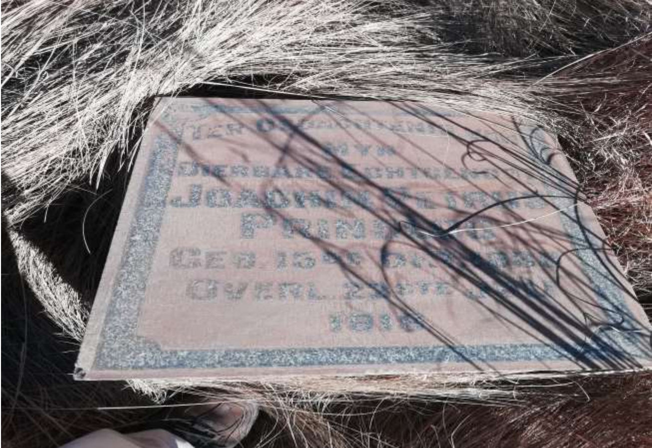
Plates 1: Shows an inscribed tombstone

The significance of burial grounds and gravesites is closely tied to their age and historical, cultural, and social context. Nonetheless, every burial should be considered as of high socio-cultural significance protected by practices, a series of legislations, and municipal ordinances.