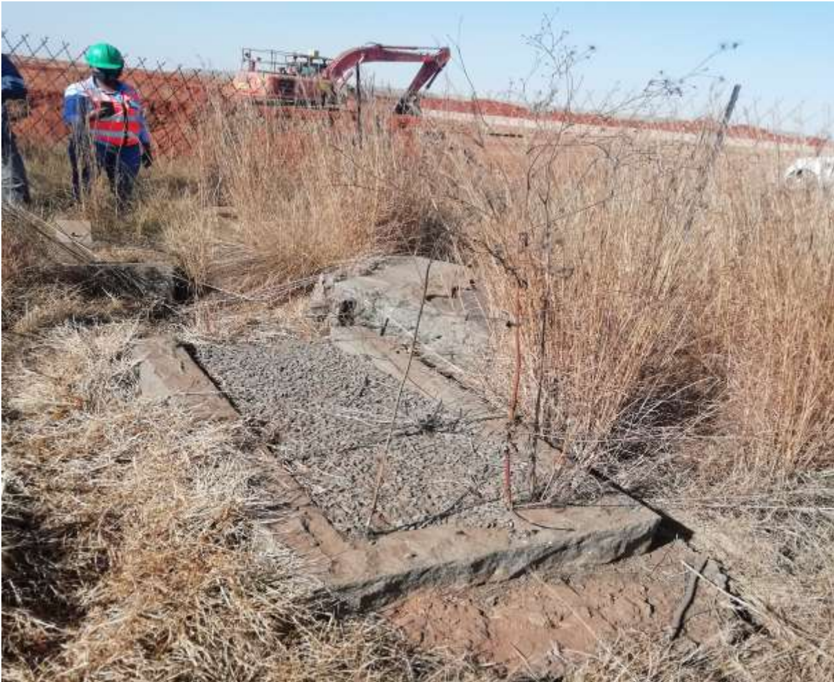
Plate 10: Shows tombstones piled at the site in question.