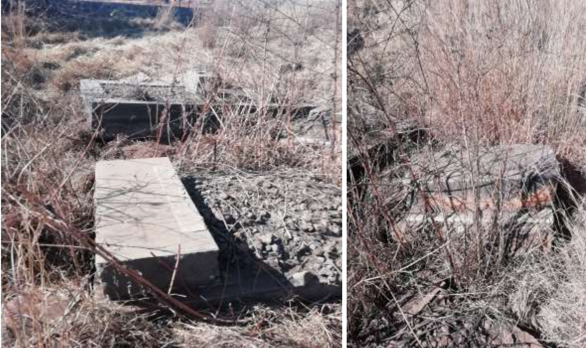
Plates 3: Shows broken tombstones.