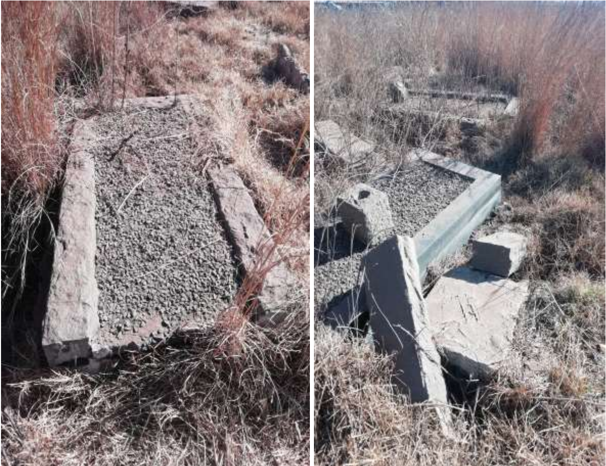
Plates 5: Shows broken tombstones.