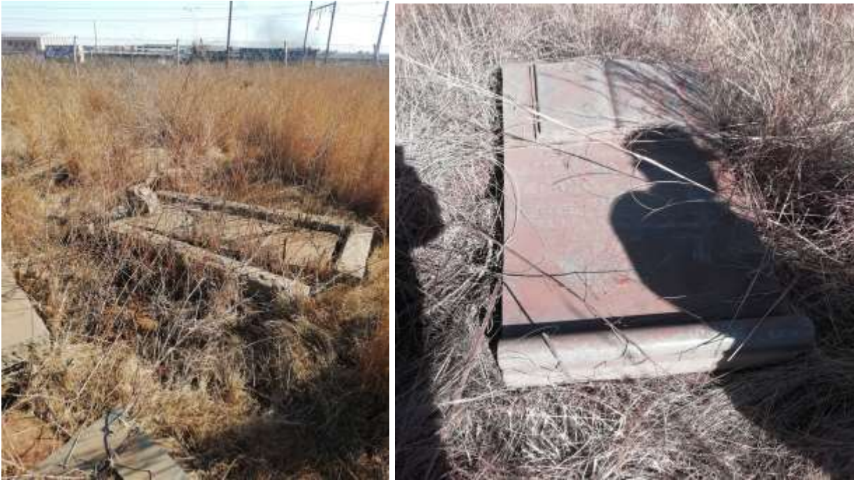
Plate 9: Shows tombstones piled at the site in question.