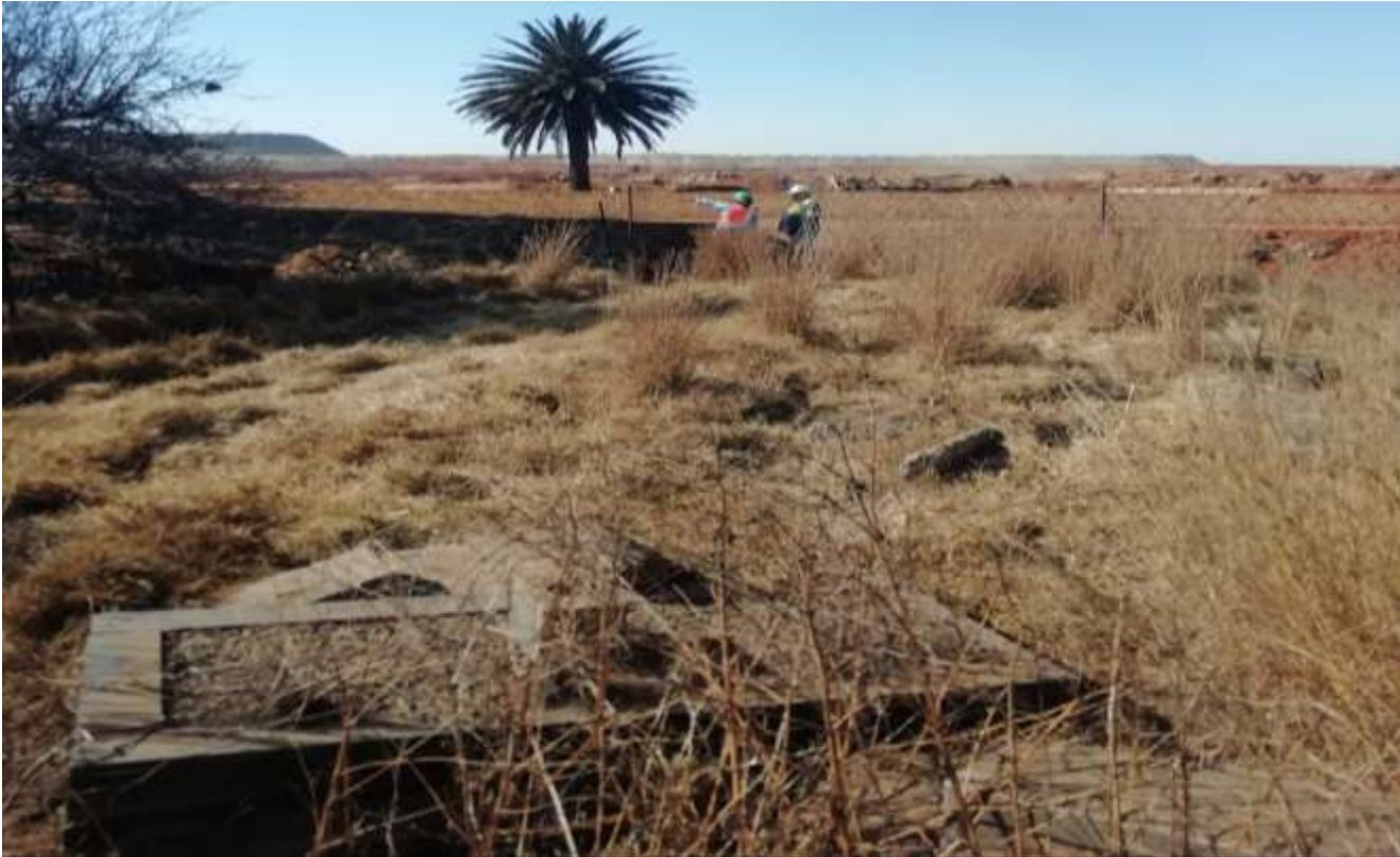
Plate 7: Shows broken tombstones.