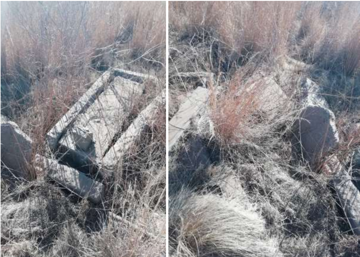
Plate 8: Shows tombstones scattered within the site.