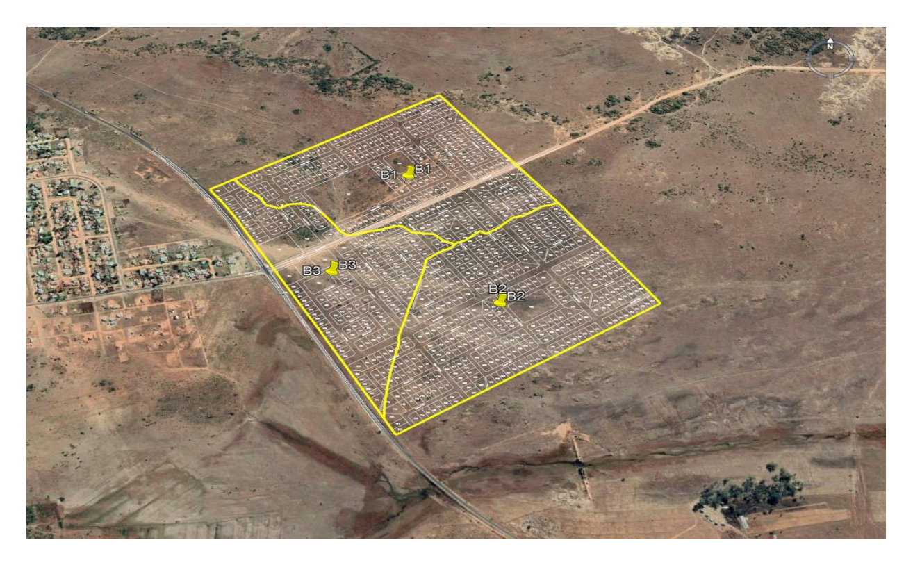
Figure 1 Location of development site

The locality map is shown on the figures below. The locality map is shown on the figures below.