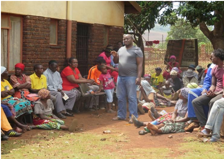
Picture 6 & 7: members of the public who attended the public participation

T: +27 12 320 8490 / +27 12 941 4960 | F: +27 12 320 8486 South African Heritage Resources Agency - Pretoria Office | 432 Paul Kruger Street | Pretoria