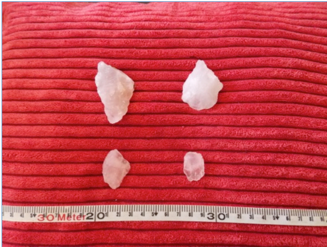
Figure 9. Poorly defined quartz tools