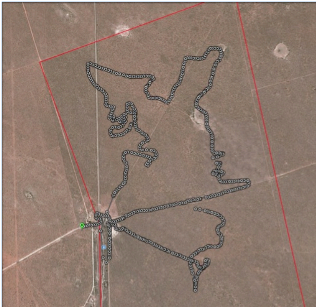
Figure 6. GPS Track Path