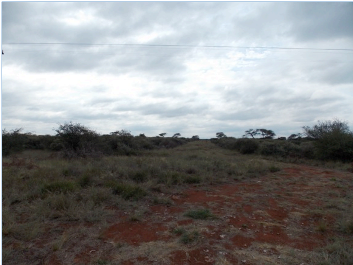
Figure 8. Quartz deposit in study area