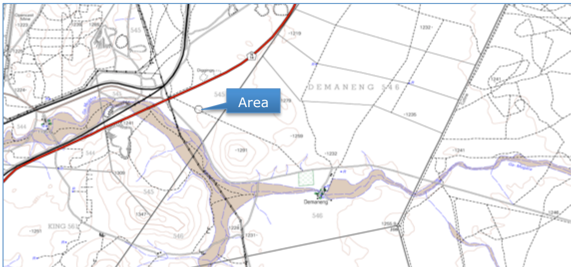
Figure 10. Location of quartz finds