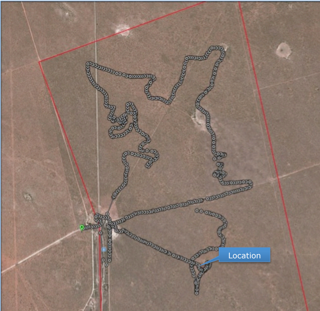
Figure 10 Location relative to track paths