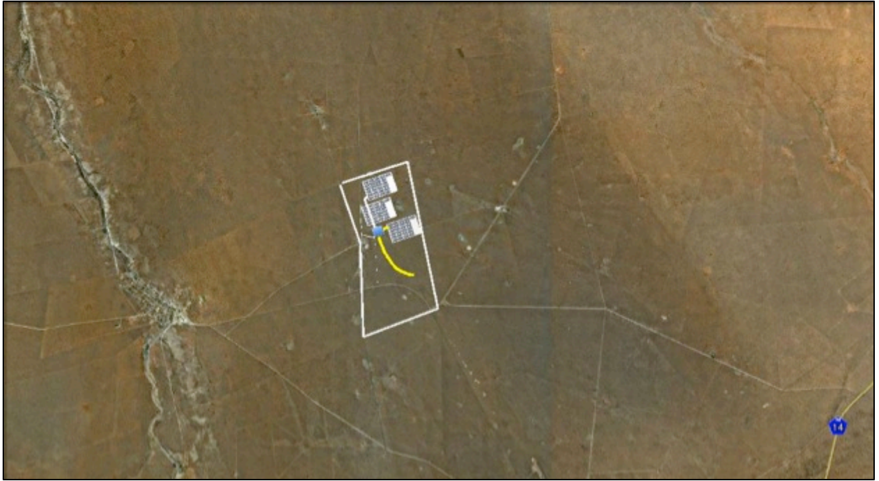
Figure 2. Aerial view of the proposed site at San Solar Park