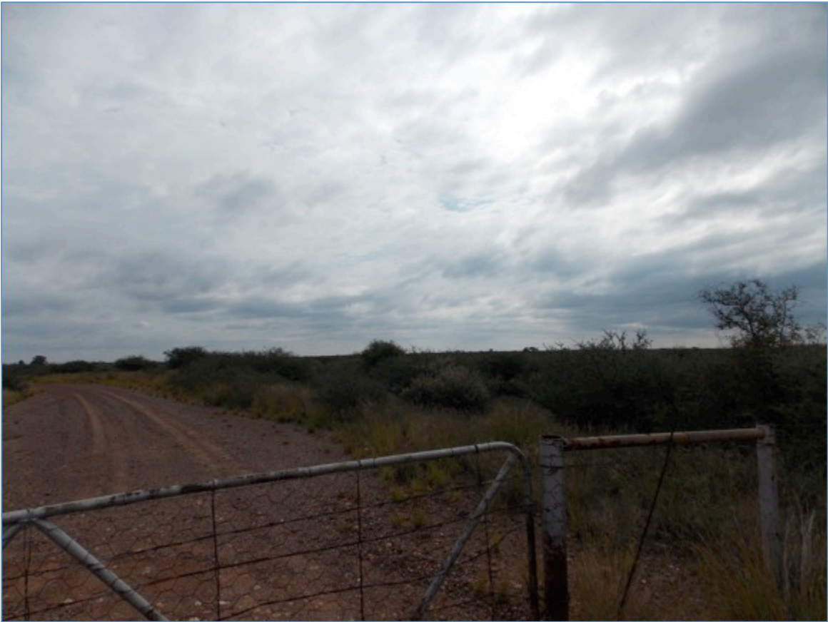
Figure 4. Road access to the site