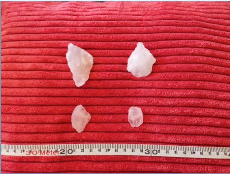
Figure 9. Poorly defined quartz tools