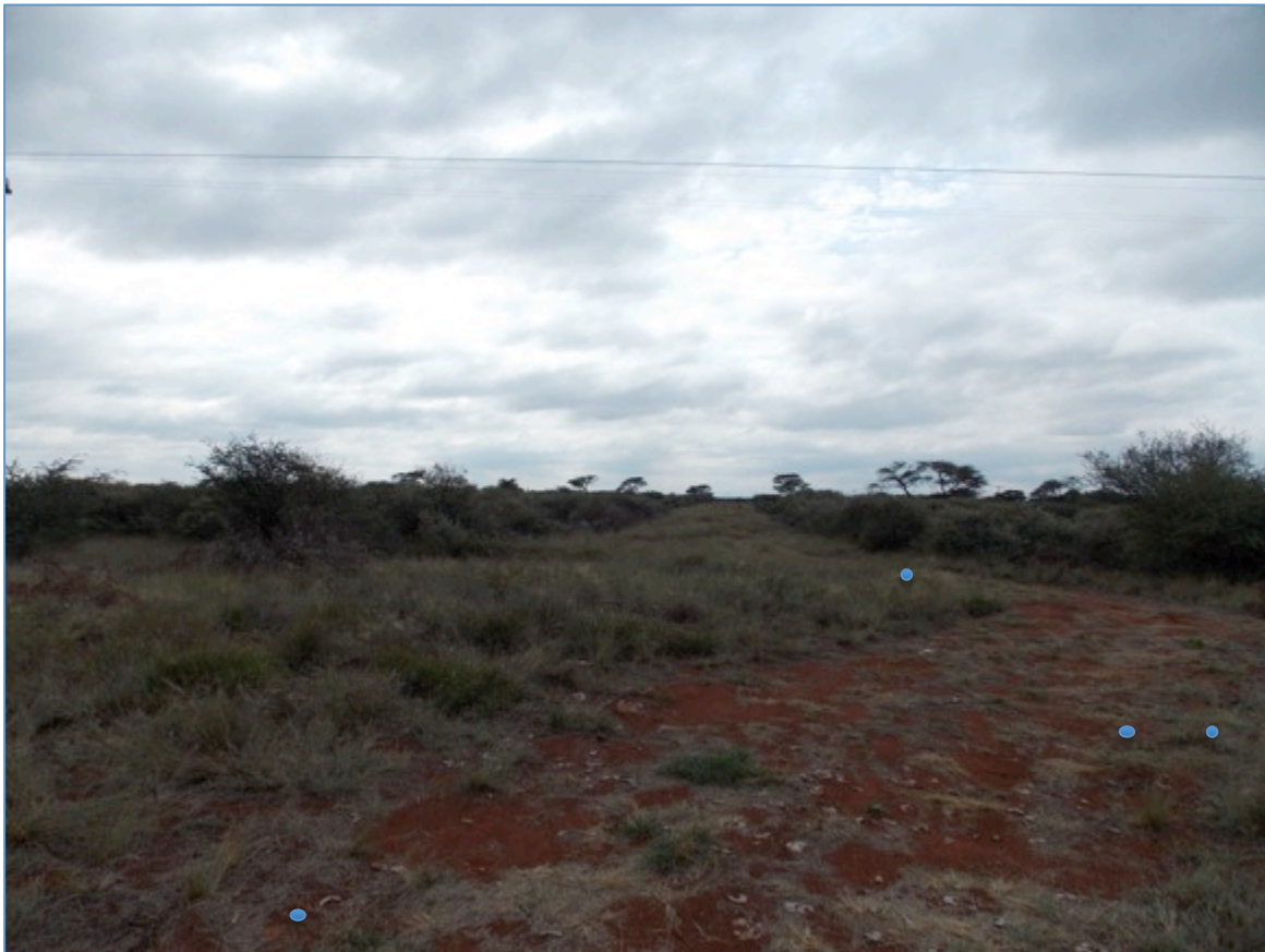
Figure 8. Quartz deposit in study area

This area contained some poorly defined quartz stone artifacts. No cores or manufacturing amounts of flakes could be identified. It is believed that these tools are the result of alluvial relocation from a more prominent site, possibly within the river valley. The amount and composition of the finds does not warrant the site being described as a tool location site.