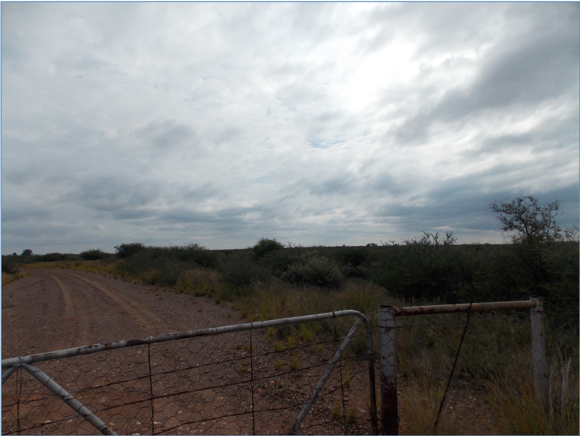
Figure 4. Road access to the site