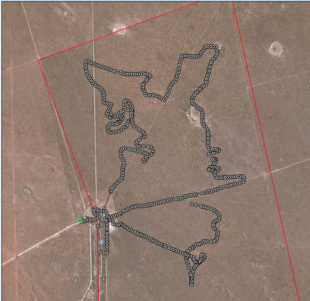
Figure 6. GPS Track Path