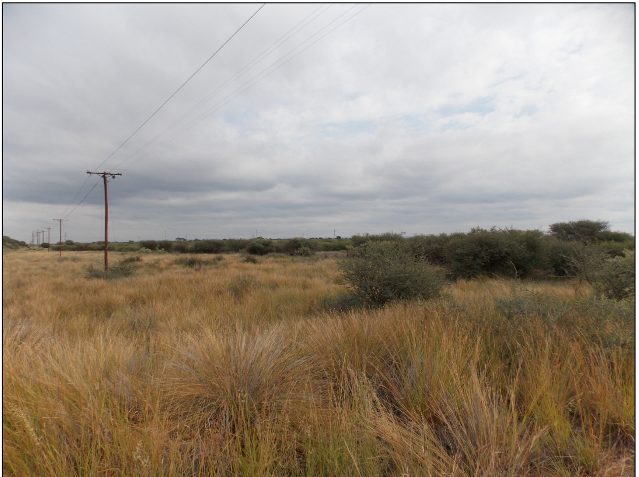
Figure 3. General Landscape