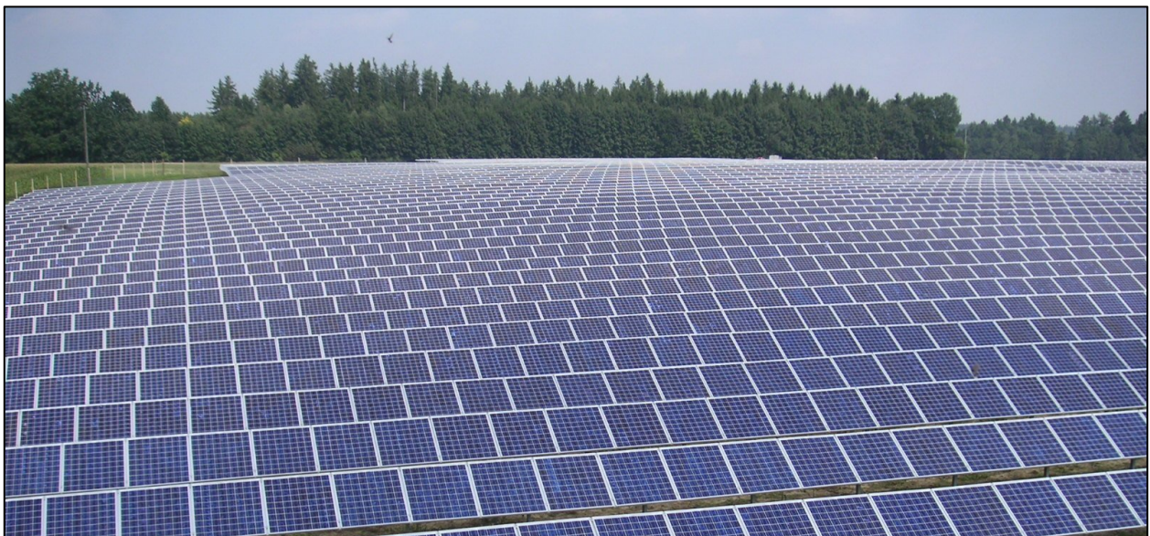
Figure 7. Solar plant design

Visual impacts of developments result when sites that are culturally celebrated are visually affected by a development. The exact parameters for the determination of visual impacts have not yet been rigidly defined and are still mostly open to interpretation. CNdV and DEAP (2006) have developed some guidelines for the management of the visual impacts of wind turbines in the Western Cape, although these have not yet been formalized. In these guidelines they recommend a buffer zone of 1km around significant heritage sites to minimize the visual impact.