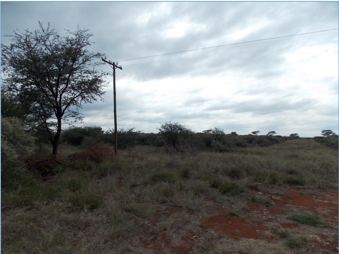
Figure 5. Edge of pan investigated