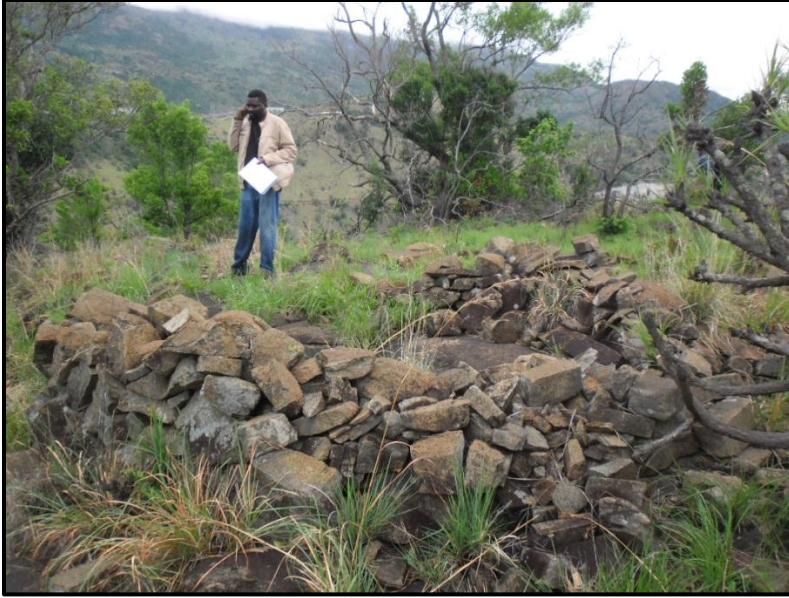
Figure 8. Stone walling at Site 4

The following site co-ordinates are available as well as their proximity to structures