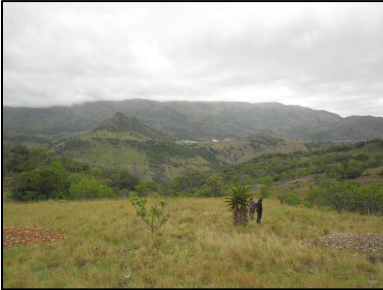
Figure 7. View to the mine from structure 1BDL/STB 4

Most of the stays and pylon positions have been excavated on the proposed alignment; however structures 1BDL/DRB 8, 1BDL/DRB 9 and 1BDL/DRB 12 have not been excavated yet. There is from a heritage point no reason why these structures cannot be constructed. However excavations at structure 1BDL/DRB 8 will have to be done under the supervision of Eskom's heritage specialist as archaeological material (ceramics and a bored stone) was recorded in this area.