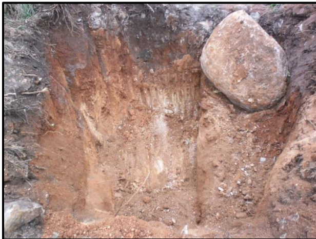
Figure 4. Trench 2 after excavation