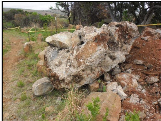
Figure 5. Excavated concrete block