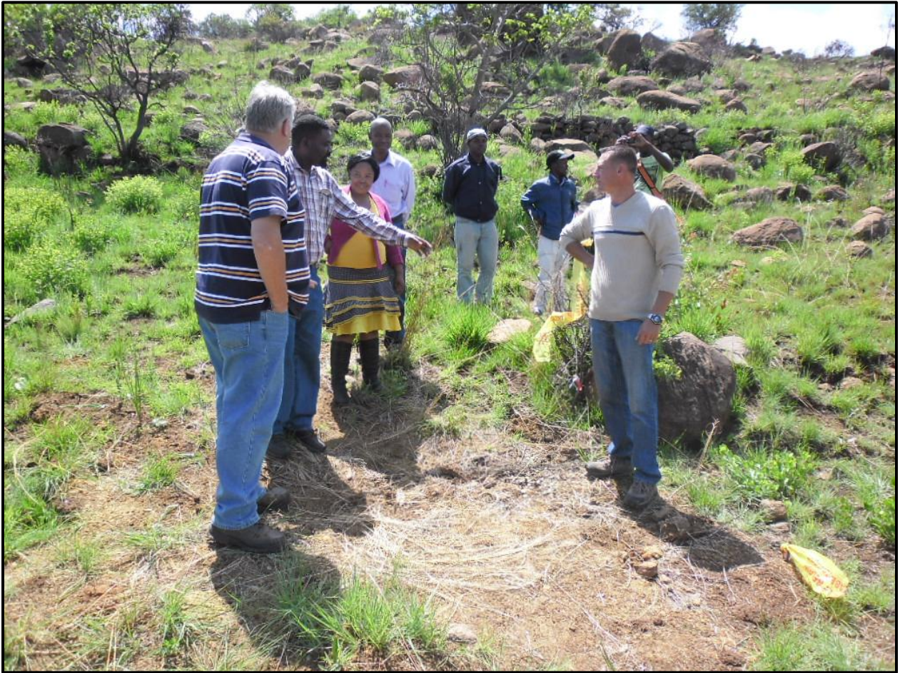
Figure 9: Consultation with community members

The following structures were marked as heritage sensitive (Rep 18 Oct 2012) Structure 35, 36, 37 and 38. These sites were visited with community representatives Mrs Salome (surname unknown) as well as Mrs Lucas Mankge and Mrs Lucky Moshimane (Figure 9).