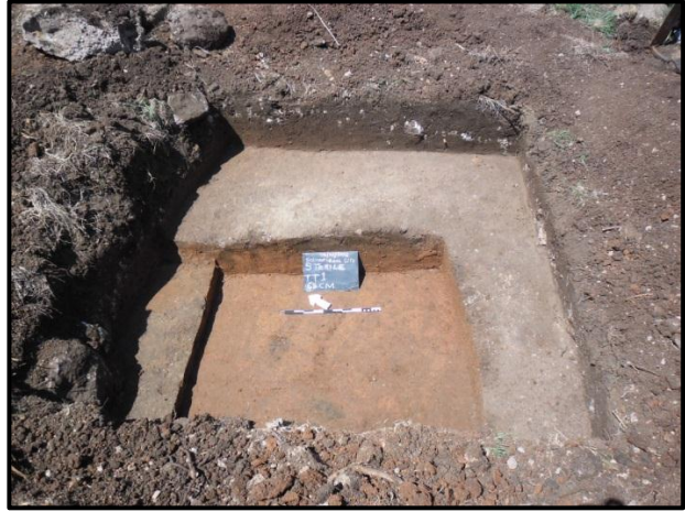
Figure 3. Excavated trench up to sterile layer