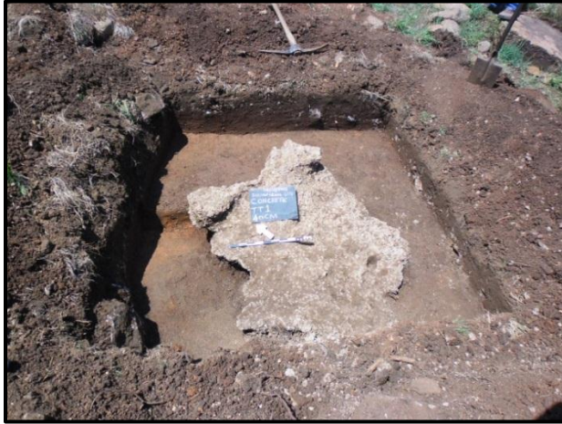
Figure 2. Trench 1 with concrete block

Mr. Matoho is compiling a full report on the excavations in order to comply with his permit conditions under the South African Heritage Resources Agency. This report will be handed in at a later stage.