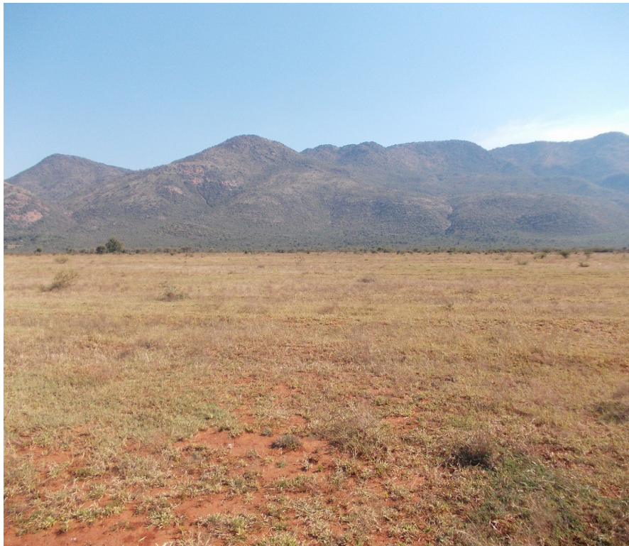
Fig 1. View of development area