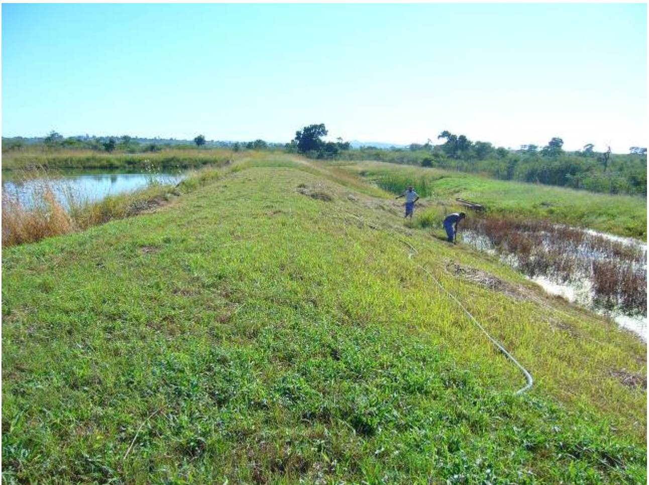
Fig 1. View of development area