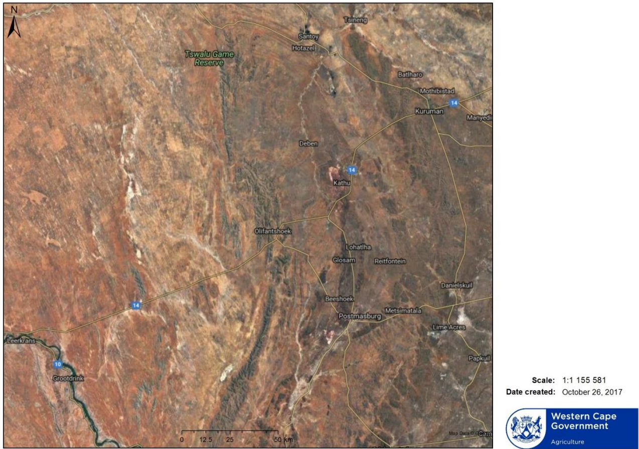
Figure 1 Location of the project area