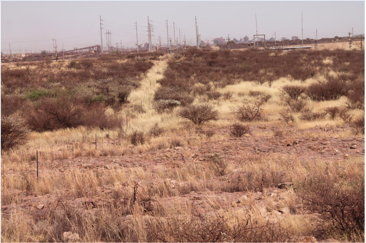
Figure 3 A view down the proposed alignment. No the rock outcrops and shallow soil depth.