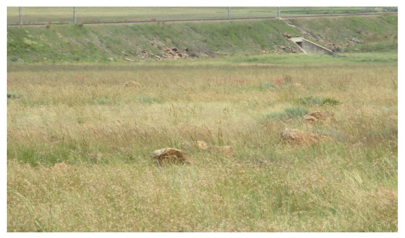
Plate 4: Photo 3 shows the railway line traversing the area (Author 2018).