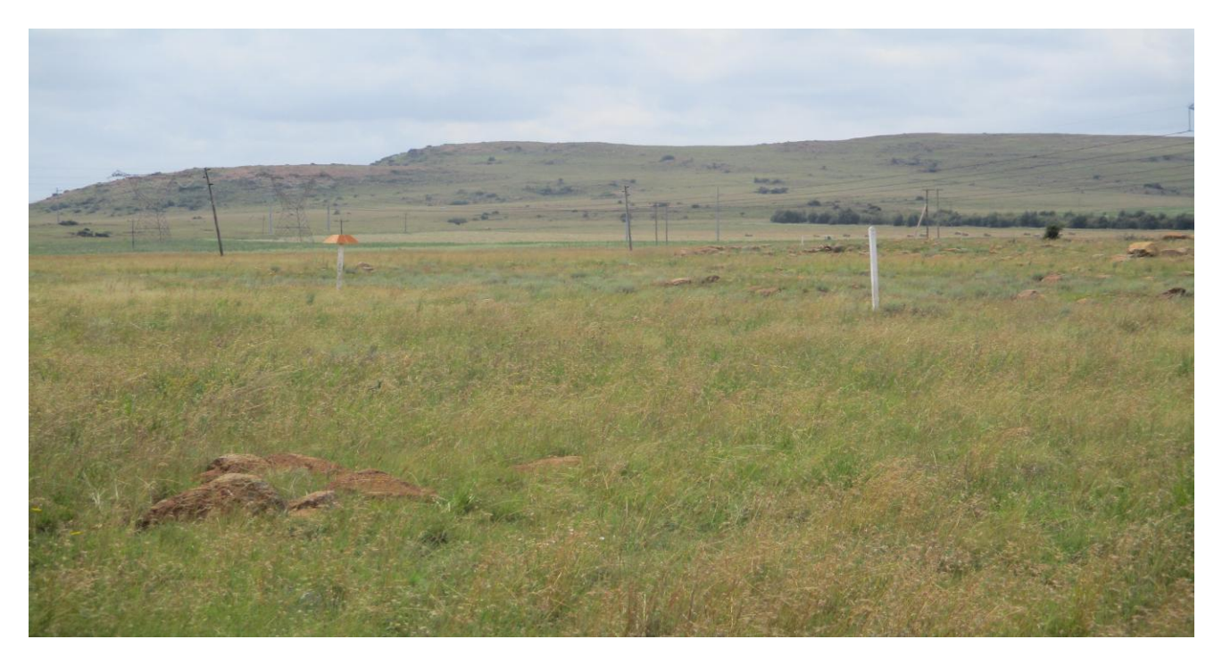
Plate 5: Photos 4 shows concealed site by overgrown vegetation cover with various Eskom powerline and Sasol Gas pipeline traversing the area.