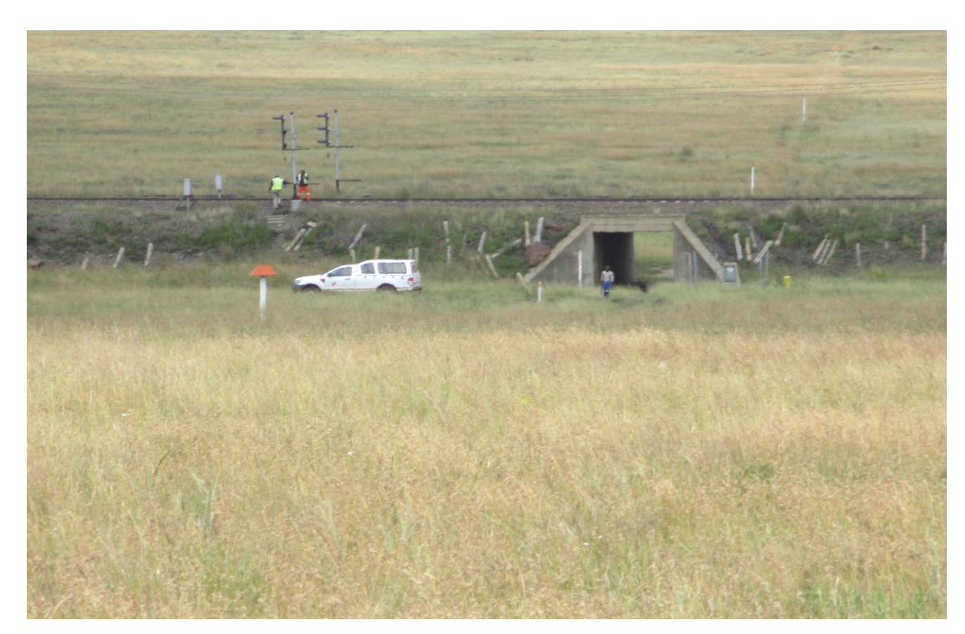
Plate 3: Photo 2 shows an existing railway line traverses through the area (Author 2018).