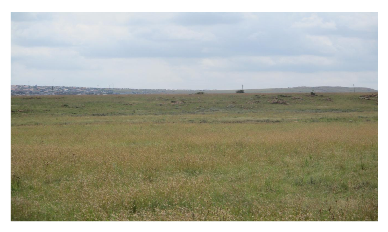
Plate 2: Photo 1 shows the general landscape of the substation site (Author 2018).