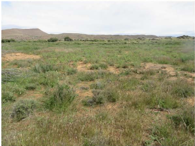
Figure 3.General view of the proposed pivot site.