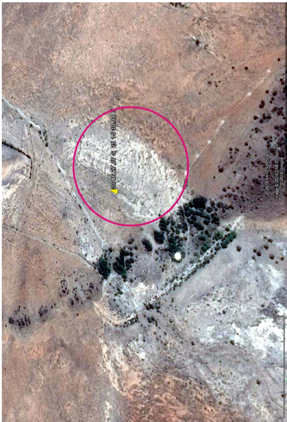
Figure 2. Aerial view of the terrain