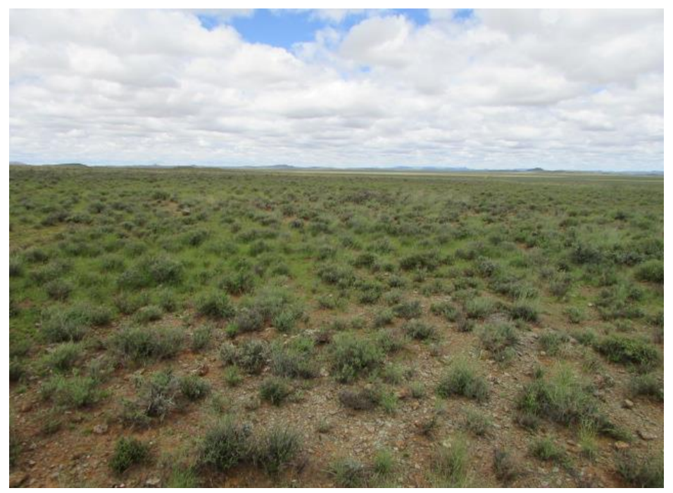
Figure 10: Site 32 (2017).