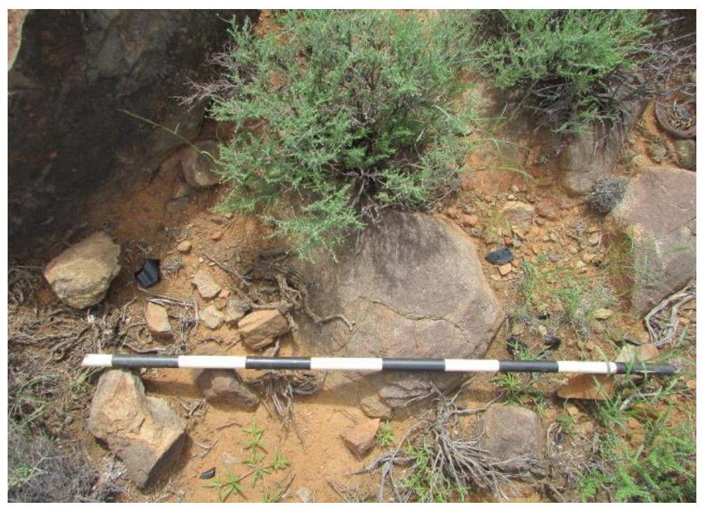
Figure 4: Historical artifacts at Site 25.