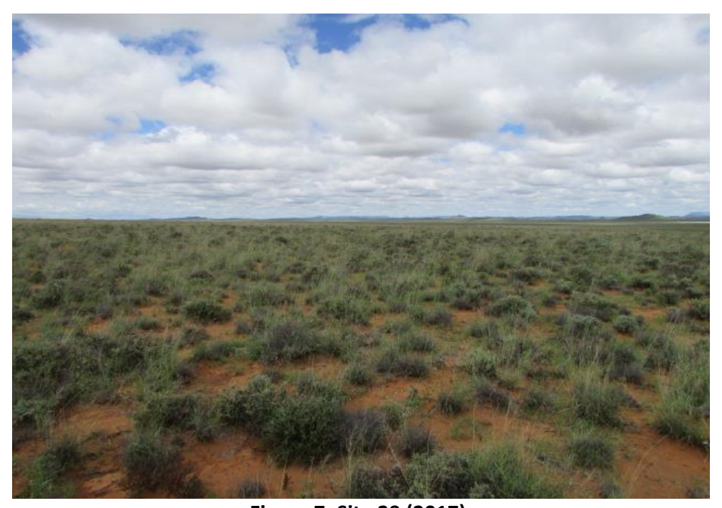
Figure 7: Site 29 (2017).