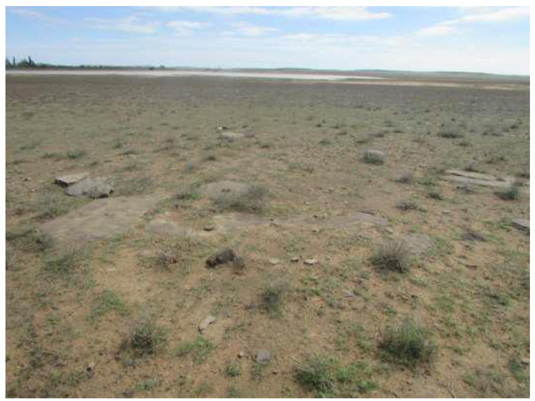
Figure 12: Site 1 with engravings (2021).