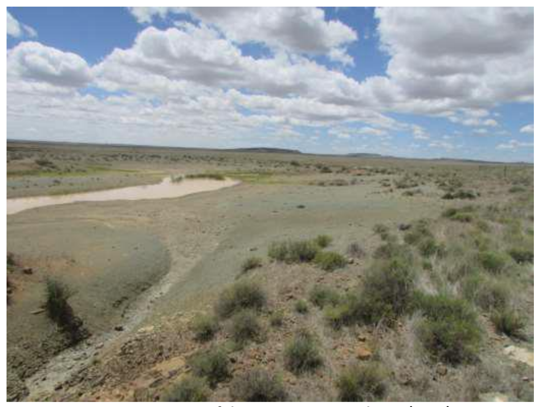
Figure 16: A view of the Site 6 & 7 general area (2021).