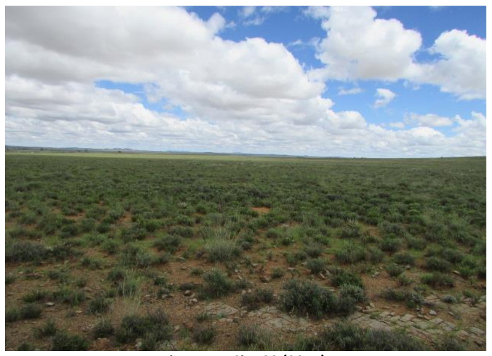
Figure 11: Site 33 (2017).