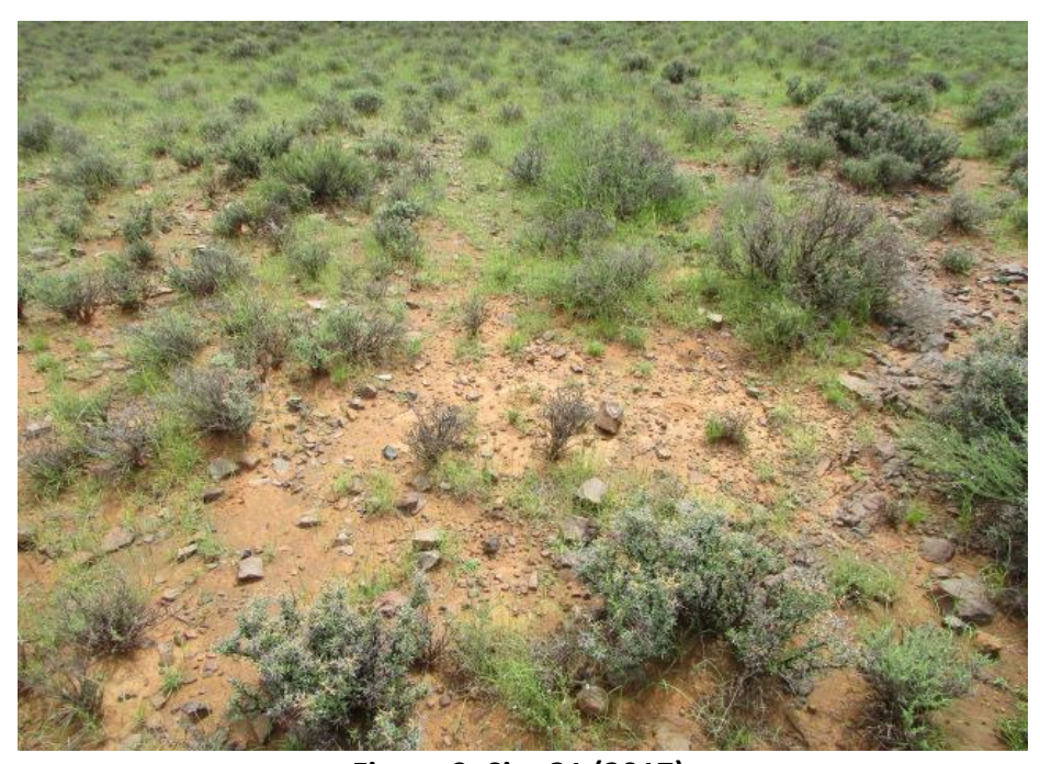
Figure 9: Site 31 (2017).