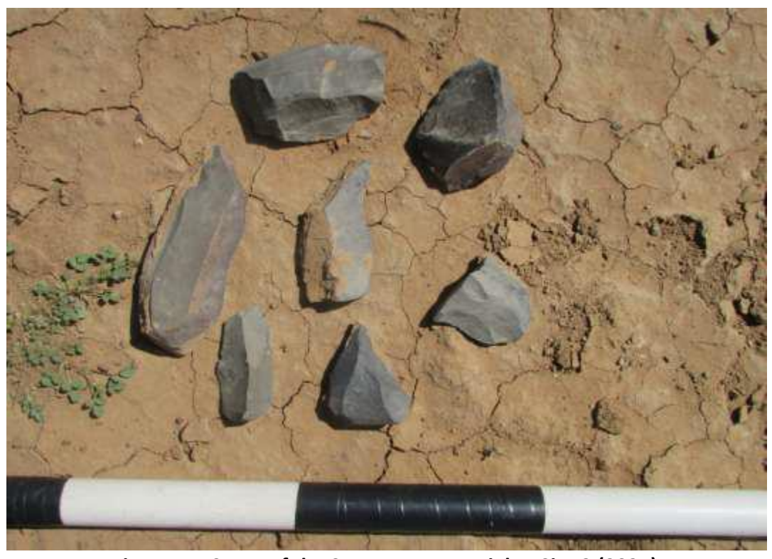
Figure 14: Some of the Stone Age material at Site 2 (2021).