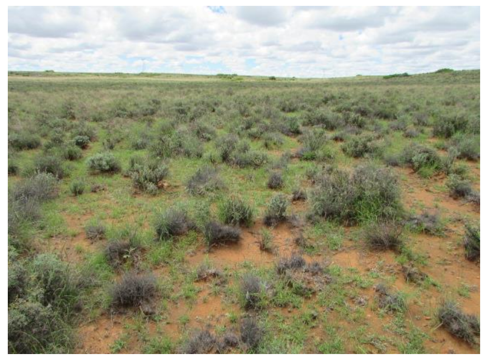
Figure 6: Site 28 (2017).