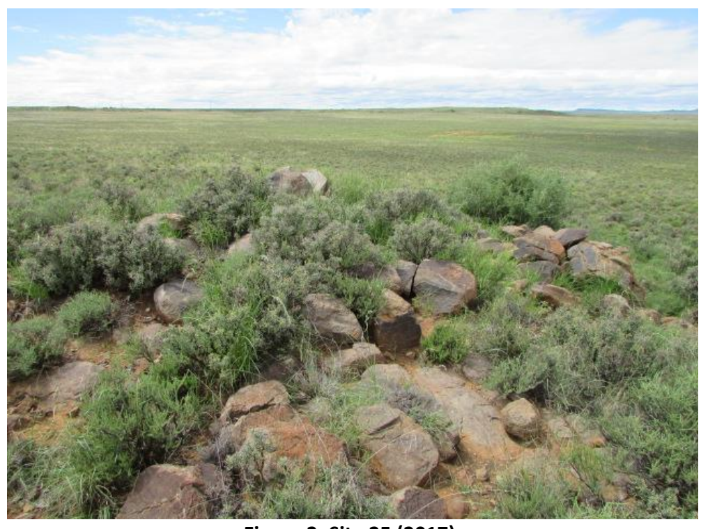
Figure 3: Site 25 (2017).