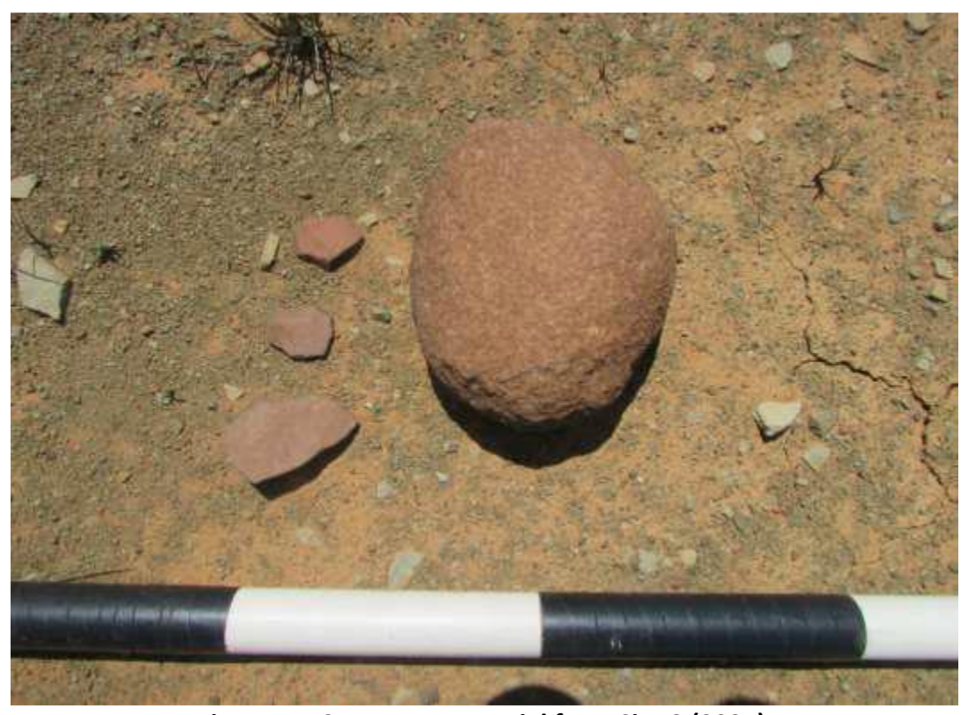
Figure 15: Stone Age material from Site 3 (2021).