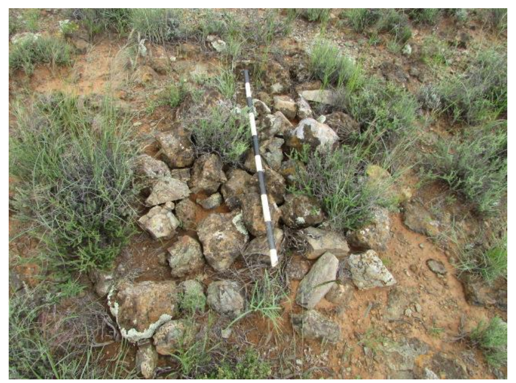
Figure 8: Site 30. This was identified as a possible grave (2017).