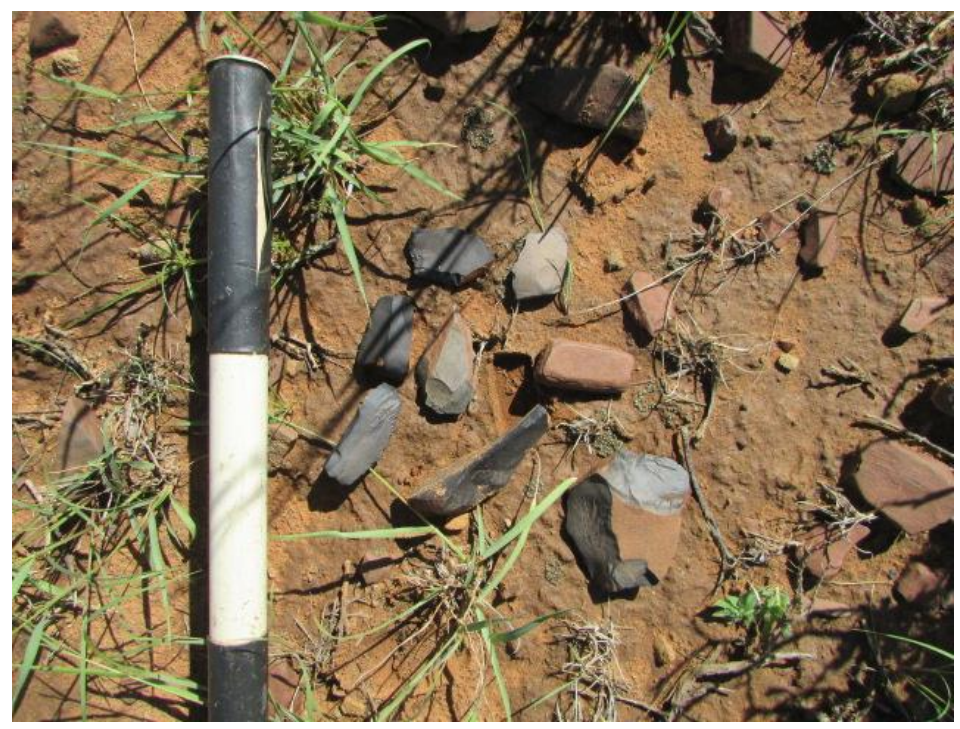
Figure 2: Some of the Stone Age material at Site 22 (2017).