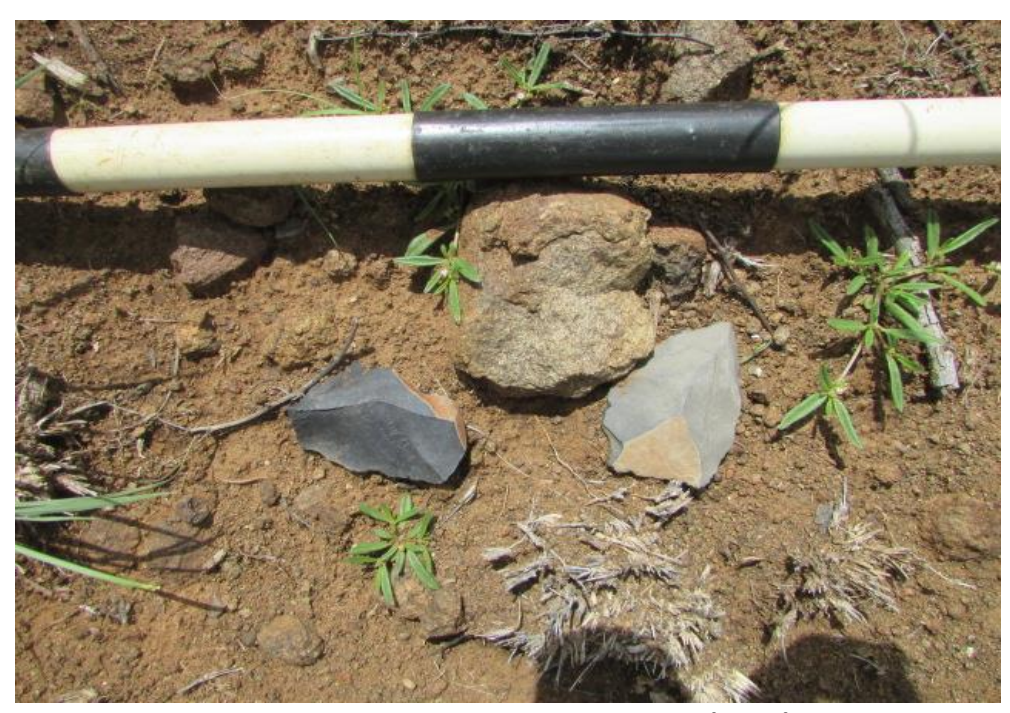
Figure 5: Some Stone tools at Site 26 (2017).