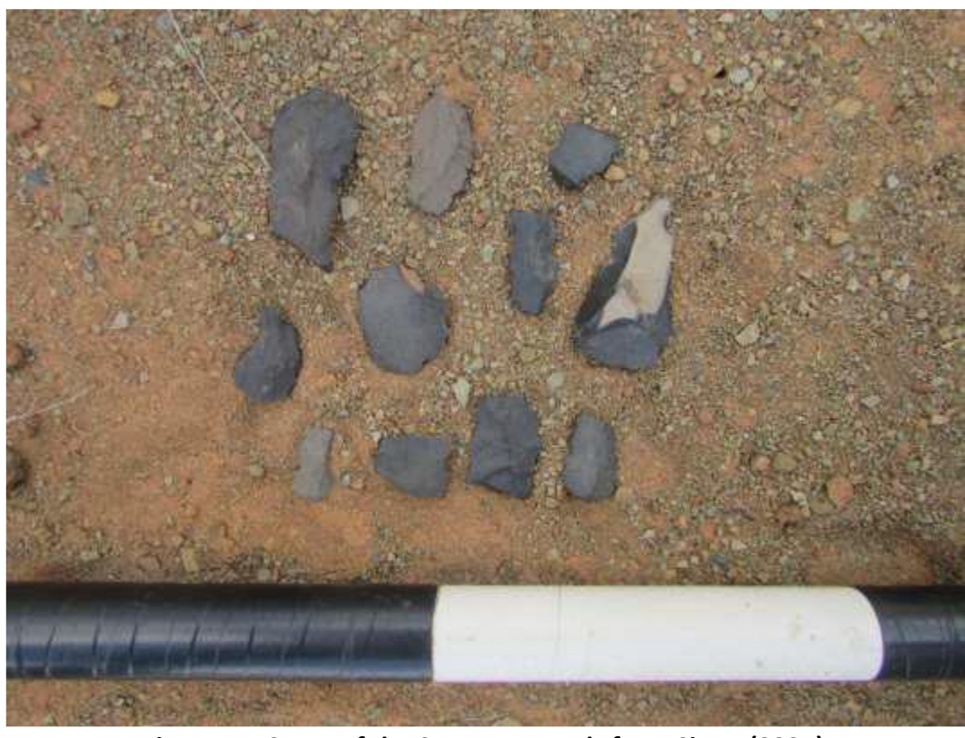
Figure 17: Some of the Stone Age tools from Site 7 (2021).