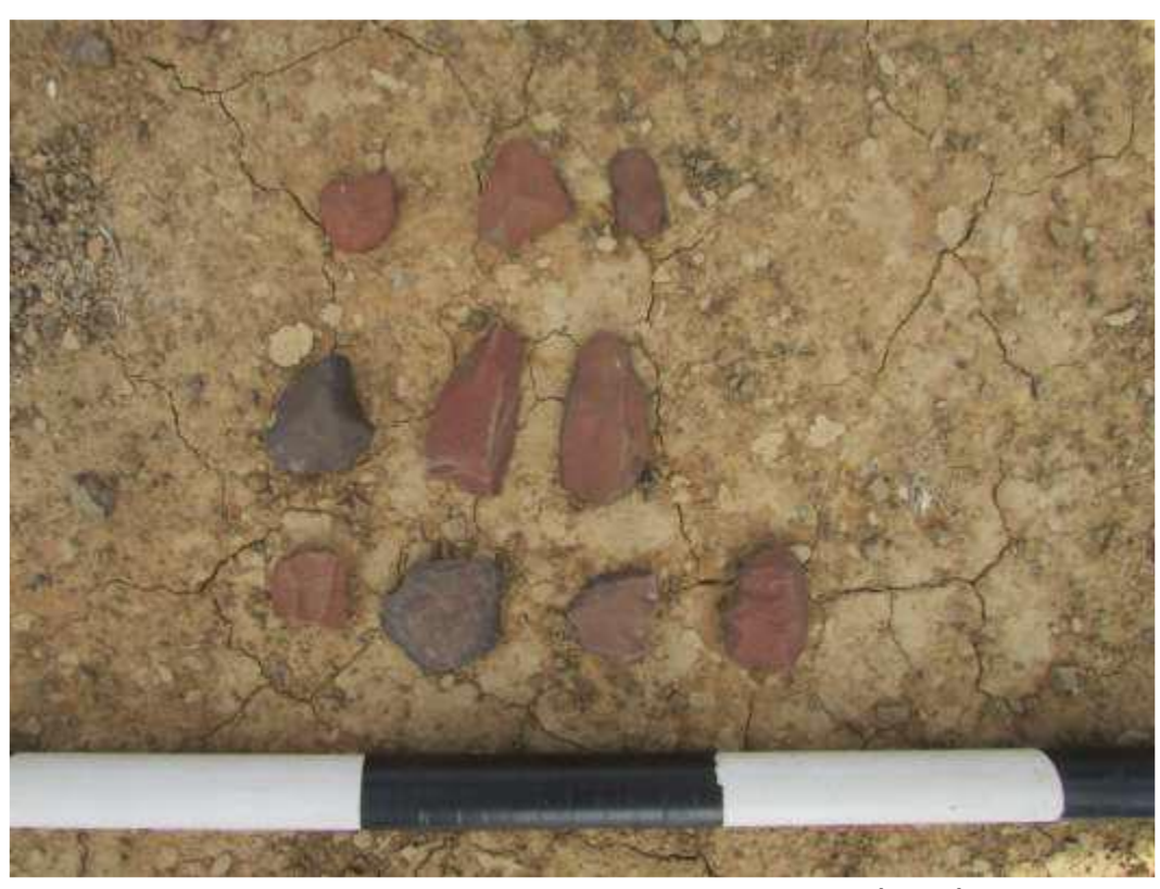
Figure 19: Some of the stone tools from Site 10 (2021).

THE PHOTO FOR SITE 12 WAS ACCIDENTALLY DISCARDED. THE SITE CONTAINS A SCATTER OF STONE AGE TOOLS LOCATED IN AN AREA NOT FAR FROM SITE 10.