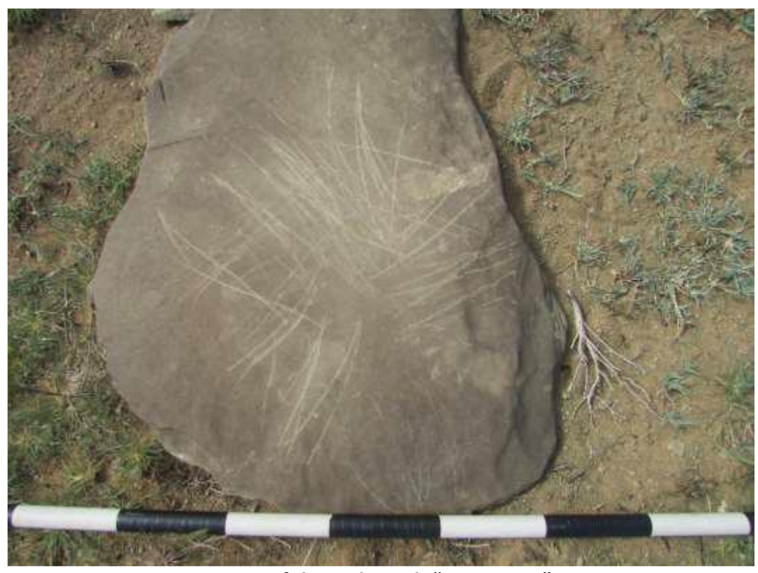
Figure 13: One of the rocks with "engravings" at Site 1.