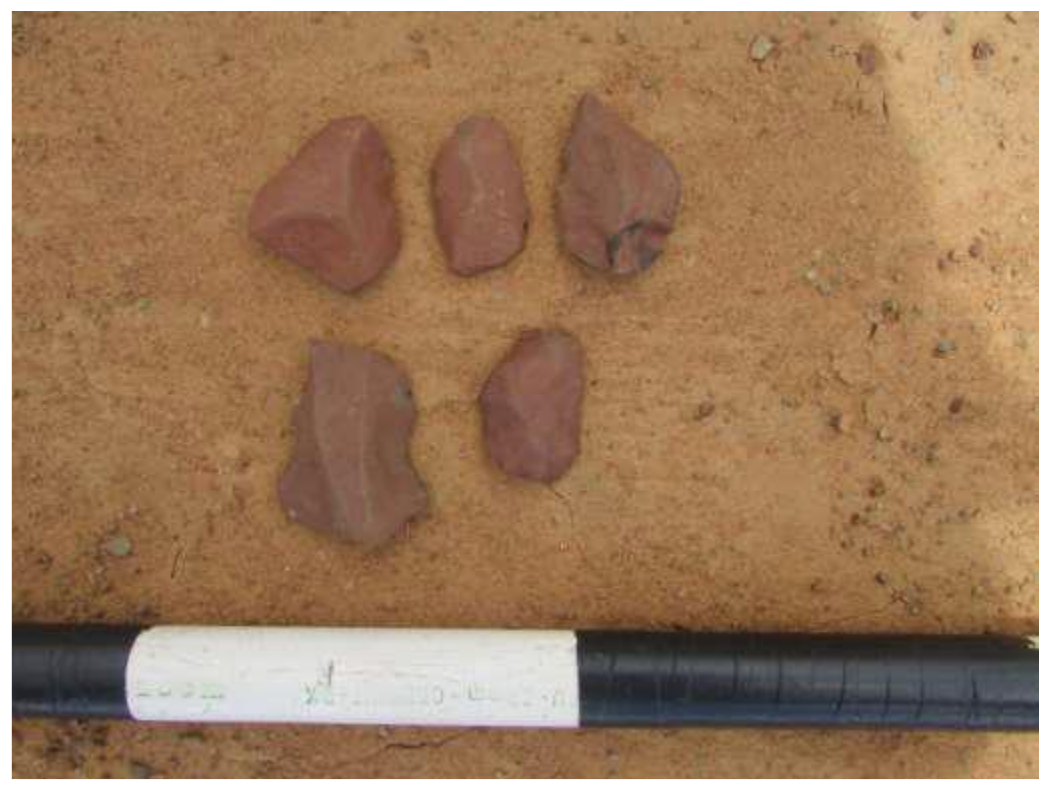
Figure 18: Some stone tools from Site 9 (2021).