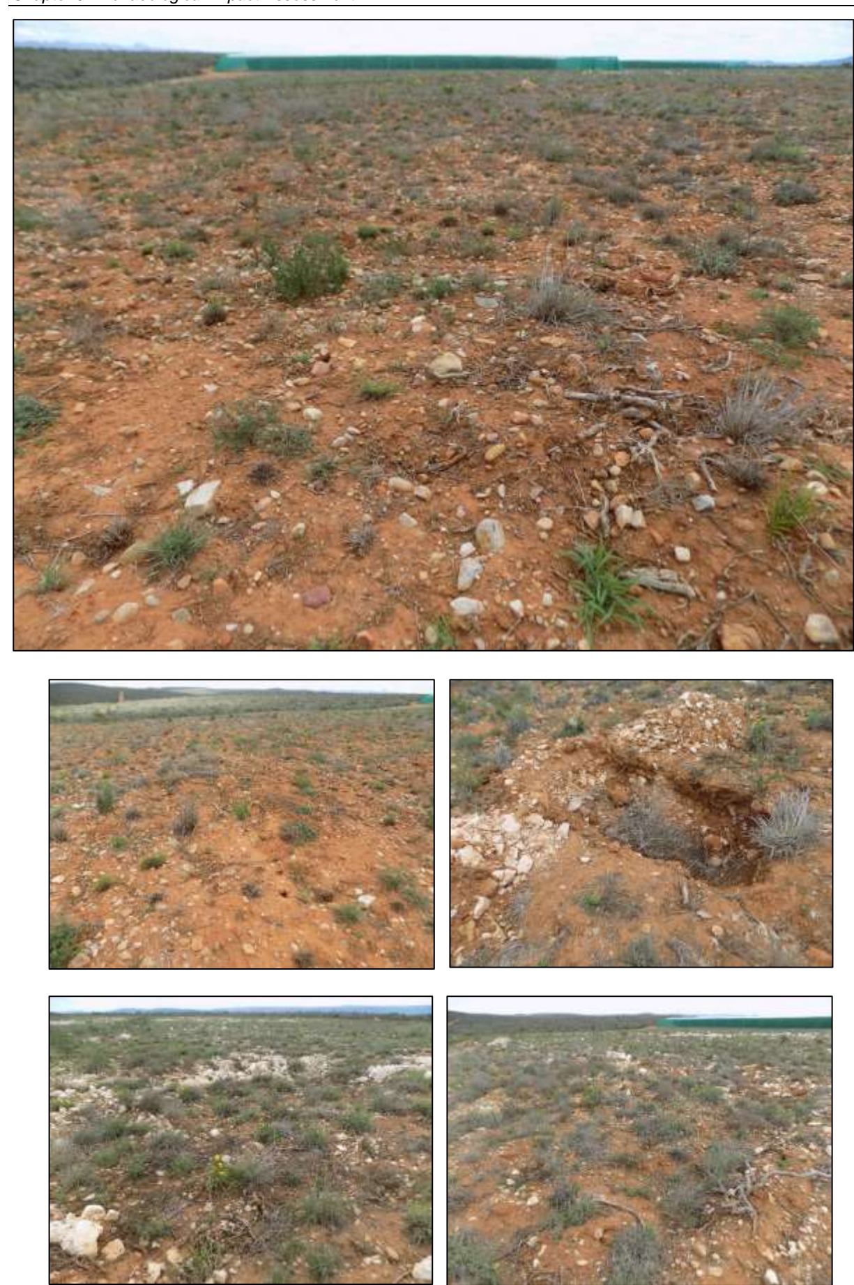
Figure 2. General views of the proposed area for the construction of a dam on the Remainder of Farm 632