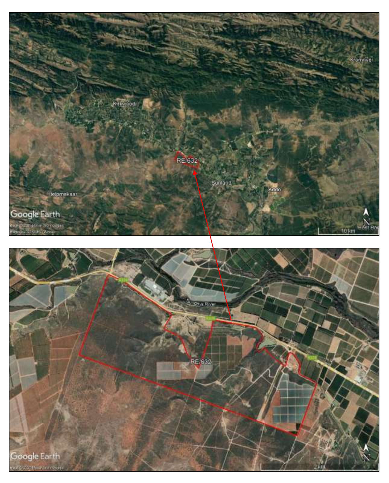
Map 2. Aerial images indicating the location of the Remainder of Farm 632 outlined by the red lines.