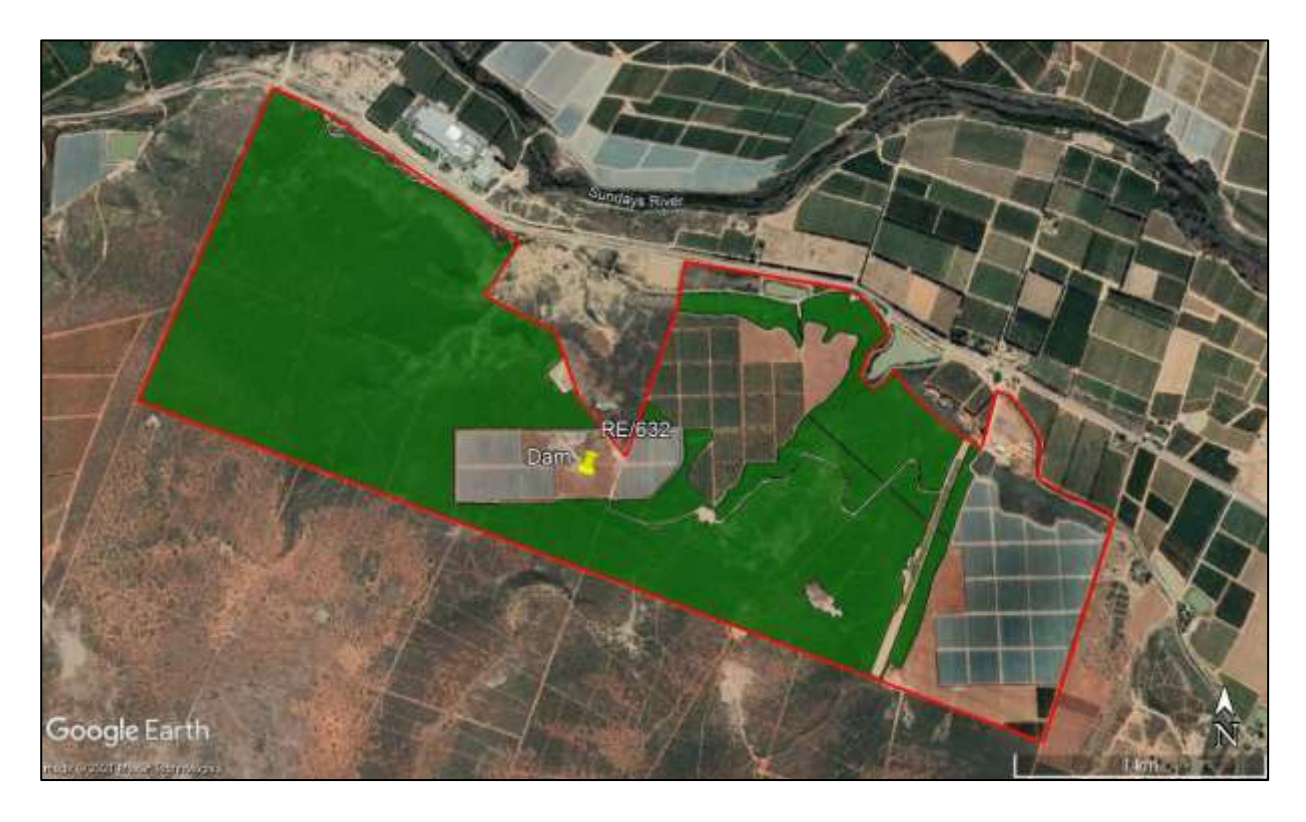
Map 3. Map of the area surveyed indicated in green. The proposed clearance of \sim 144 hectares of vegetation for the cultivation of citrus will be located within the green area. The proposed area for the construction of a dam is indicated by the yellow placemark.