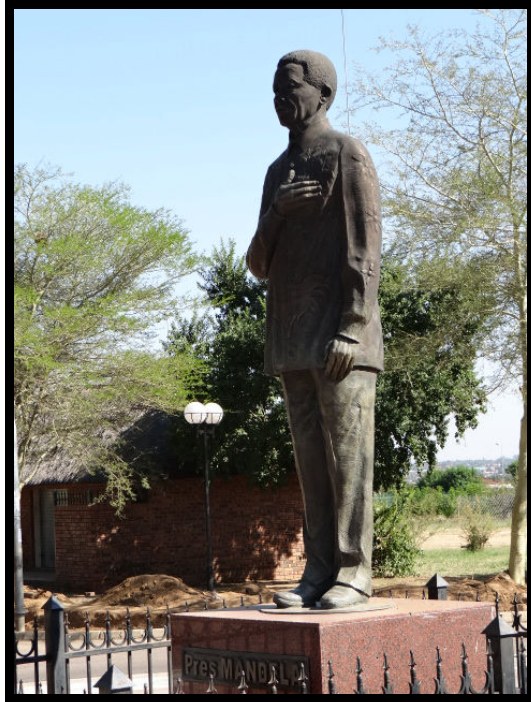
Statue of former President Nelson Mandela in Mandela Village

No archaeological or other important cultural heritage resources were found as the whole development areas have been graded during road construction in the past.