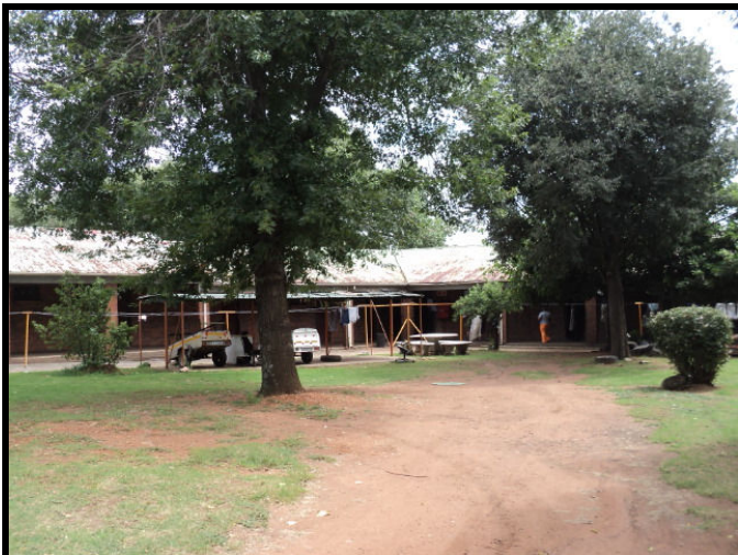
General view with large trees