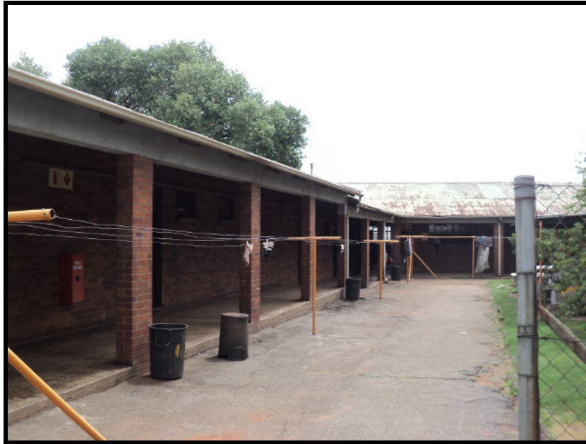
Sleeping facilities seen from the inside of the complex

There is a small shop near the entrance. Most buildings are sleeping facilities but there is also a large kitchen, dining local, storage, parking, and garages etc. – see photographs.