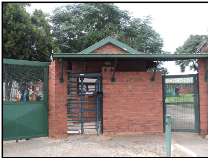
Entrance gate to compound

The site was inspected on foot together with a security guard. The outer rim of the complex is formed by sleeping facilities for men. These buildings also serve as security from outside intruders (see Google image). In the centre of the complex are large open spaces with large exotic trees – see photographs