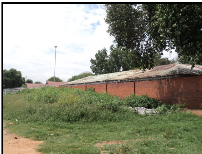
Outer wall formed by sleeping facilities