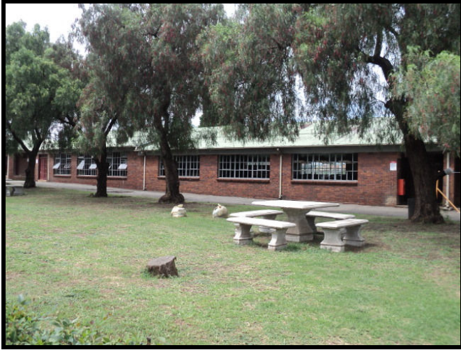
Dining room and kitchen