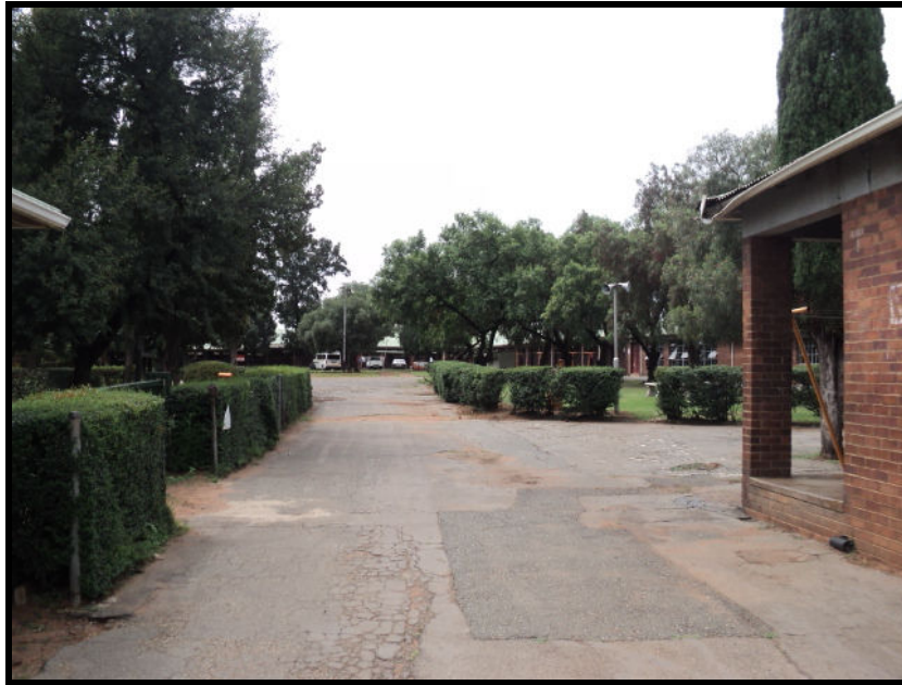
General view with hedges and trees

The majority of the buildings are built with good red face bricks. These bricks are typical of the late 1950's. We could find no one who knew how old the buildings are. We are of the opinion that the buildings date to the 1950's. These buildings are well kept and in a good condition, though some of the roofs need paint.