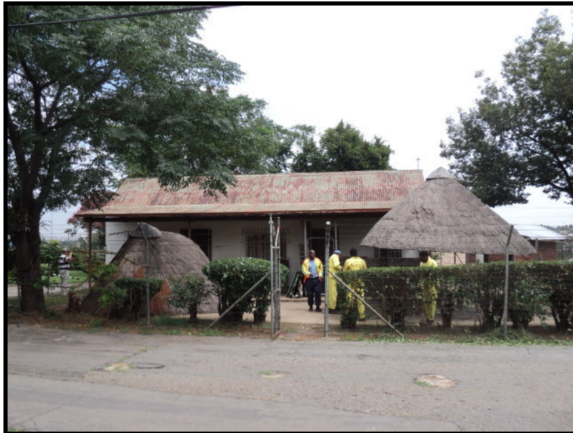
Small shop for residence

There is a small shop near the entrance. Most buildings are sleeping facilities but there is also a large kitchen, dining local, storage, parking, and garages etc. – see photographs.