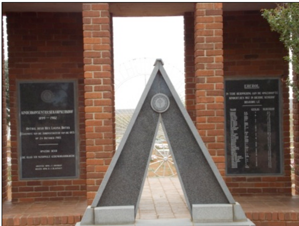
Figure 3. Springfontein Concentration Camp Cemetery

Should the developers decide to utilise any of the existing structures for their operations and this entails alterations to the buildings it is recommended that they subject these to further study before such actions.