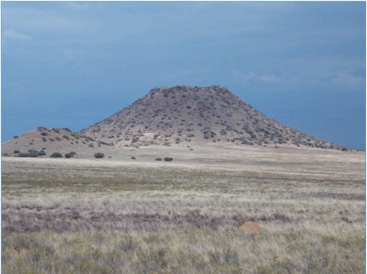
Figure 4. General landscape

Several skirmish sites related to the South African War is also found in the area and it is expected that indications of these, such as spent cartridges, tin cans etc. could be expected in the study area.