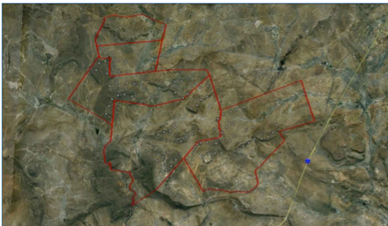
Figure 2. Aerial view of study area with turbine placements