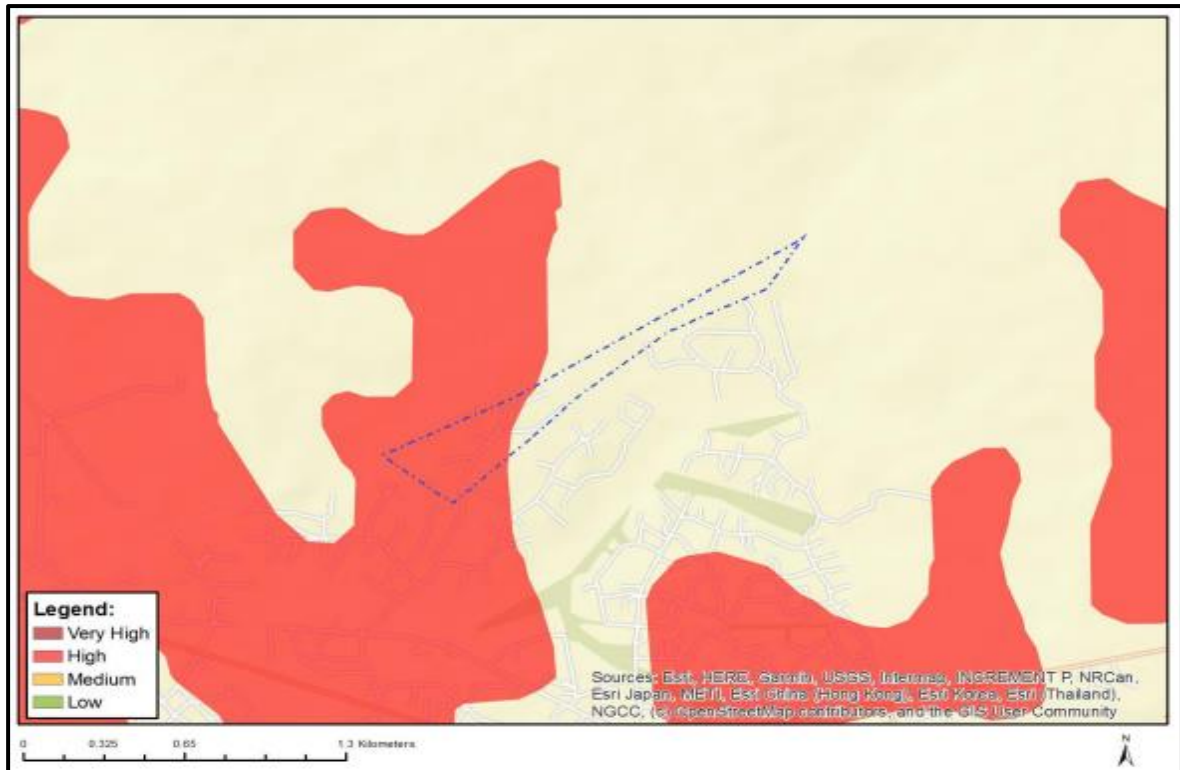
Figure 3:1: Relative Paleontology Sensitivity Map (merged)