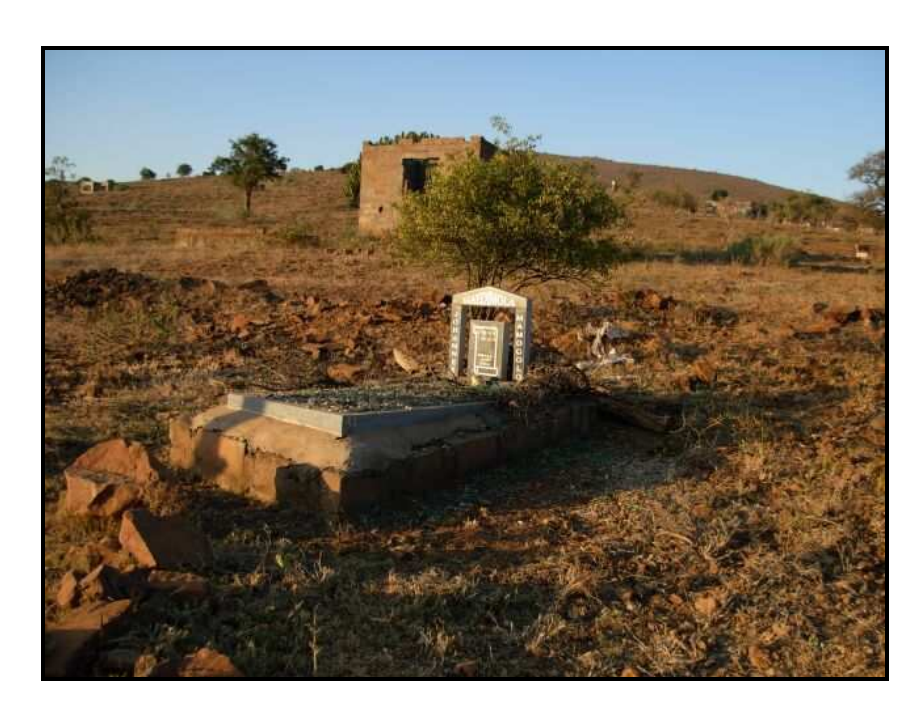
Figure 7: Site 2430AC-003