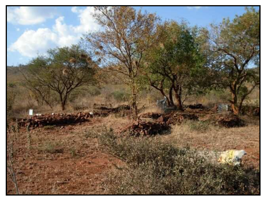
Figure 3: Site 2430AD-001