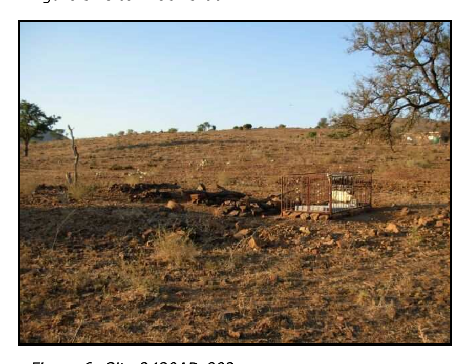
Figure 6: Site 2430AD-002