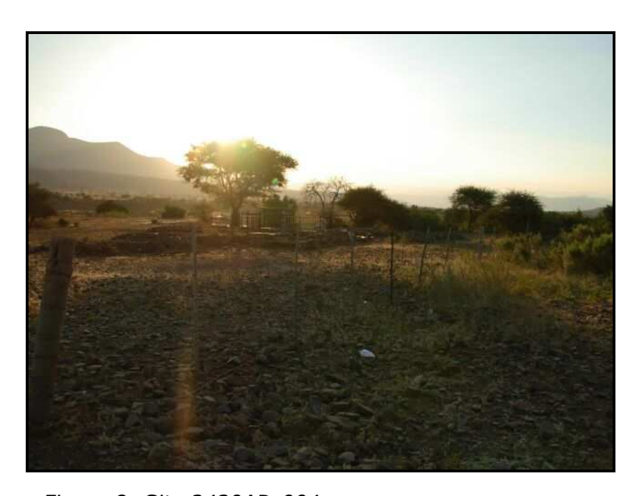
Figure 8: Site 2430AD-004