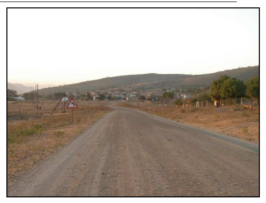
Figure 2: Road conditions close to Malokele