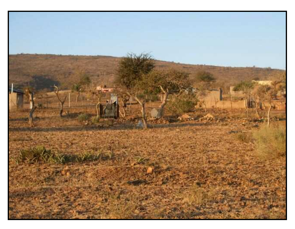
Figure 9: Site 2430AC-005