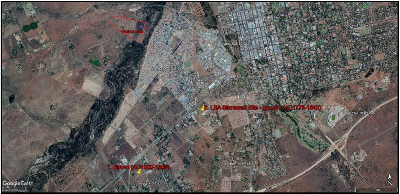
Figure 5. Project area in relation to known heritage remains on Google image.