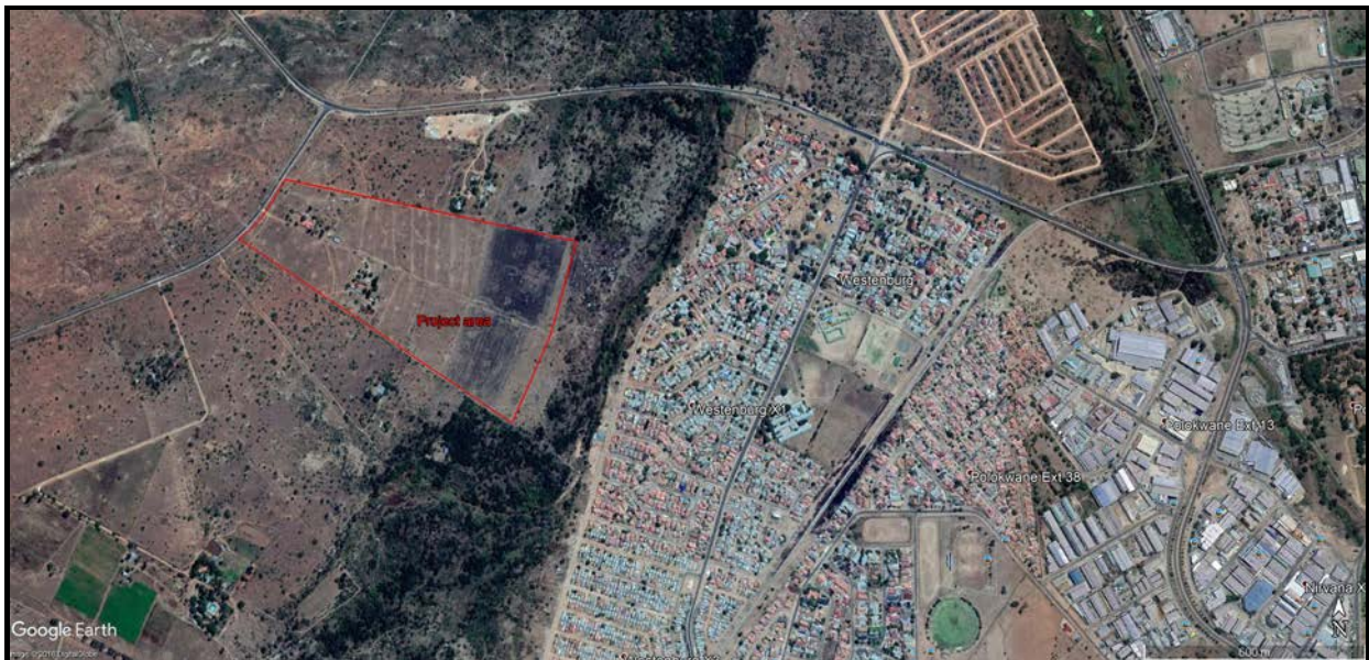
Figure 4. Project area in relation to Polokwane suburbs on Google image.