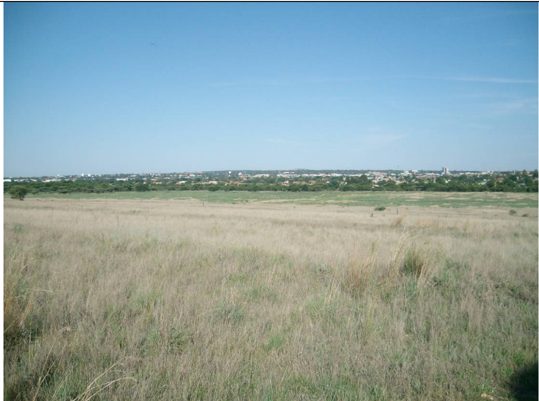
Figure 1. View of proposed development area – eastern direction.