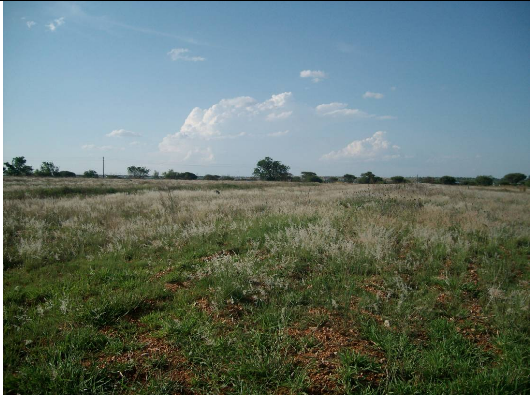
Figure 2. View of proposed development area – northern direction.