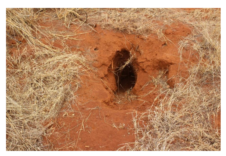
Figure 8- Edges of animal barrow pits were also assessed for evidence of archaeological resources that may have been brought to the surface – none were found