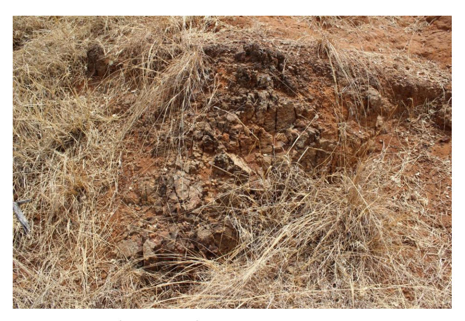
Figure 6- Traces of quarry wall from previous road construction or rehabilitation activities