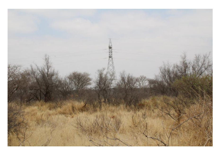
Figure 3- Grass and acacia trees that characterised both alternatives. Note existing Eskom Powerline in the background.