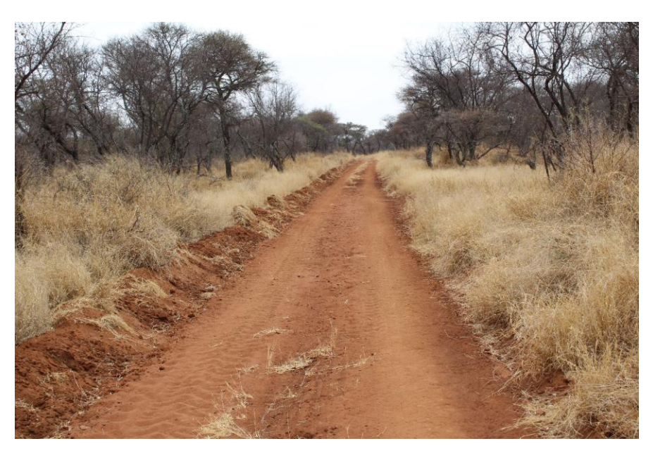
Figure 5- Road within the farm and it cuts across Option 1