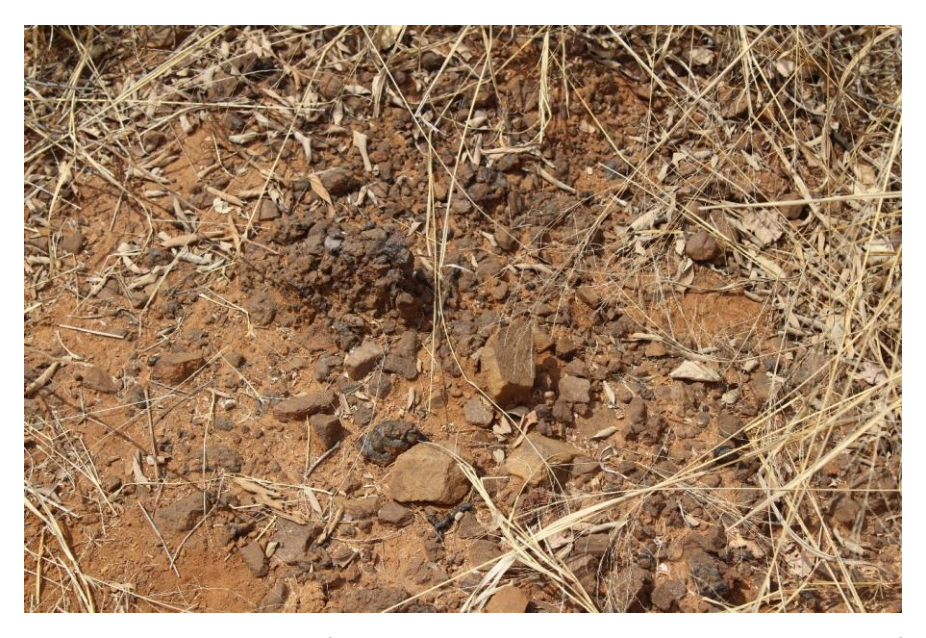
Figure 4- Exposed layer of gravel. No stone tools or material culture was found