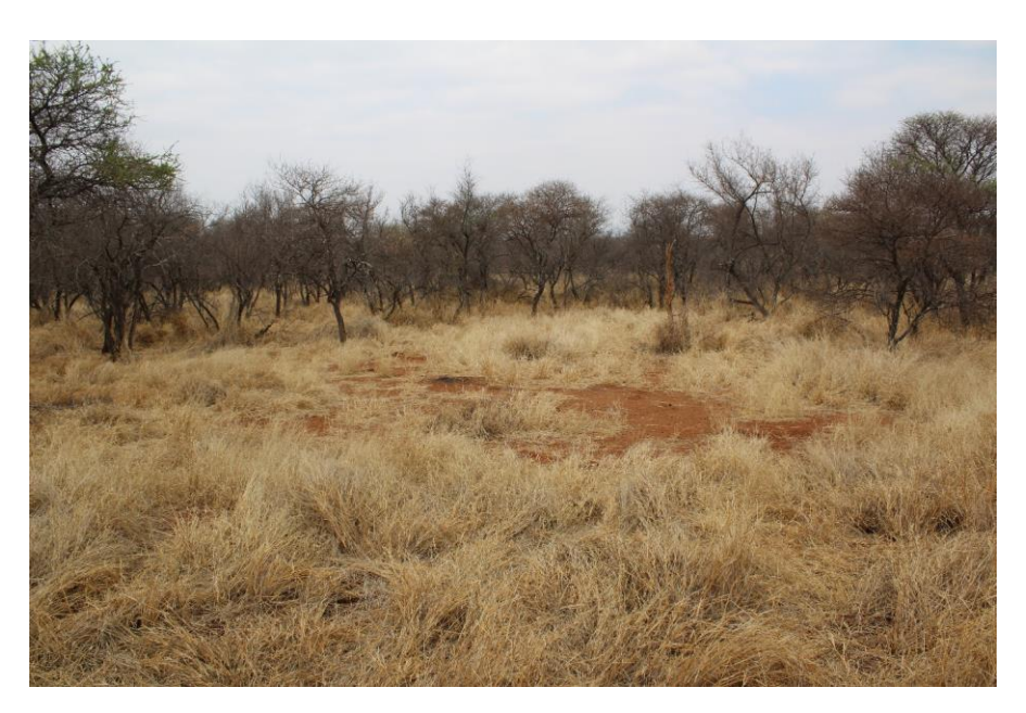
Figure 7- Patch of exposed layer of soil which was surveyed for archaeological artefacts