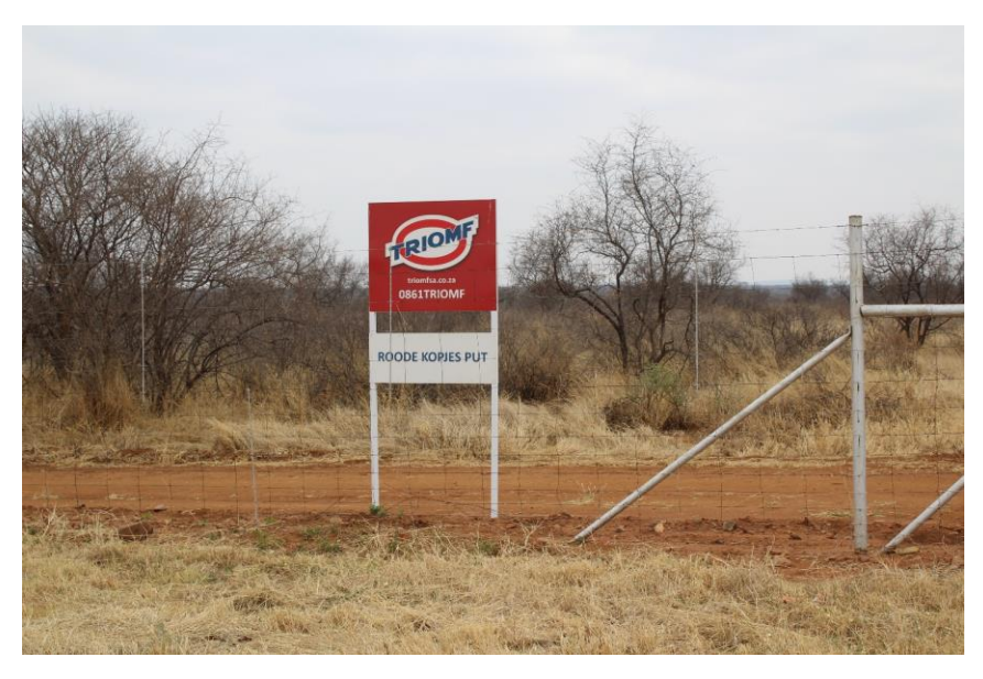
Figure 2- Signage of the game farm in which the two site Options are situated. The signage is at the entrance to the study area

Below are pictures showing the general landscape setting of the receiving environment within both Option 1 and Option 2 as shown in Figure 1 above: