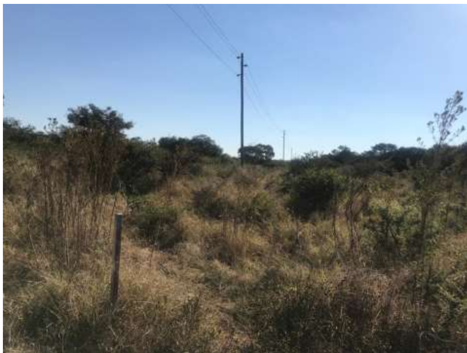
Figure 5: General view of the proposed site.