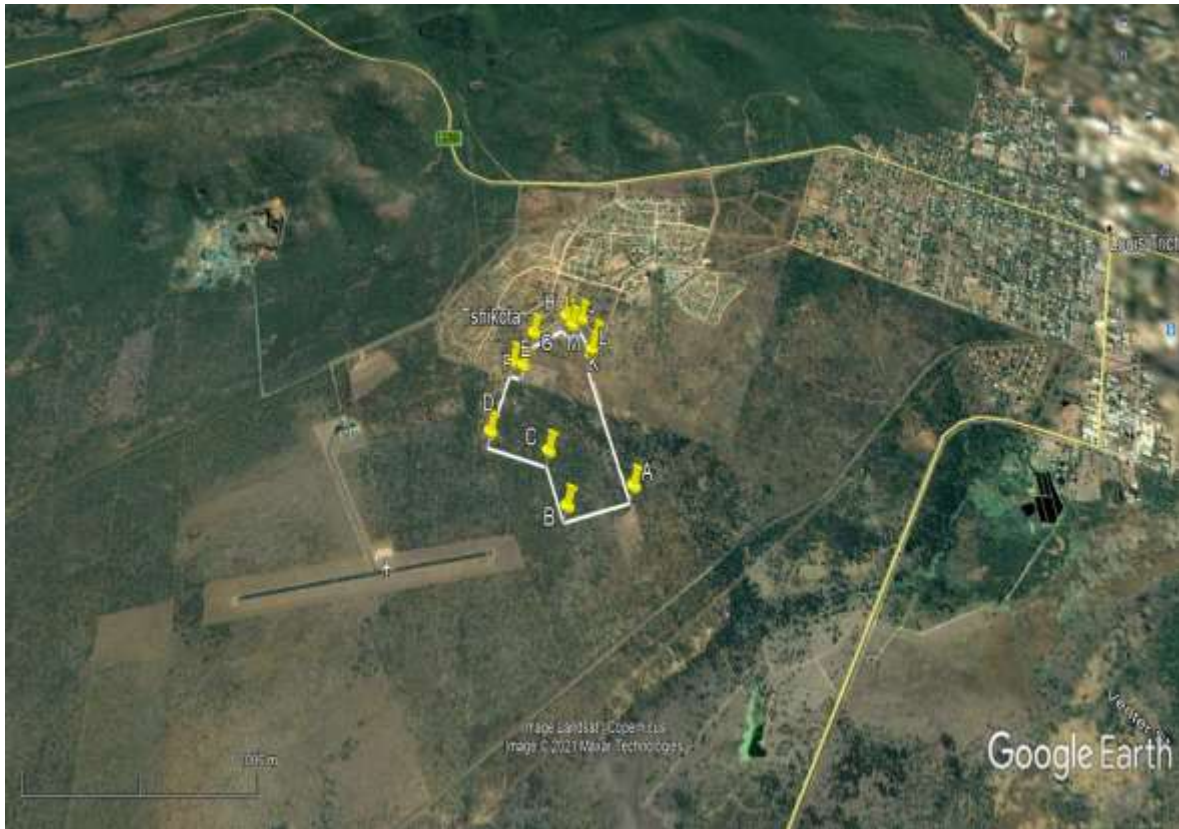
Figure 2: Old aerial photo map