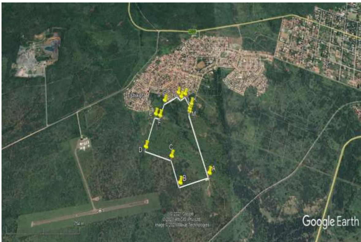
Figure 1: Aerial View of the proposed site.

The vegetation of the area and landscape features varies from low mountains, slightly to extremely irregular plains to hills. The geology and Soils is Soutpansberg Group of sandstones with lesser amounts of conglomerate, shale and basalt is mostly exposed in this area. Some Karoo Supergroup rocks are also present. Most of the area has deep sands to shallow sandy lithosols. A few limited areas with heavier soil, particularly in the B-horizon, occur near the western boundary of the Kruger National Park.