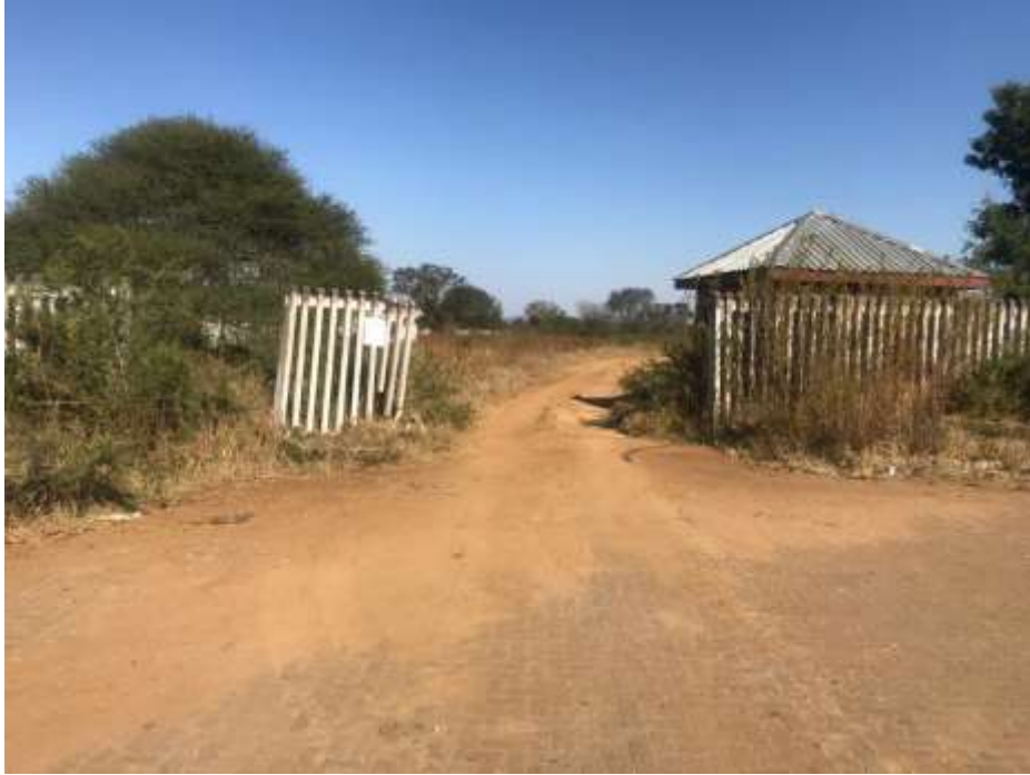
Figure 10: View of Tshikota grave yard gate.