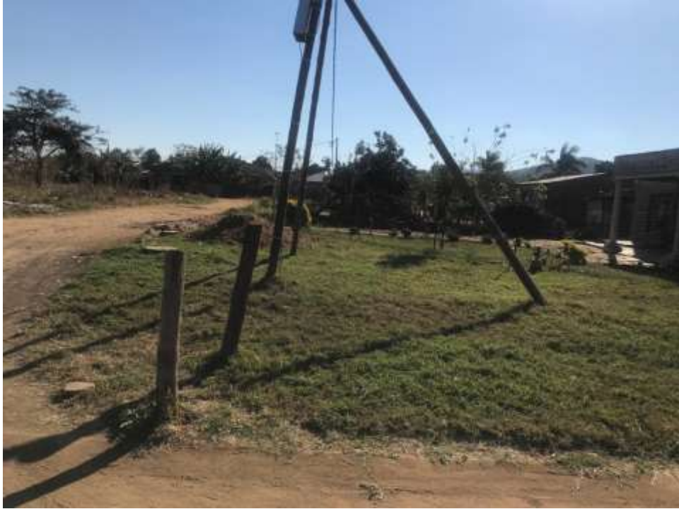
Figure 6: View of Tshikota Township where the new development will start.