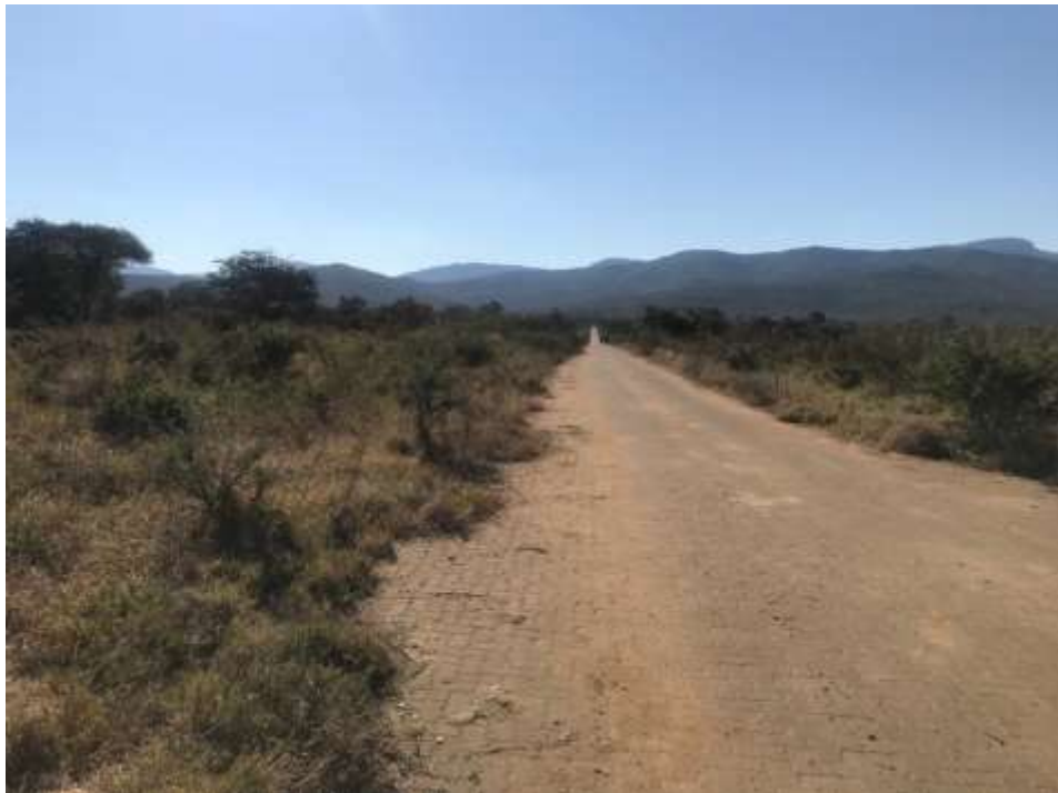
Figure 7: Road to the grave yard taken from the grave yard gate and the Proposed site to the left.