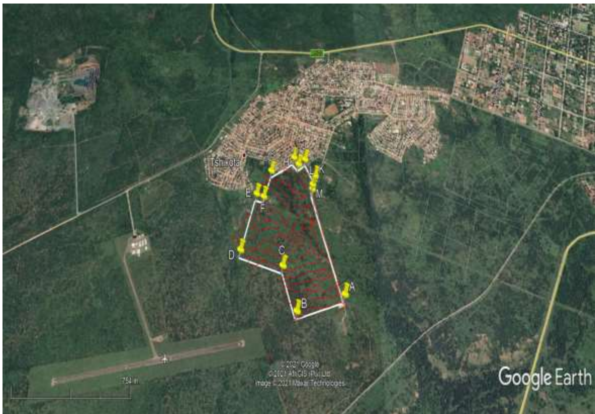
Figure 3: View of the field work track record.