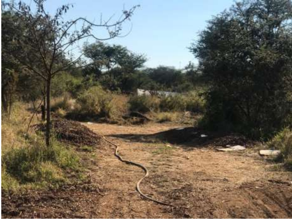
Figure 8: Access road to the Masowe Church (note the white cloth).