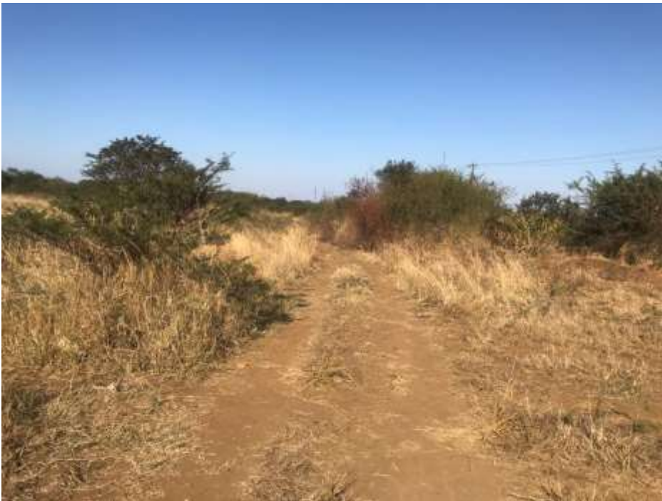
Figure 9: Road within the proposed site which end at the Masowe Church.