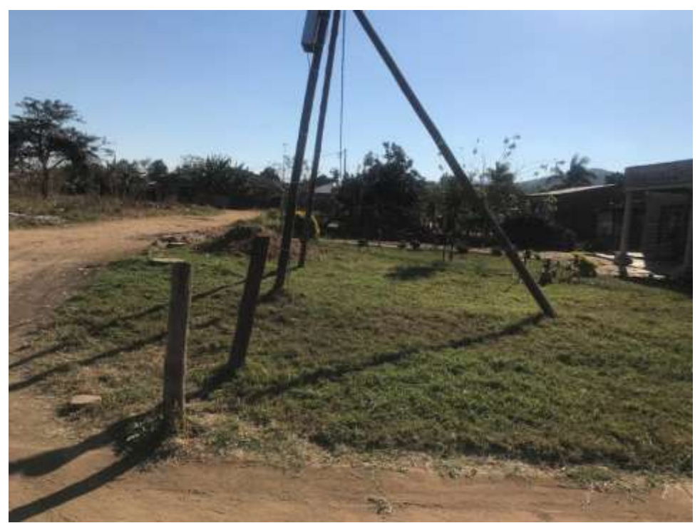
Figure 6: View of Tshikota Township where the new development will start.