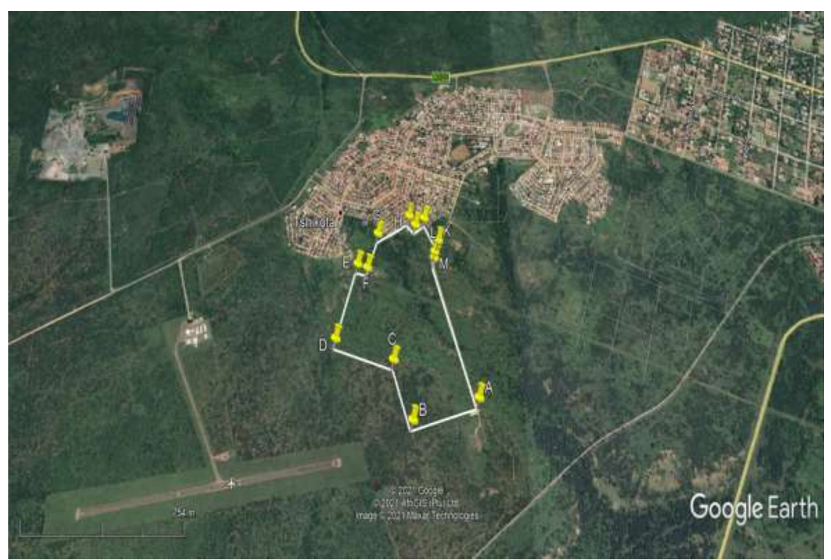
Figure 1: Arial View of the proposed site.

The vegetation of the area and landscape features varies from low mountains, slightly to extremely irregular plains to hills. The geology and Soils is Soutpansberg Group of sandstones with lessor amounts of conglomerate, shale and basalt is mostly exposed in this area. Some Karoo Supergroup rocks are also present. Most of the area has deep sands to shallow sandy lithosols. A few limited areas with heavier soil, particularly in the B-horizon, occur near the western boundary of the Kruger National Park.