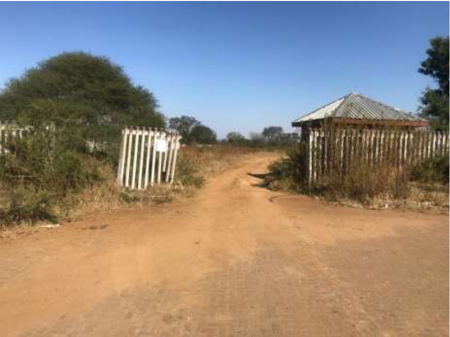
Figure 10: View of Tshikota grave yard gate.