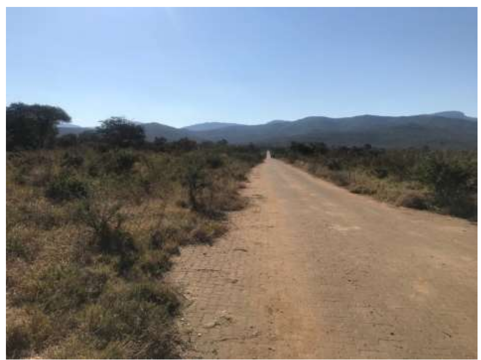
Figure 7: Road to the grave yard taken from the grave yard gate and the Proposed site to the left.