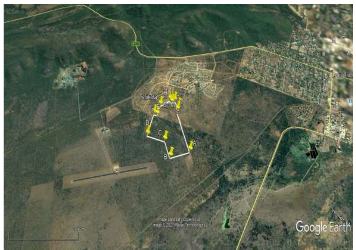
Figure 2: Old aerial photo map