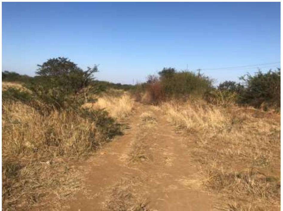
Figure 9: Road within the proposed site which end at the Masowe Church.