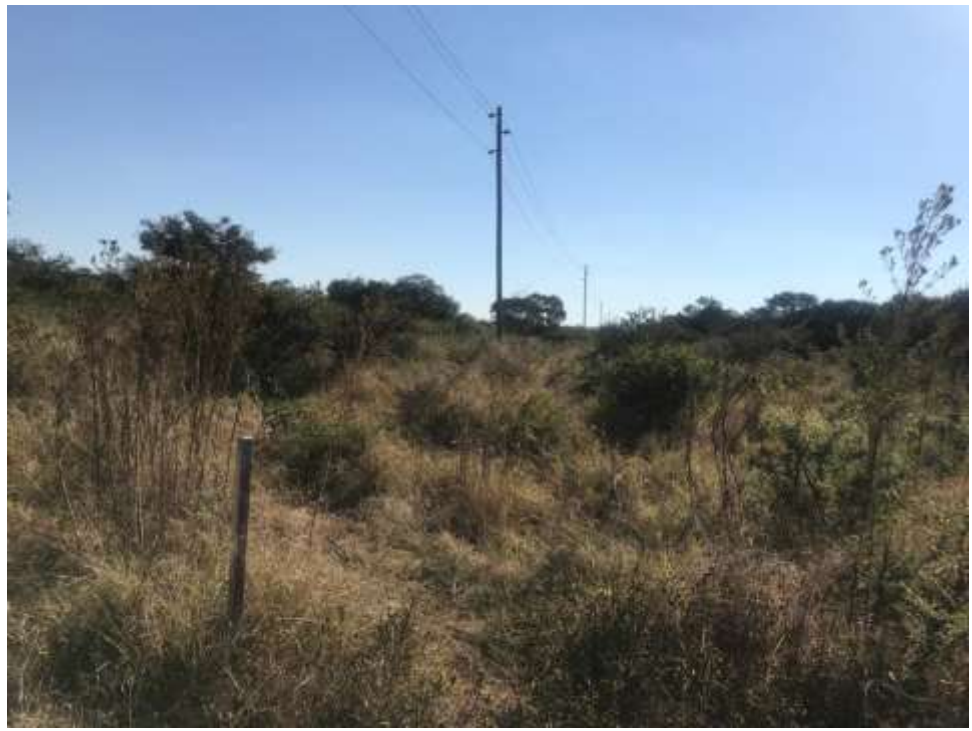
Figure 5: General view of the proposed site.