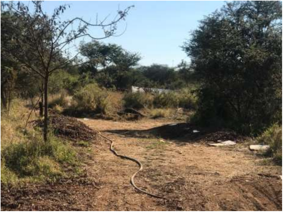
Figure 8: Access road to the Masowe Church (note the white cloth).