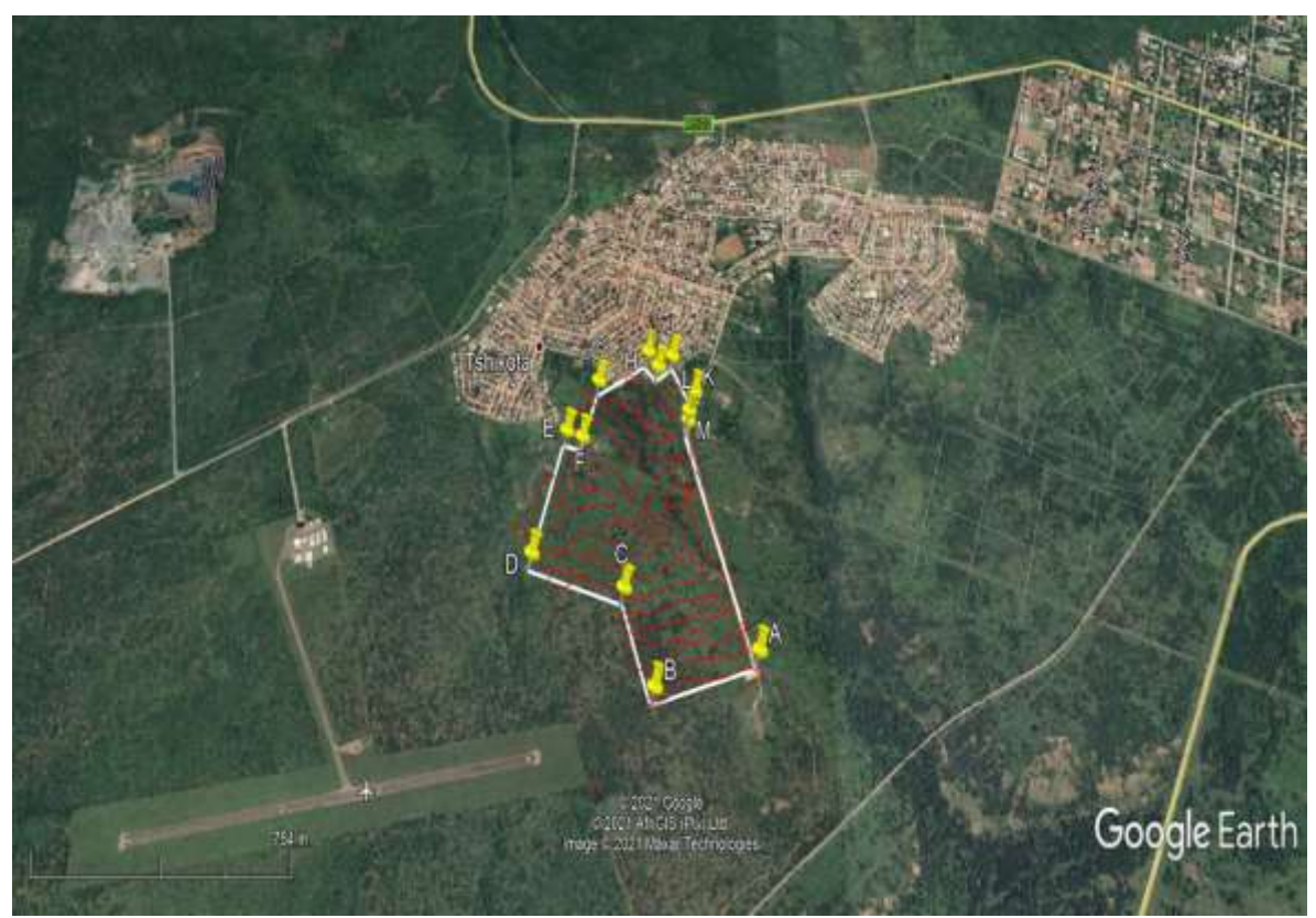
Figure 3: View of the field work track record.