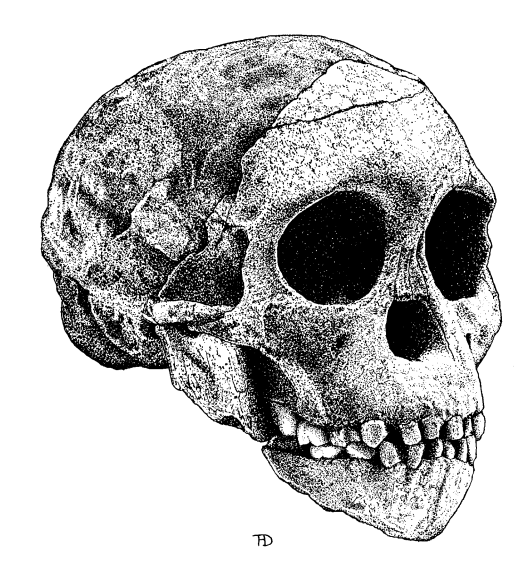
Figure 5: The Taung Skull (Illustration: JF Durand)

The Taung Skull Fossil Site was declared as a National Heritage Site in 2002. It was inscribed on the World Heritage List (WHL) by the United Nations Educational, Scientific and Cultural Organisation (UNESCO) in 2005. It forms part of the Cradle of Humankind World Heritage Site (WHS), together with Sterkfontein, Swartkrans, Kromdraai and Environs, and the Makopane Valley fossil hominid sites in South Africa.