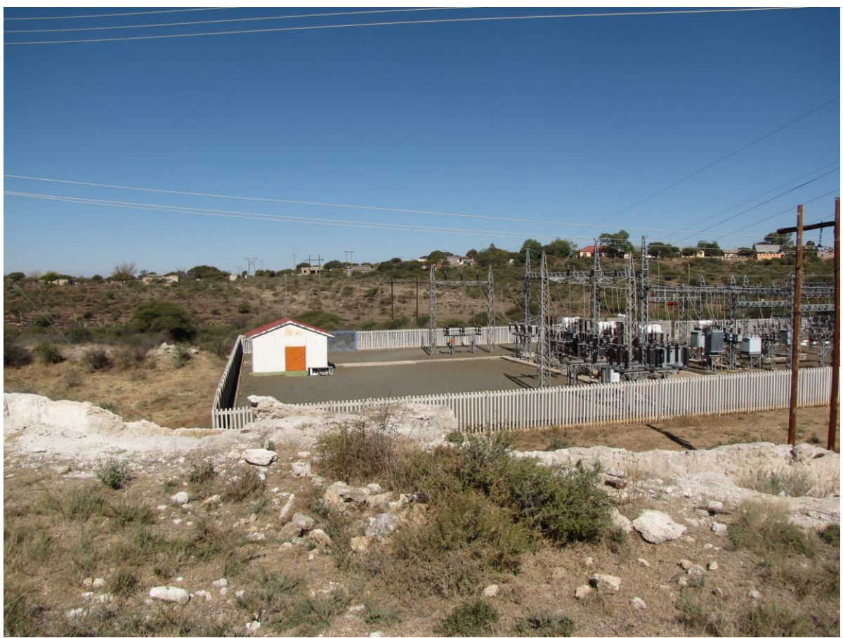
Figure 3: The Norlim Substation looking south (27°37.263' S, 24° 38.407 E')

Large parts of the study area and surroundings are covered by Quaternary aged aeolian sand. Alluvium was set down over the aeolian sand adjacent to the rivers in the region.