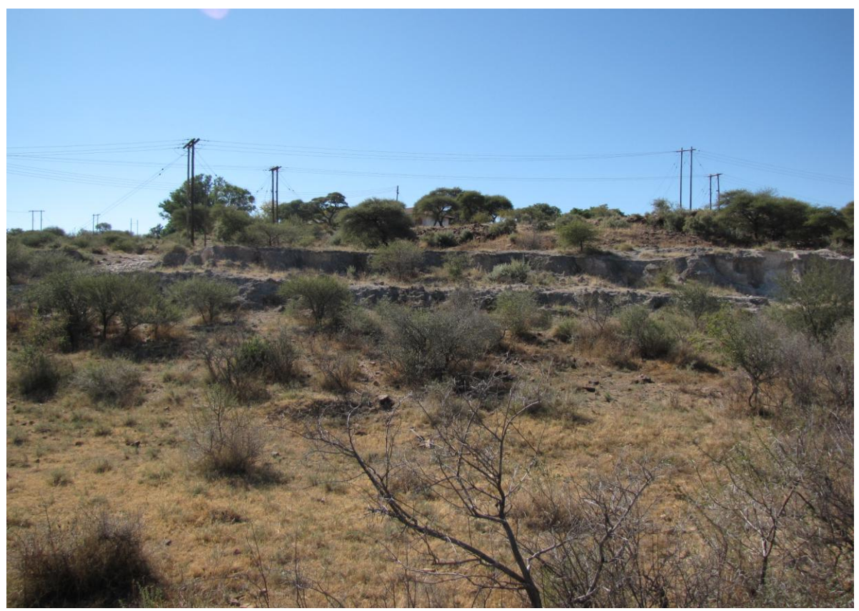
Figure 4: The area east adjacent to the Norlim Substation

The Boomplaas Formation consists of dolomite interbedded with quartzite, shale and flagstone. All varieties of pure limestone to pure dolomite occur in this formation. The dolomite is dark grey but erode to a brownish red colour while the limestone weathers to a blue-grey colour (Schutte, 1994). The dolomite changes from argillaceous in the south (where the study area is situated) to oolitic and stromatolitic in the north (Beukes, 1979).