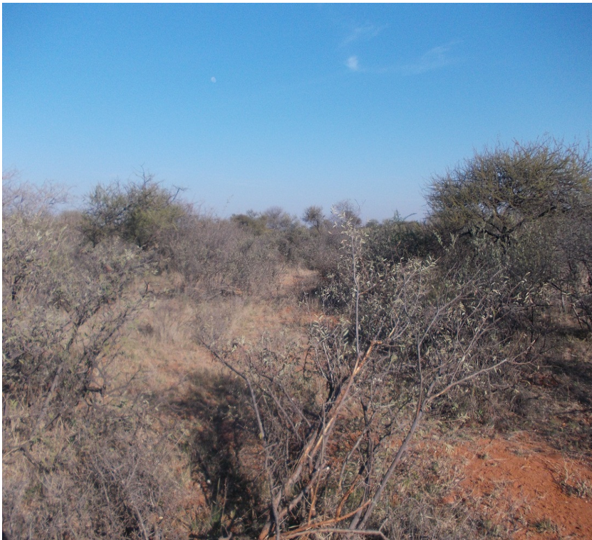
Fig 1. View of development area