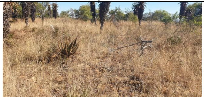
Fig 8. View of stone walling