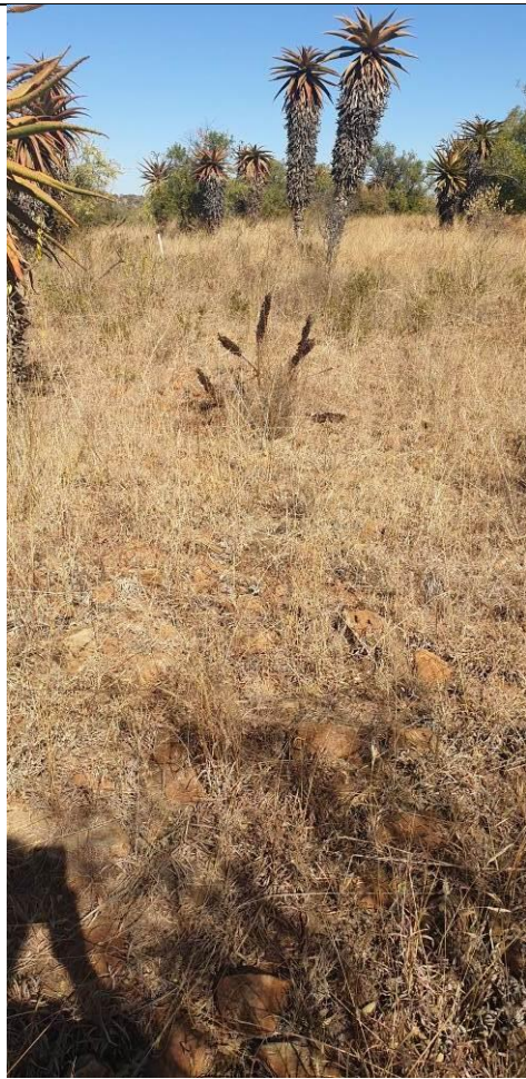
Fig 5. View of stone walling