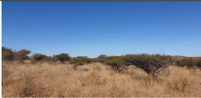
Fig 1: View of area

Proposed development: To establish new student accommodation and an extension to the school