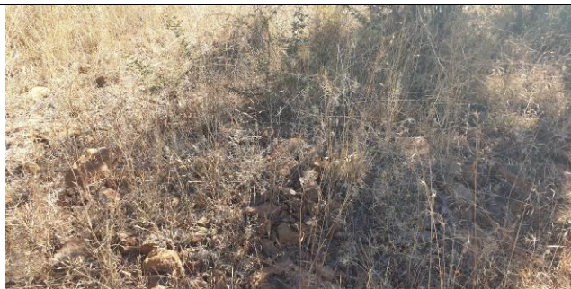
Fig 7. View of stone walling