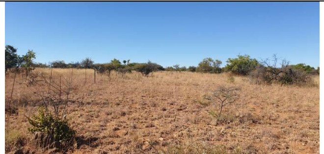
Fig 4: View of area