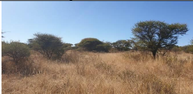
Fig 3: View of area