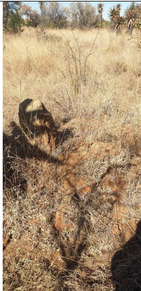
Fig 6. View of stone walling