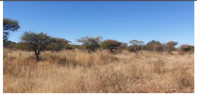
Fig 2: View of area