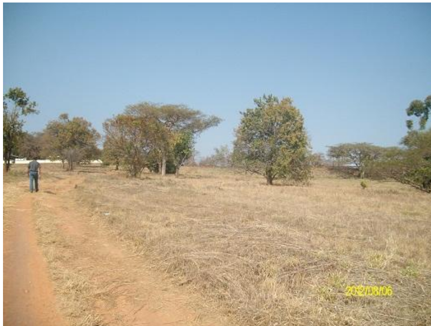
Fig 1. View of development area