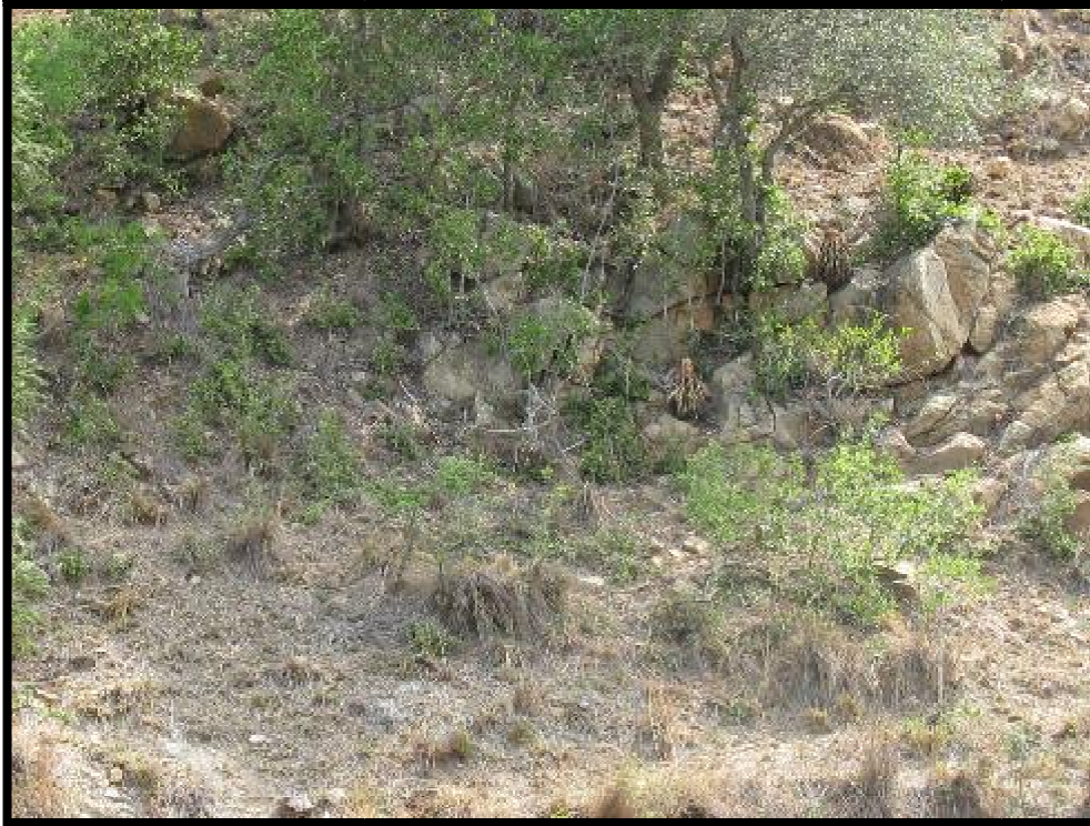
Figure 2. DOT Borrow Pit 31 near Ulundi.