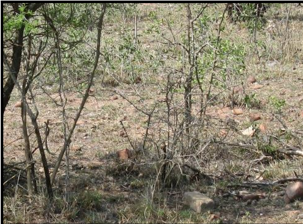
Figure 3. The area surrounding Borrow Pit 31 earmarked for expansion.