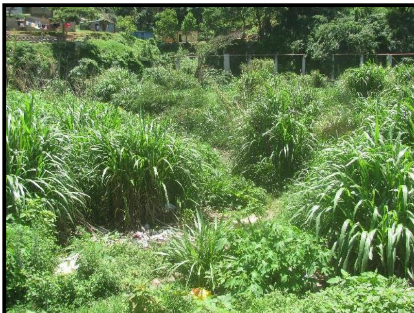
Figure 4. Area leading from the proposed pump station.