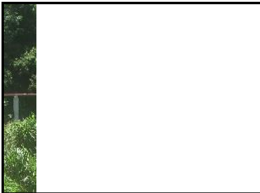
Figure 3. Vicinity of the proposed pump station.