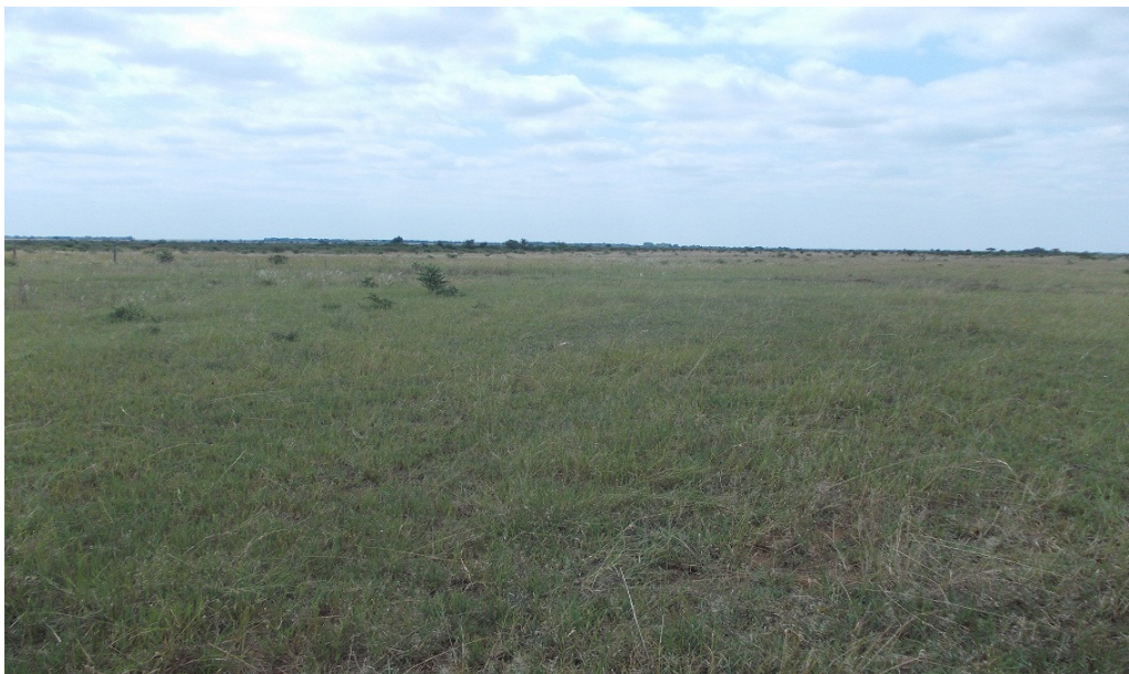
Fig 1. View of development area