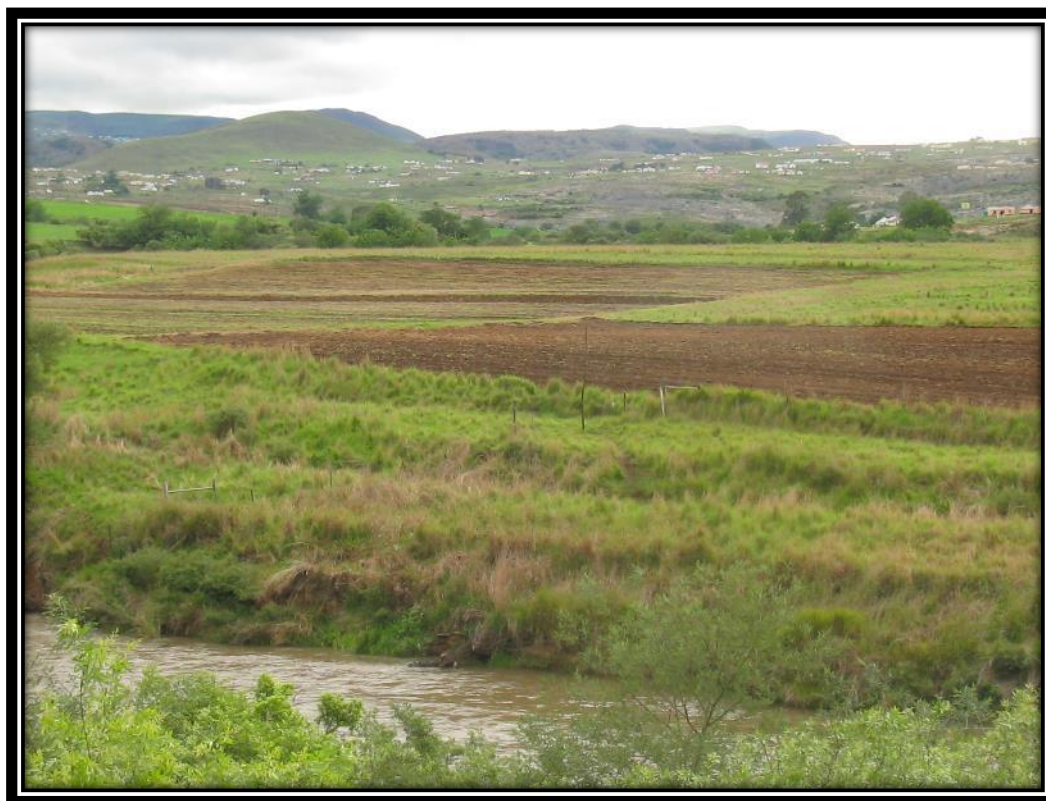
Figure 4. View over the study area, the Ngangwane River is situated in the foreground.