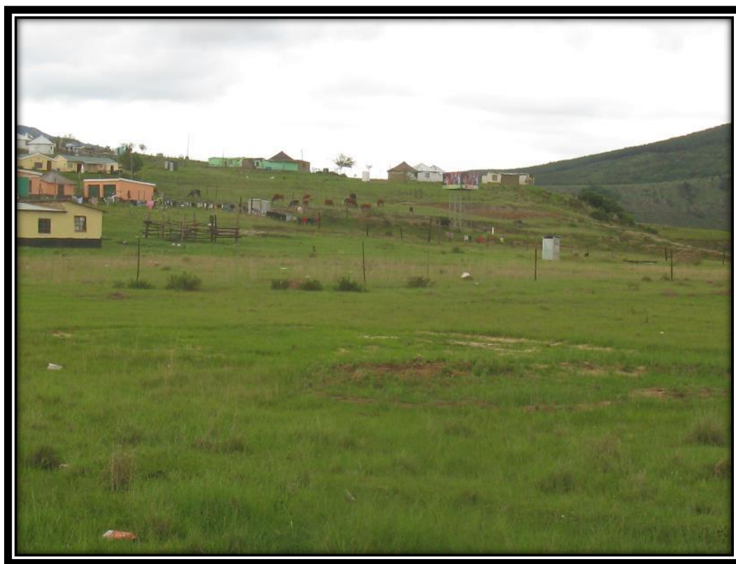
Figure 3. Open area demarcated for the proposed Riverside Cemetery.