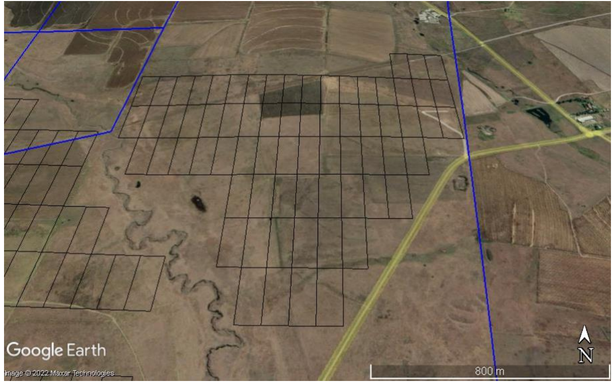
Fig 4: Vhuvhili Solar PVs – eastern area closeup.