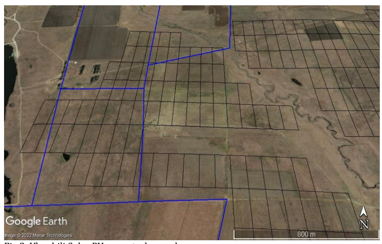
Fig 3: Vhuvhili Solar PVs – central area closeup.