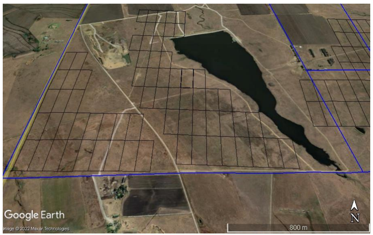
Fig 2: Vhuvhili Solar PVs – western area close-up.